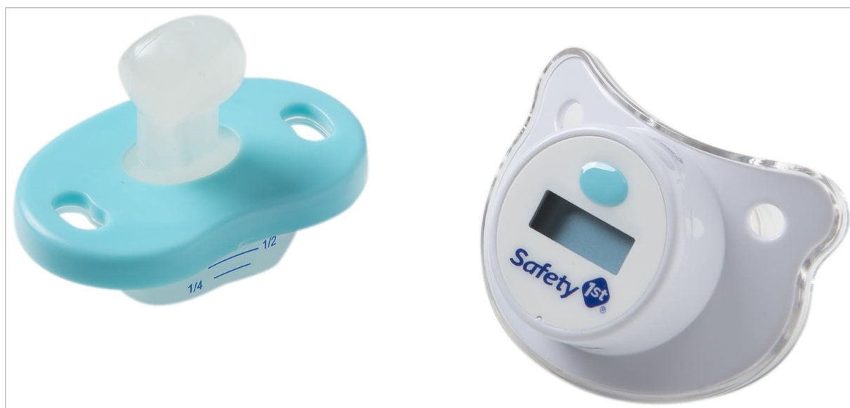
Image 3: The Safety 1st Comfort Check Pacifier Thermometer and Medicine Dispenser, showing the assembled unit ready for use.