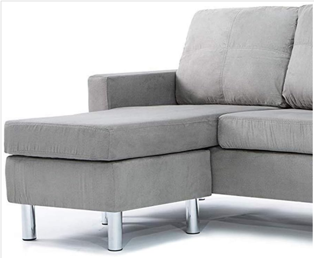
Figure 4.1: Close-up view of the aluminum leg and the connection mechanism for the chaise section.