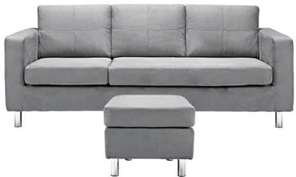
Figure 5.1: Various adjustable configurations of the sectional sofa.