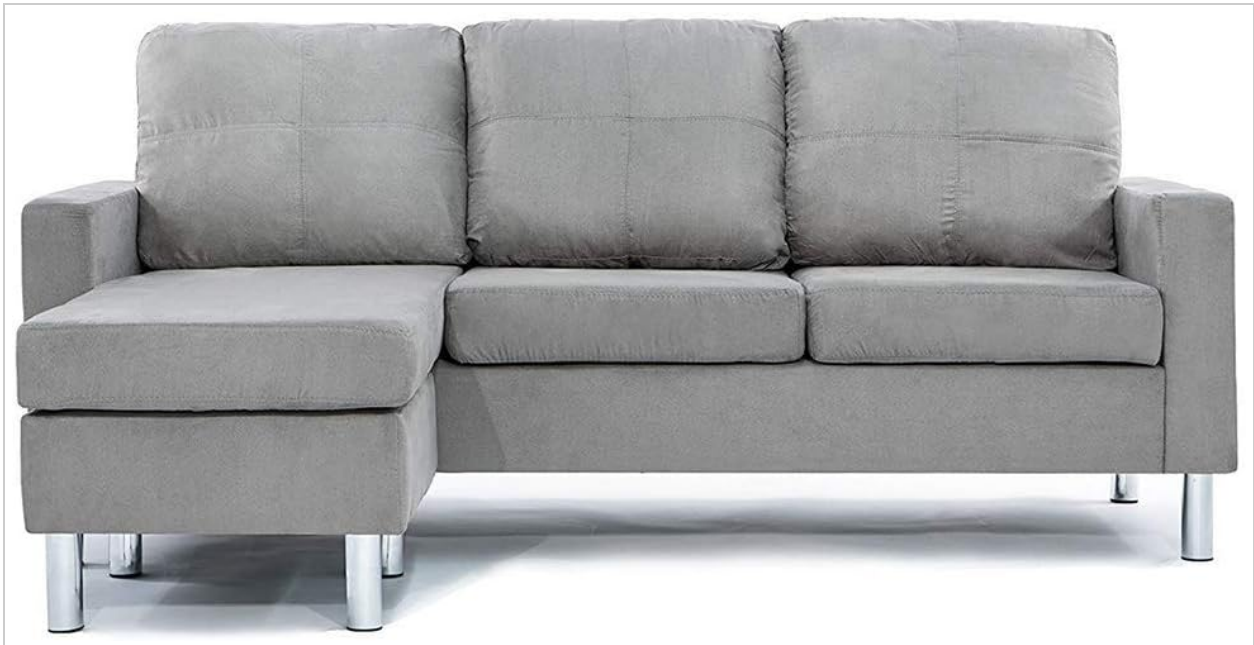
Figure 4.2: Fully assembled sectional sofa with chaise on the left.