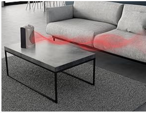
The Rowenta heater with an overlaid snowflake icon, representing its anti-frost protection setting.