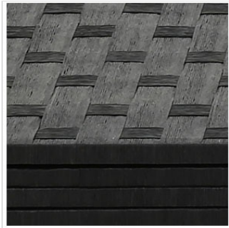
Image: Detailed view of the hand-woven wood mesh texture.