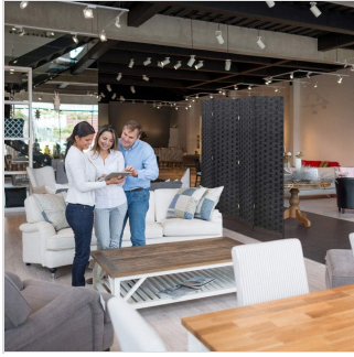
Image: Room divider providing separation in a large open space.