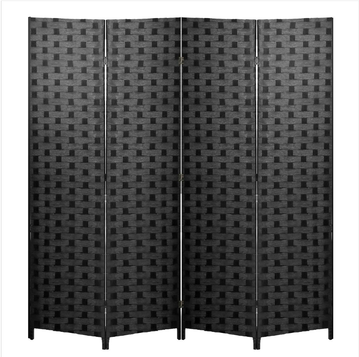
Image: The FDW 4-Panel Room Divider unfolded and standing in a room, demonstrating its ready-to-use state.