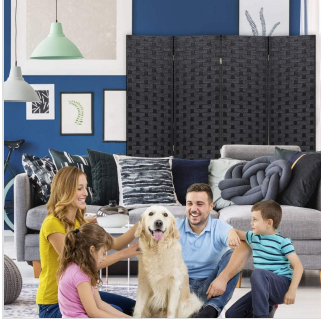
Image: Room divider used in a home setting, creating a cozy corner.