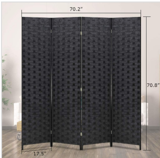
Image: Dimensional diagram of the room divider, showing height and width.