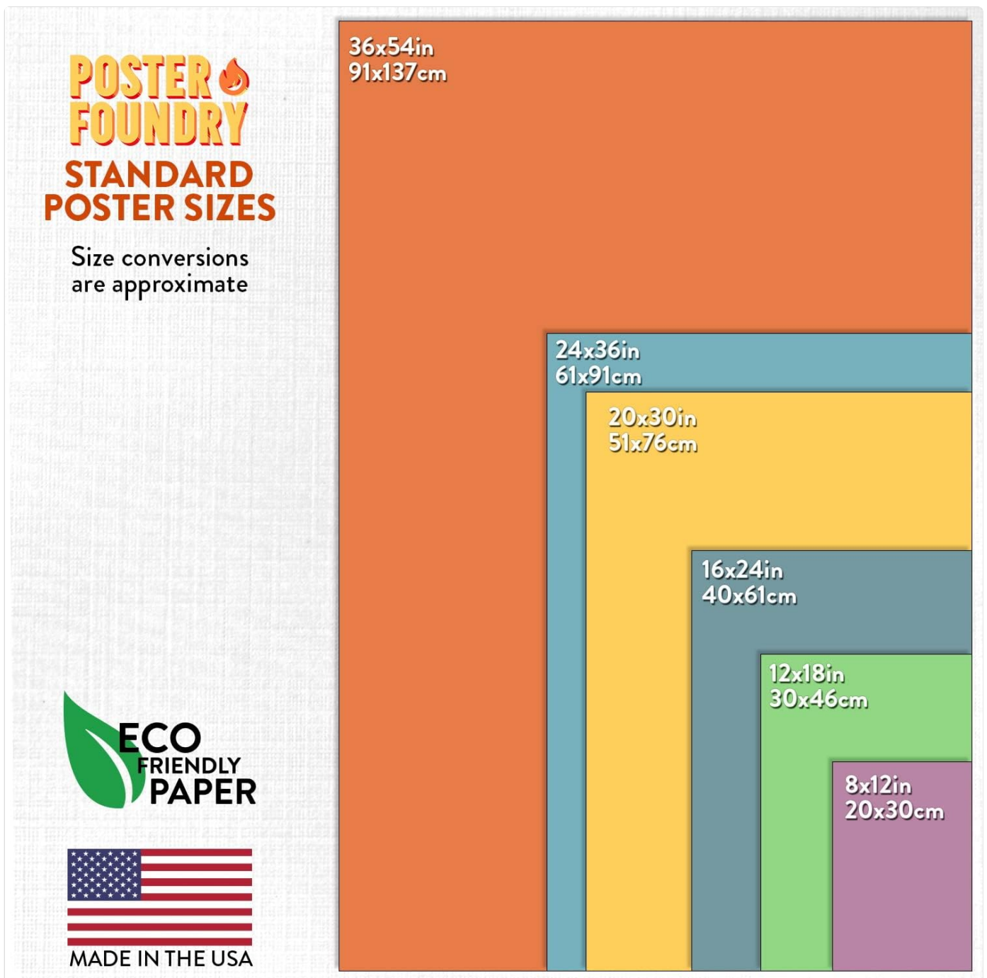
Figure 3: Standard poster sizes and their approximate conversions.