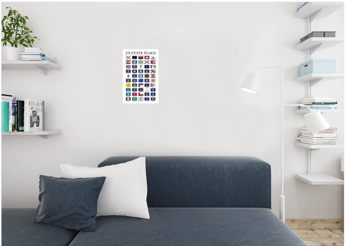
Figure 4: The poster displayed in a room, illustrating its visual impact.