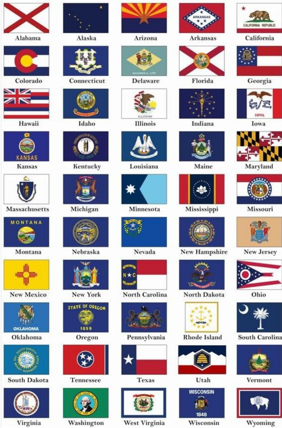
Figure 1: Overview of the US State Flags Poster, displaying all 50 state flags.