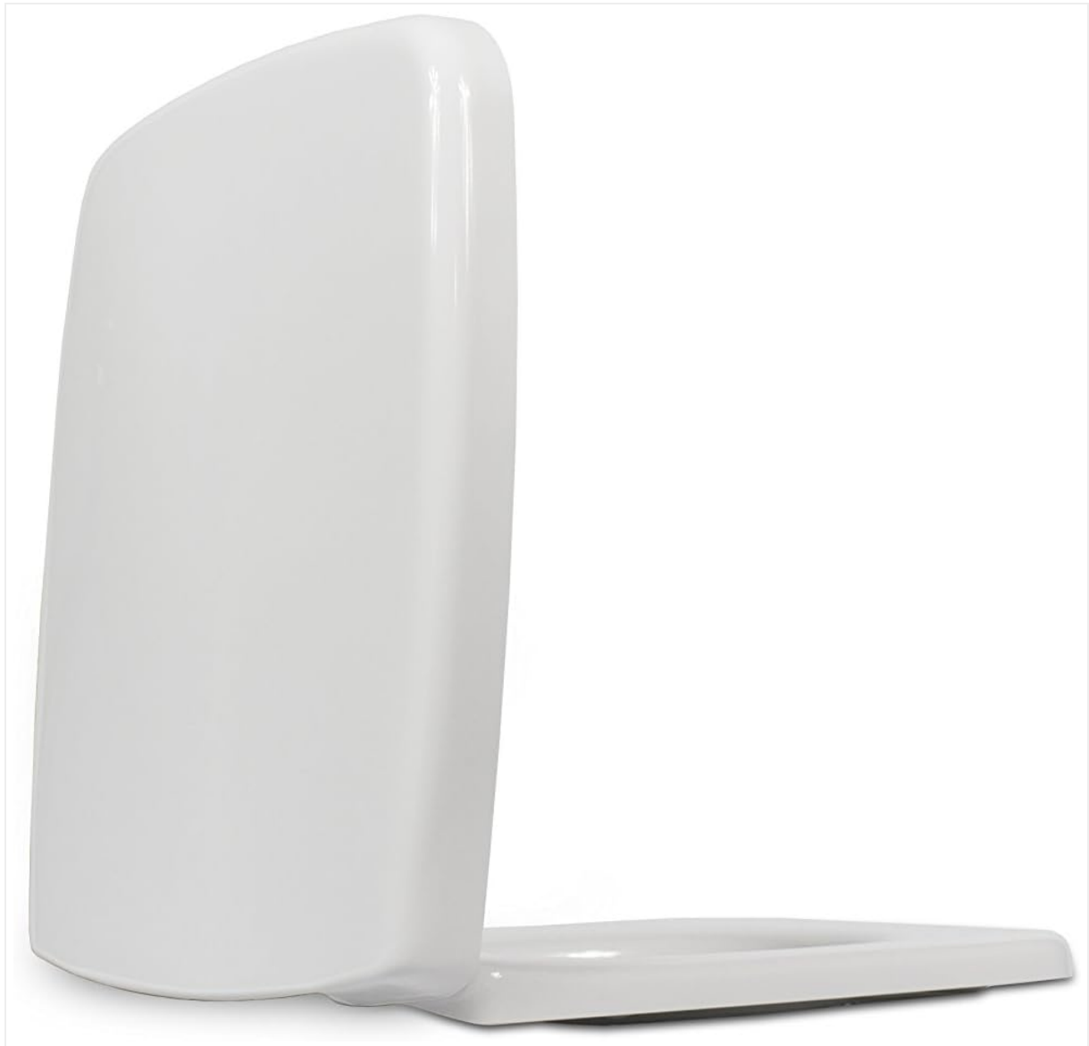
Image: Side view of the Cantica toilet seat, illustrating its profile when open.

Note: This model does not feature a soft-closing mechanism. Exercise care when lowering the seat and lid to prevent damage or injury.