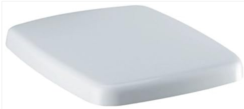
Image: Top view of the Cantica toilet seat, showcasing its rectangular shape and white finish.

The Ideal Standard Cantica toilet seat is an original component designed for durability and comfort. It is constructed from high-quality duroplastic material and includes robust metal hinges for secure attachment.