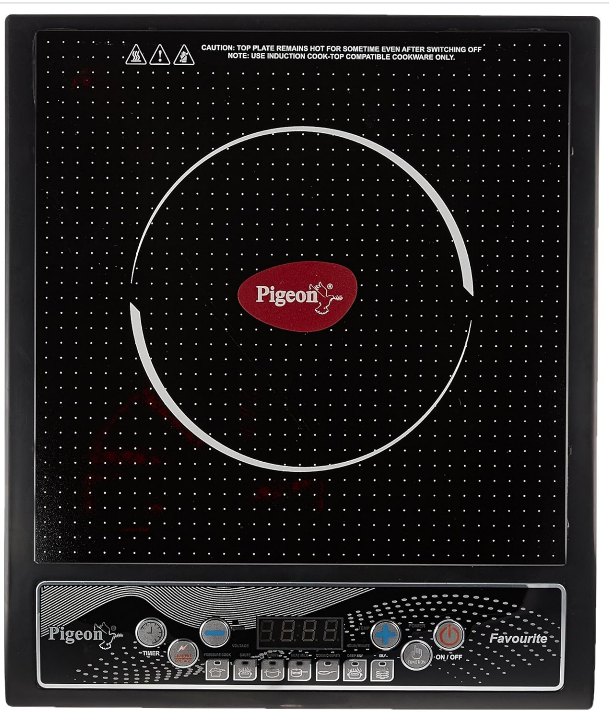
Image 1.1: Overview of the Pigeon By Stovekraft Favourite 1800-Watt Induction Cooktop.