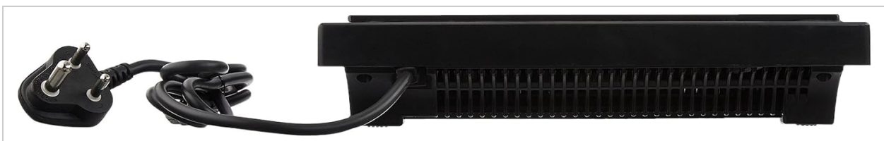
Image 3.2: Side view of the induction cooktop, illustrating the ventilation grilles and the attached power cord.