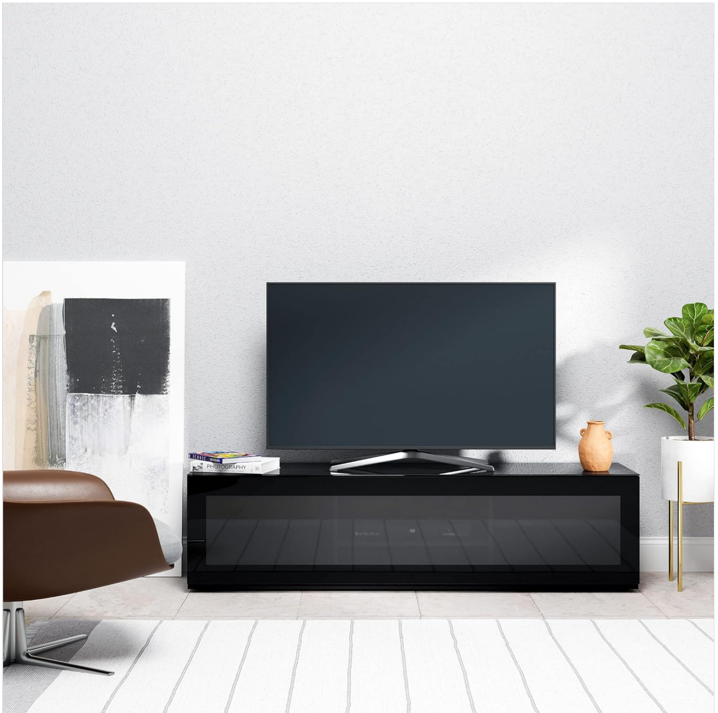
Image 1.1: The SONOROUS ST-160 TV Stand in a living room environment.