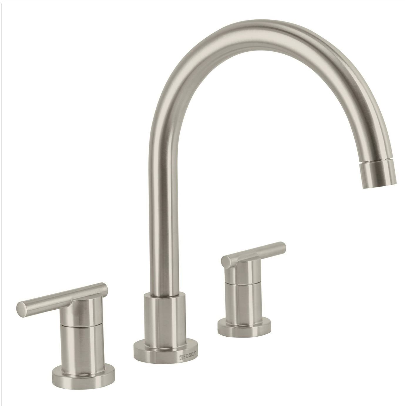
Image: Foset Element ELF-81N High-Neck Kitchen Faucet, Satin Finish. This image displays the complete faucet unit, including the high-arc spout and two metal handles, ready for installation.