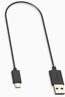
To PC Cable (Micro-B to USB-A)