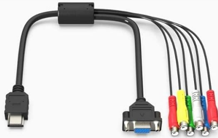
MMI Cable (VGA/RCA/YPbPr Adapter)