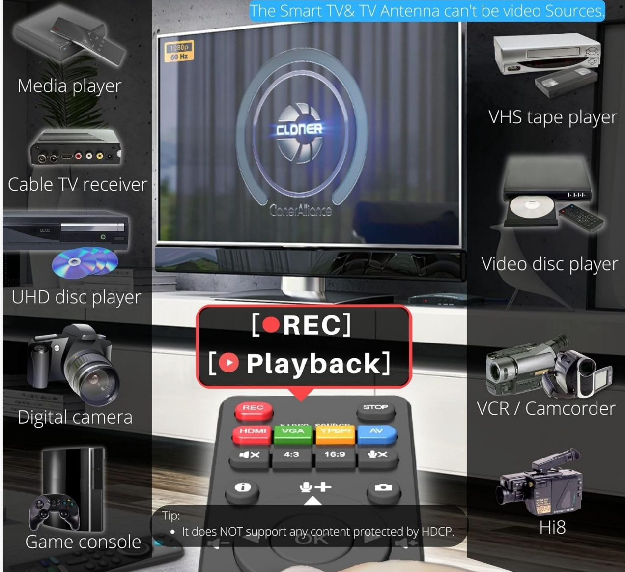
Image 4.2: Example setup showing various compatible input devices.

The Smart TV & TV Antenna can't be video Sources