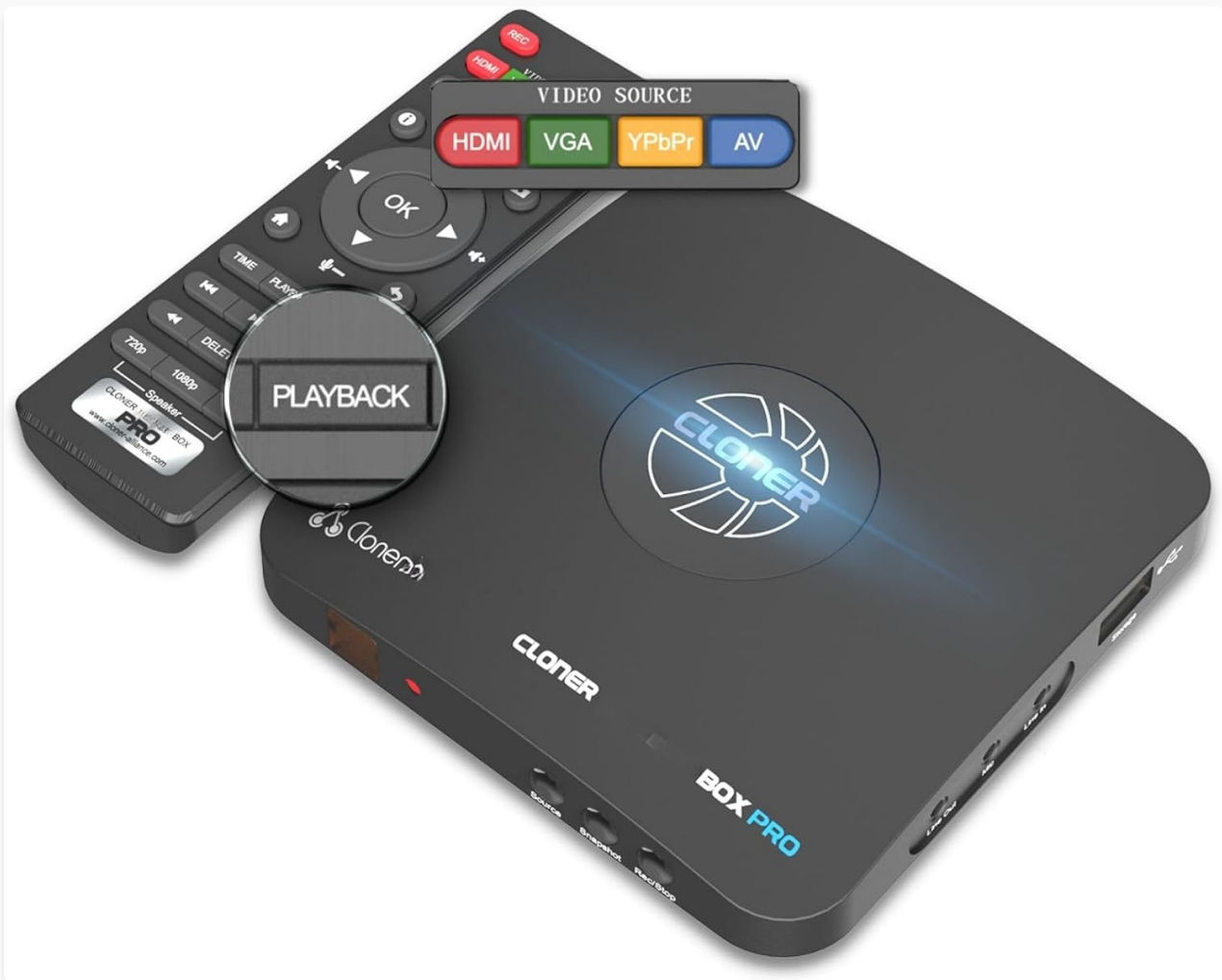
Image 8.1: Bottom label of the ClonerAlliance Box Pro with product information.