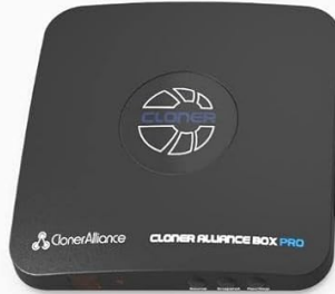
ClonerAlliance Box Pro