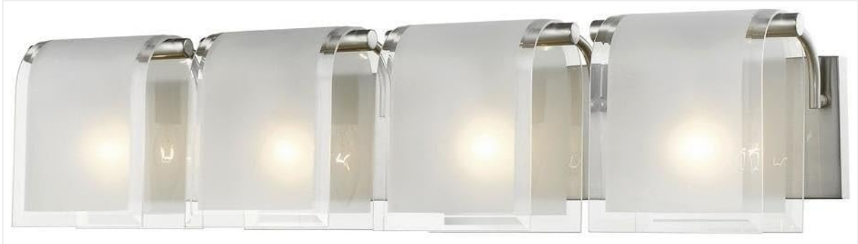
Image 1: The Z-Lite 169-4V-BN 4-Light Brushed Nickel Vanity Fixture with its four frosted glass shades.