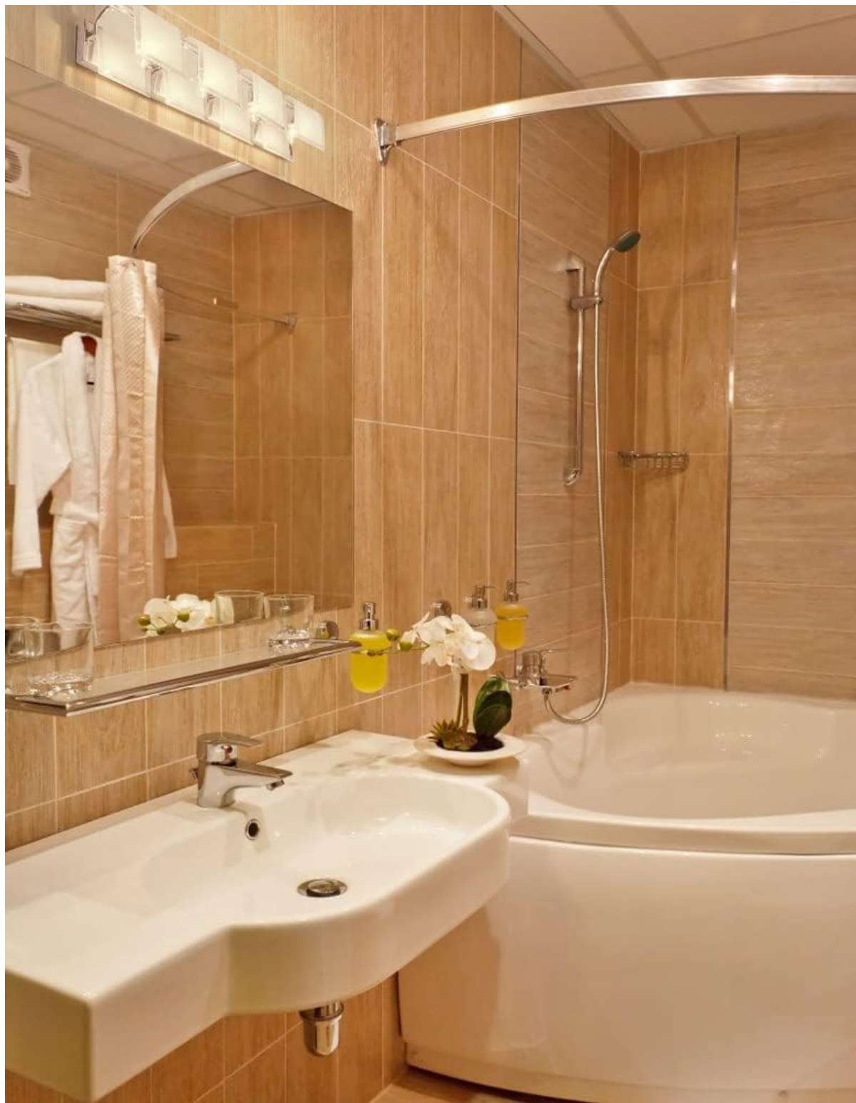
Image 2: The Z-Lite 169-4V-BN vanity light installed above a mirror in a contemporary bathroom setting.