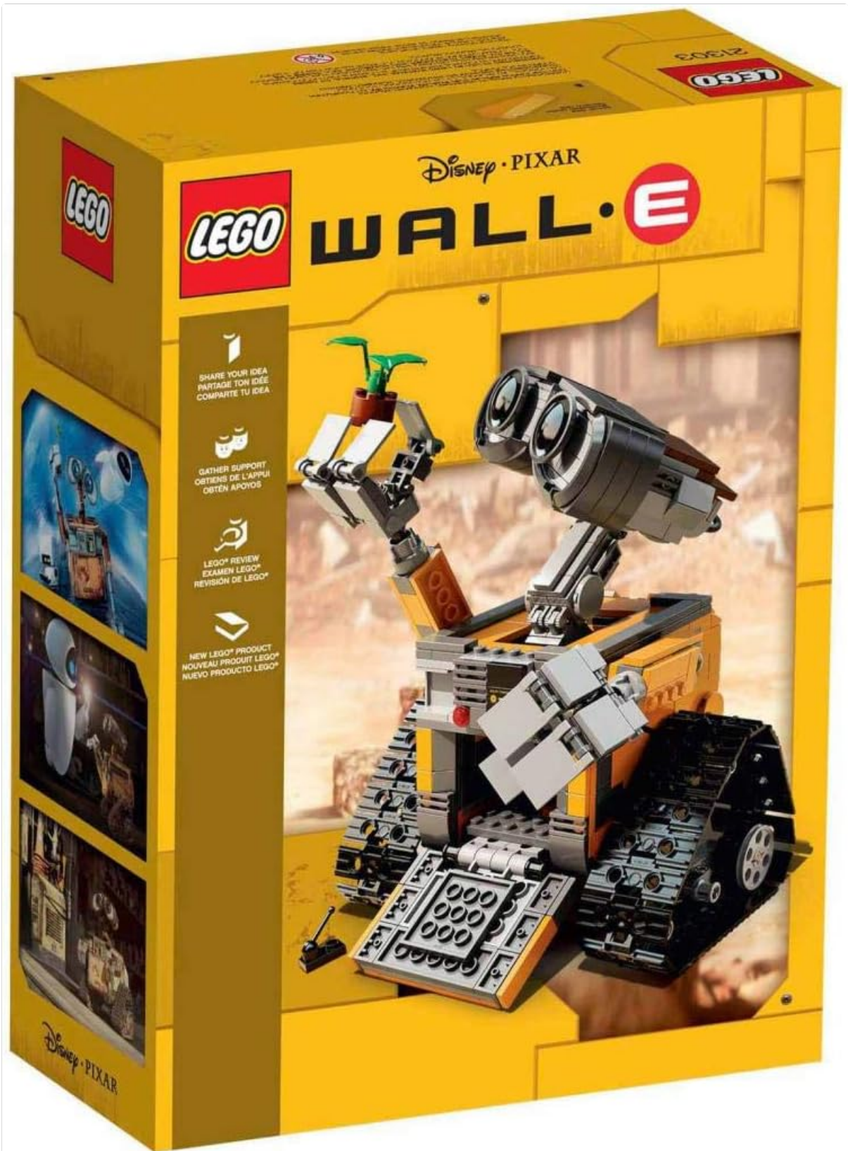
Figure 2: Rear view of the LEGO Ideas 21303 WALL-E box, displaying the robot from a different angle and highlighting features.