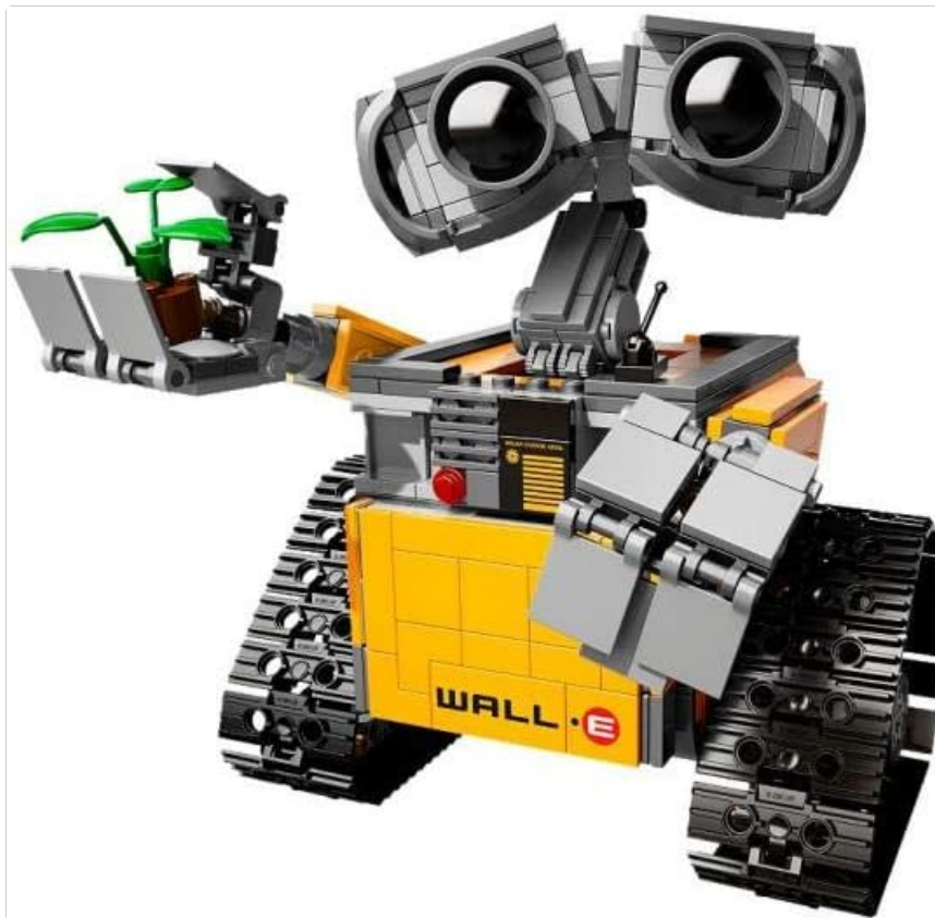
Figure 4: Close-up front view of the LEGO WALL-E model, showcasing its posable eyes and the plant held in its gripping hands.