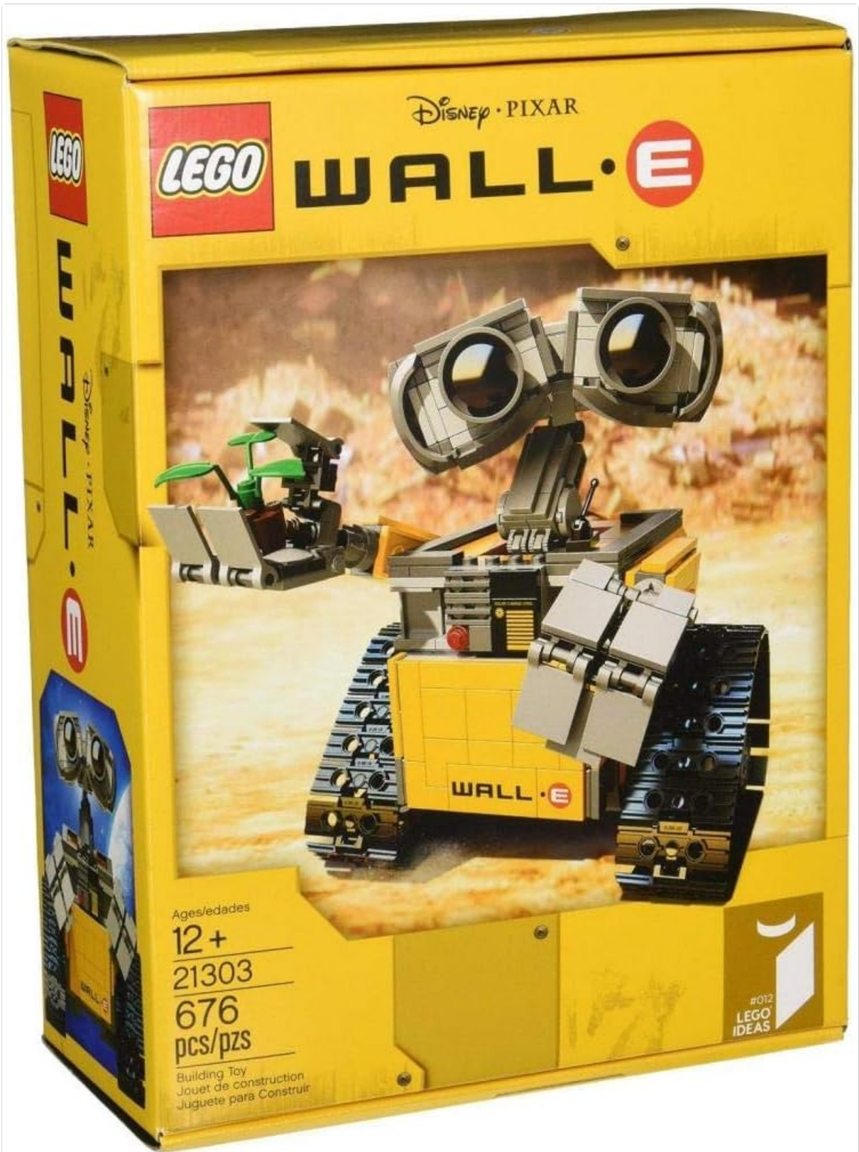
Figure 1: Front view of the LEGO Ideas 21303 WALL-E box, showing the assembled robot with a small plant in its hand.