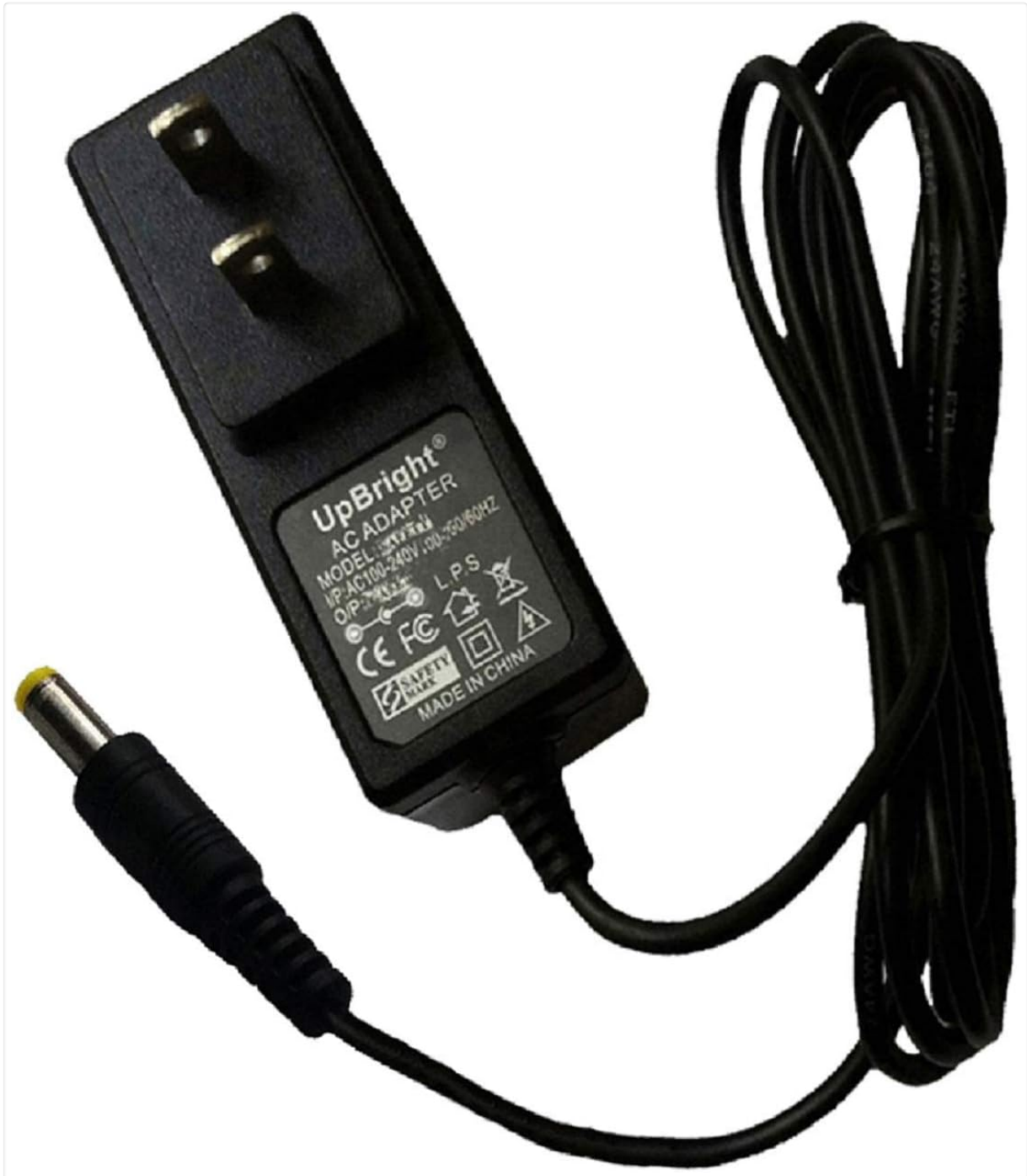
Image: The UpBright 5V AC/DC Adapter, featuring a black casing, standard US two-prong plug, and an attached cable terminating in a yellow barrel connector.