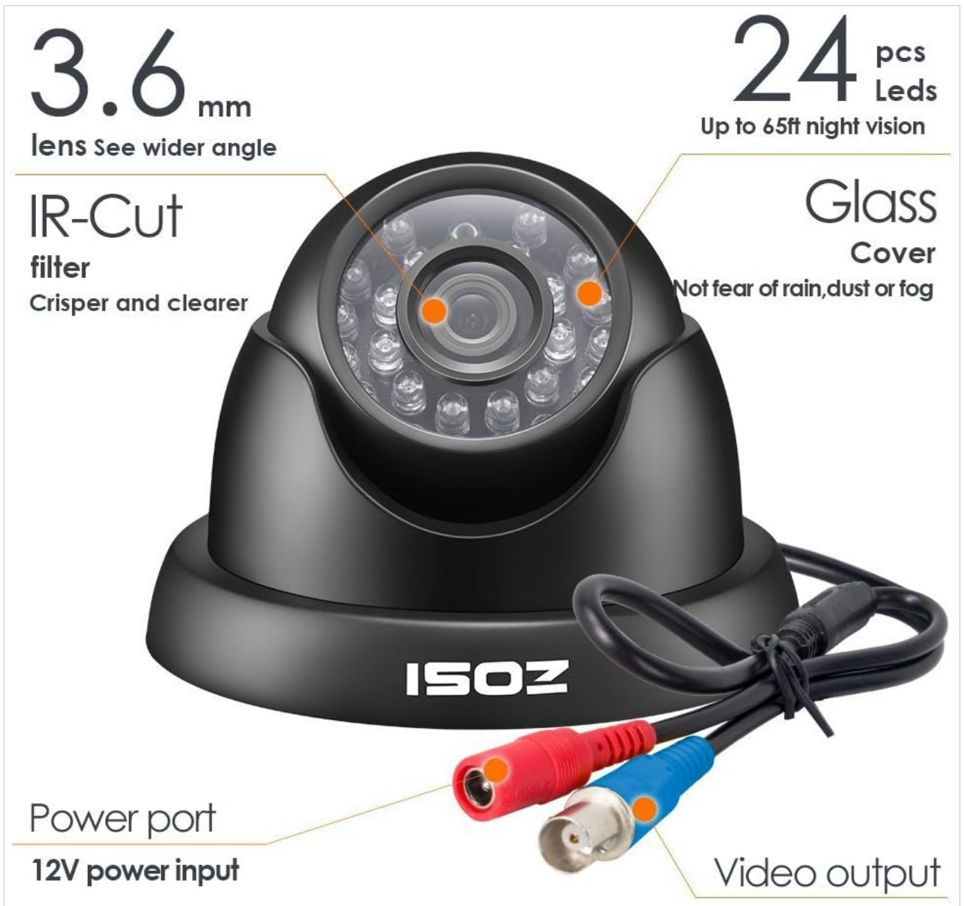
Figure 7.2: Detailed specifications for the ZOSI dome camera, including 3.6mm lens, IR-Cut filter, 24 IR LEDs for night vision, and glass cover.