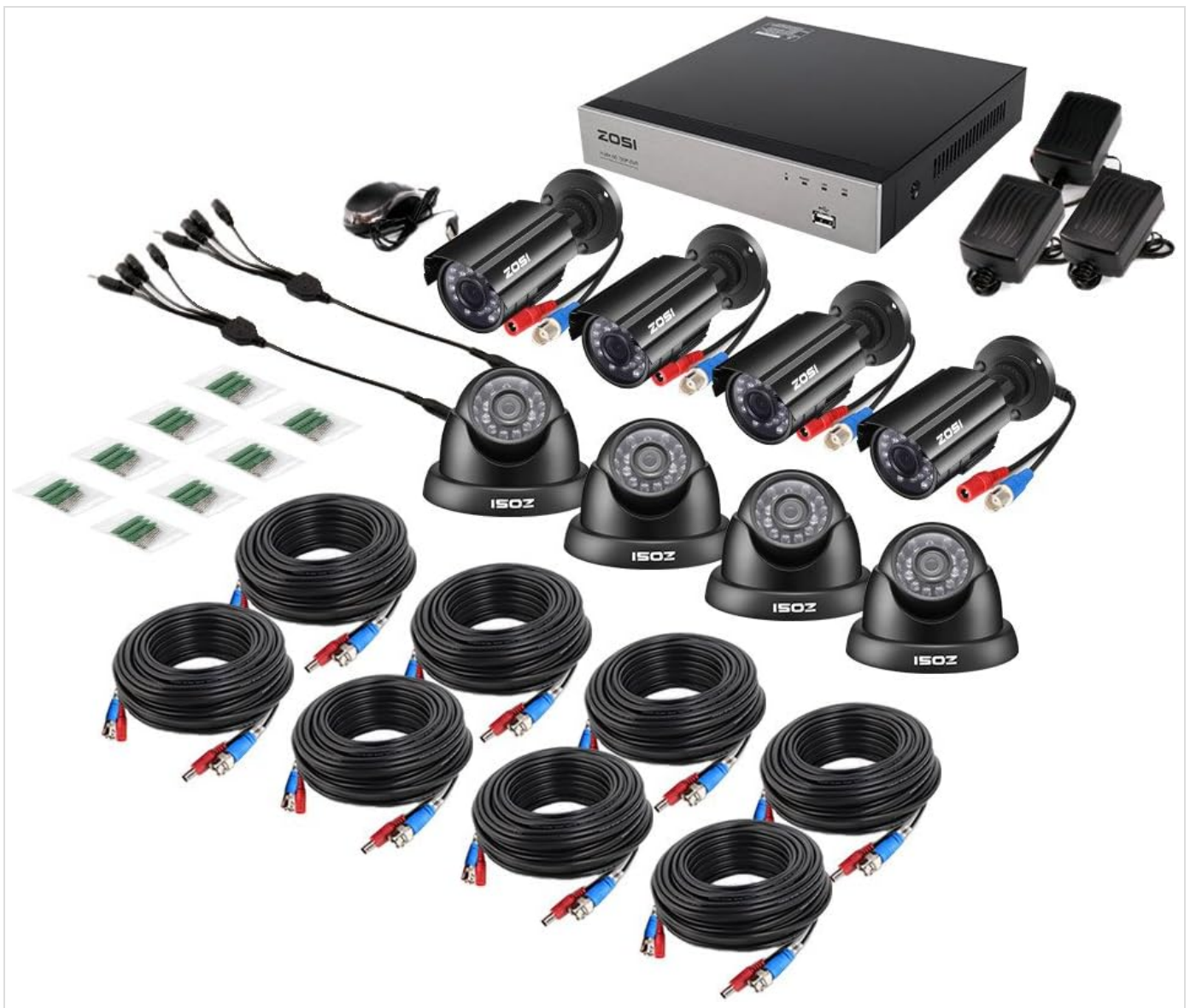
Figure 2.1: All components included in the ZOSI 8CH Security Camera System package.