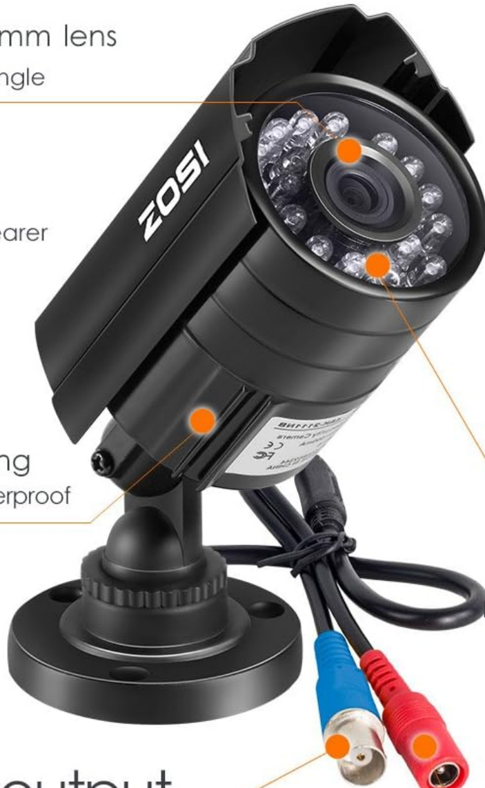
Figure 7.1: Detailed specifications for the ZOSI bullet camera, including 3.6mm lens, IR-Cut filter, IP67 rating, 24 IR LEDs for night vision, and glass cover.