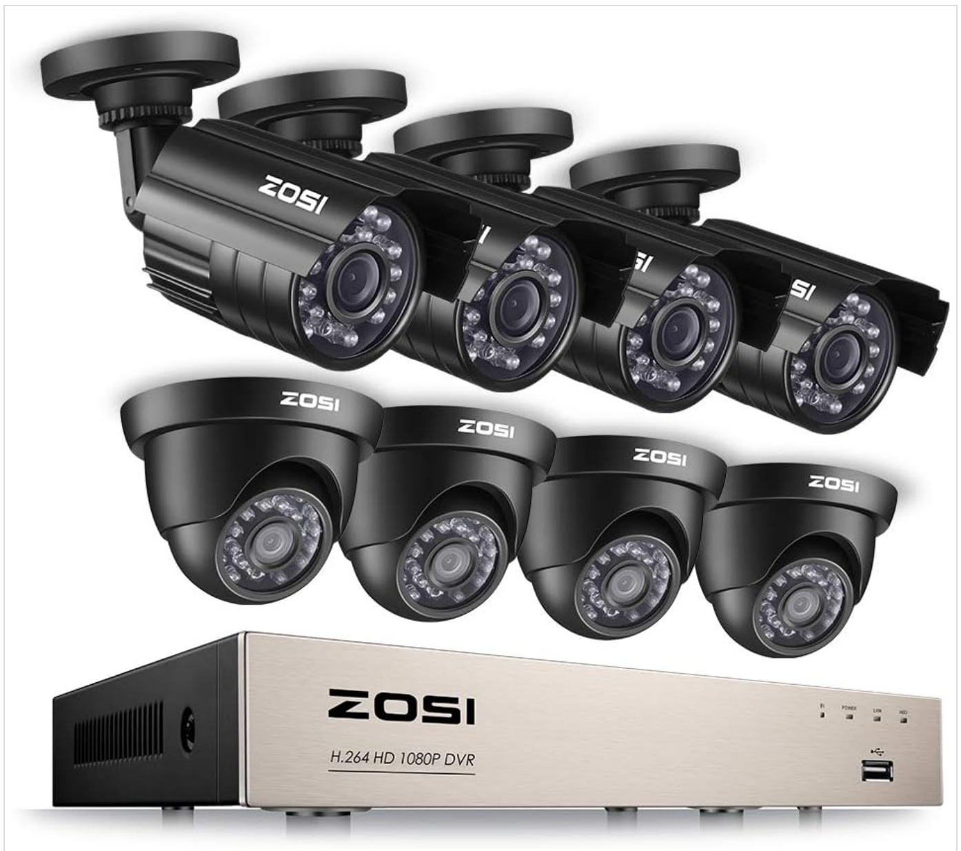
Figure 1.1: ZOSI 8CH Security Camera System overview, showing the DVR unit and a mix of bullet and dome cameras.