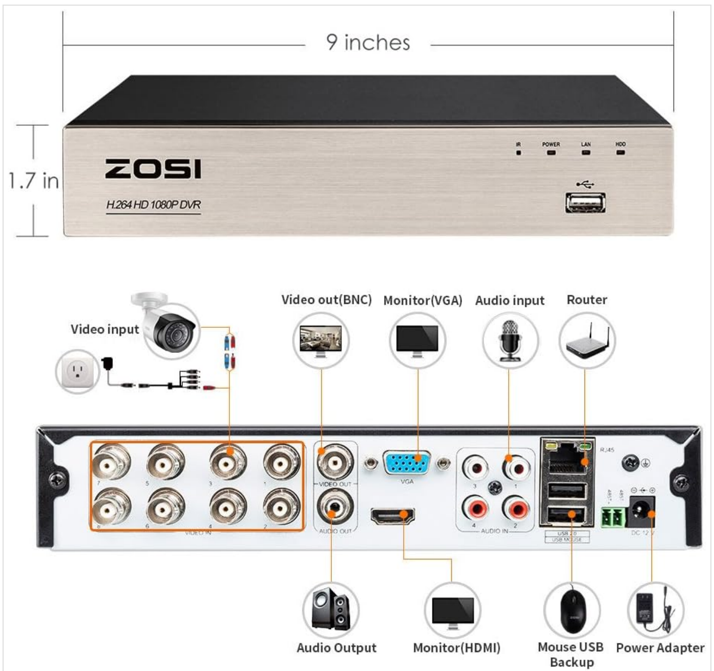
Figure 3.3: Detailed view of the ZOSI DVR's rear panel, showing video input (BNC), video output (VGA, HDMI), audio input/output, LAN, USB, and power ports.