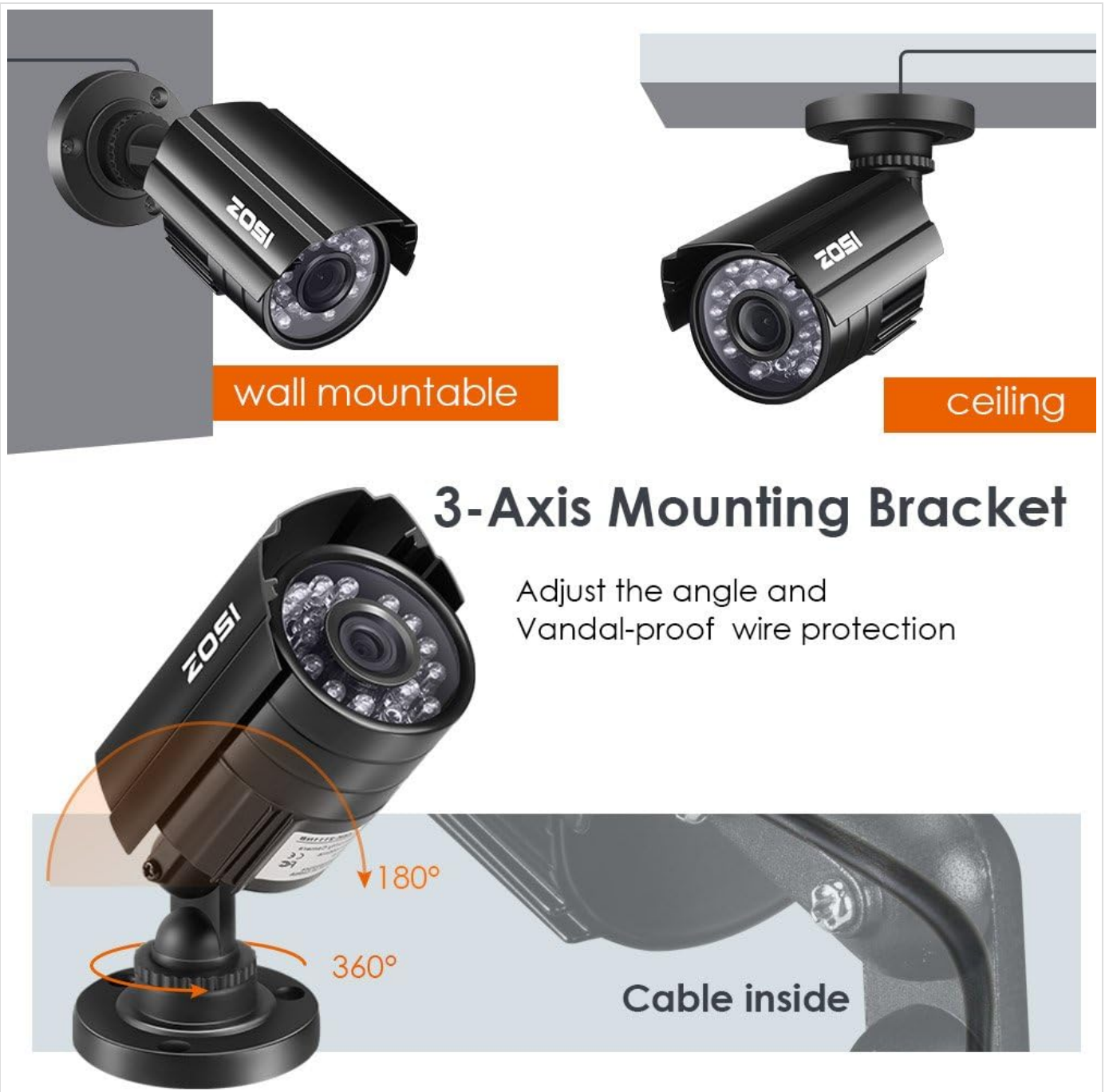
Figure 3.1: Illustration of wall and ceiling mounting options, highlighting the 3-axis adjustable bracket and internal cable routing.