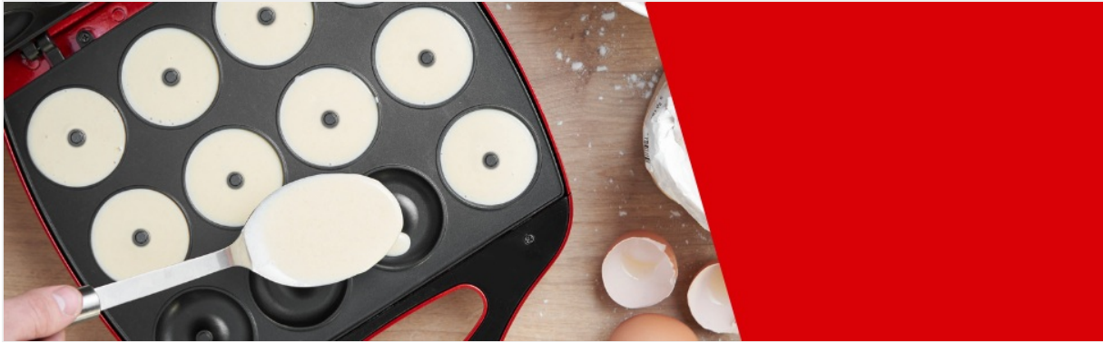
Image: A close-up view of the VonShef Mini Donut Maker's lower plate, with batter being carefully spooned into the donut molds.