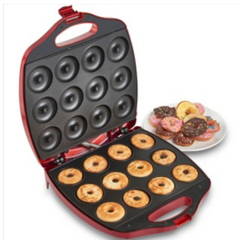
Image: The VonShef Mini Donut Maker open, displaying a batch of freshly baked, golden-brown mini donuts in the molds.