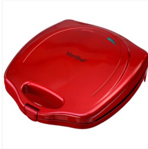
Image: The VonShef Mini Donut Maker in its closed position, showcasing its compact design and red exterior.