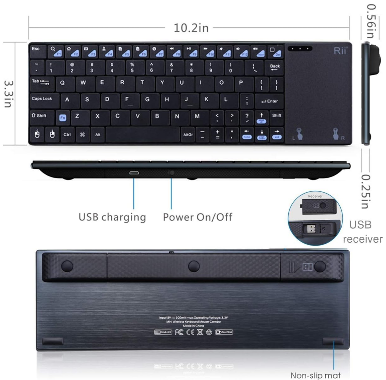
Image: Detailed view of the keyboard's side and back, indicating the USB charging port, power switch, and the storage location for the USB receiver.