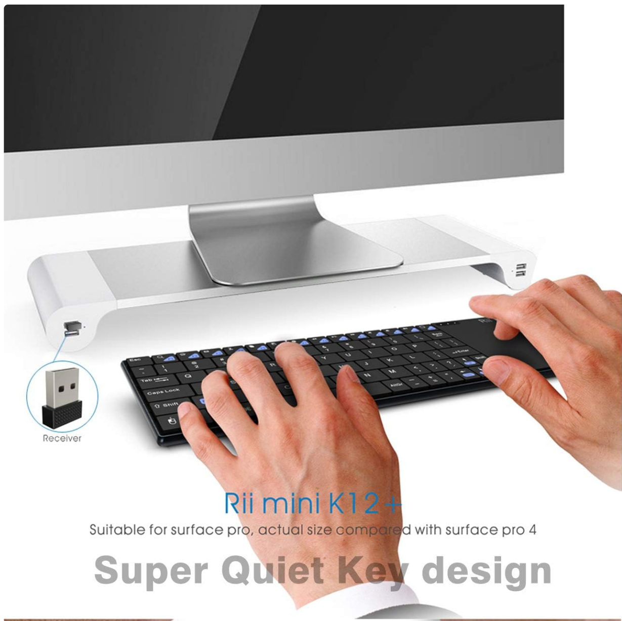
Image: The keyboard in use with a desktop computer, showing the USB receiver plugged into a port.