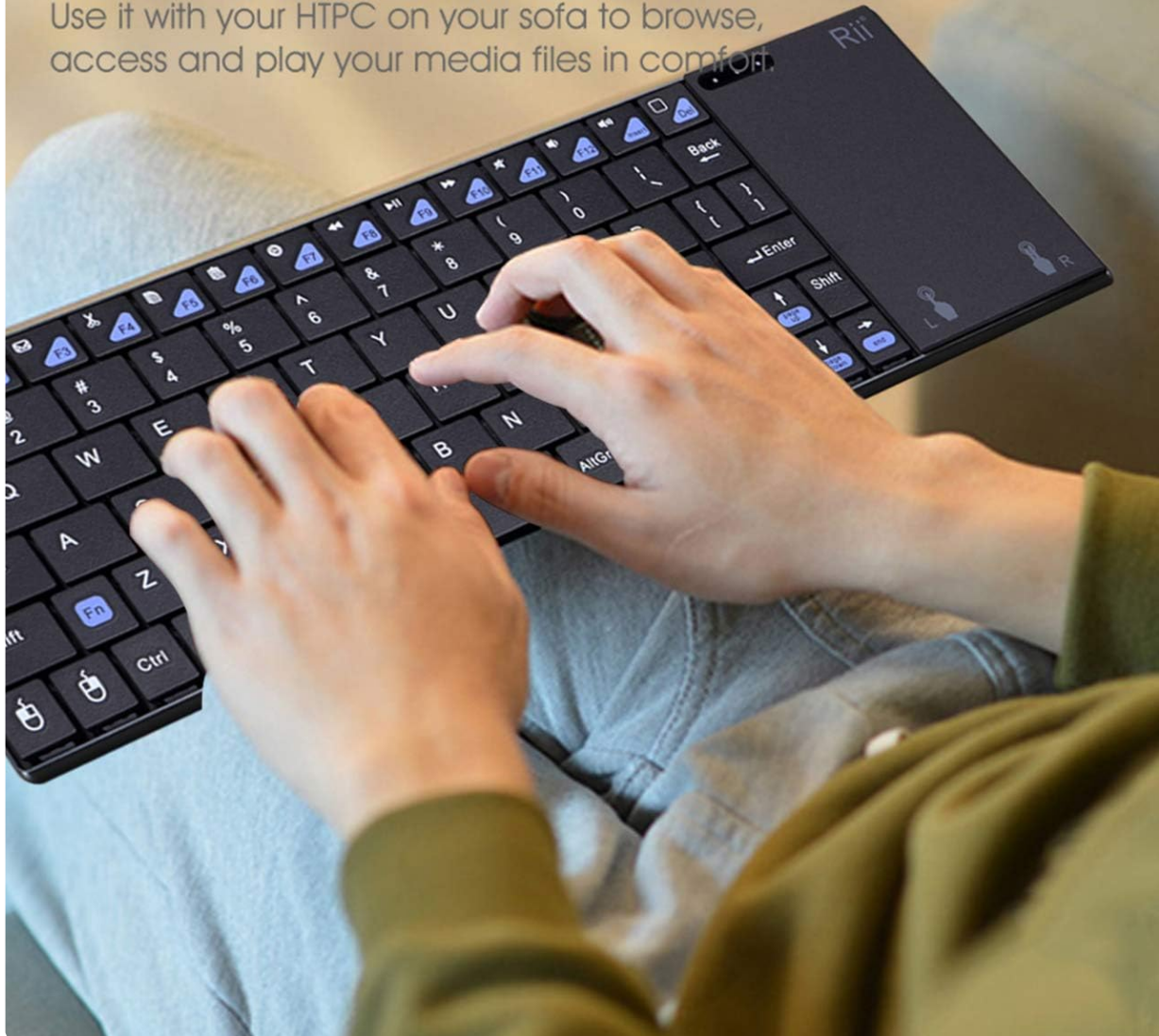
Image: The Rii K12+ Mini Wireless Keyboard being used, demonstrating its compact and portable nature.

Use it with your HTPC on your sofa to browse, access and play your media files in comfort.