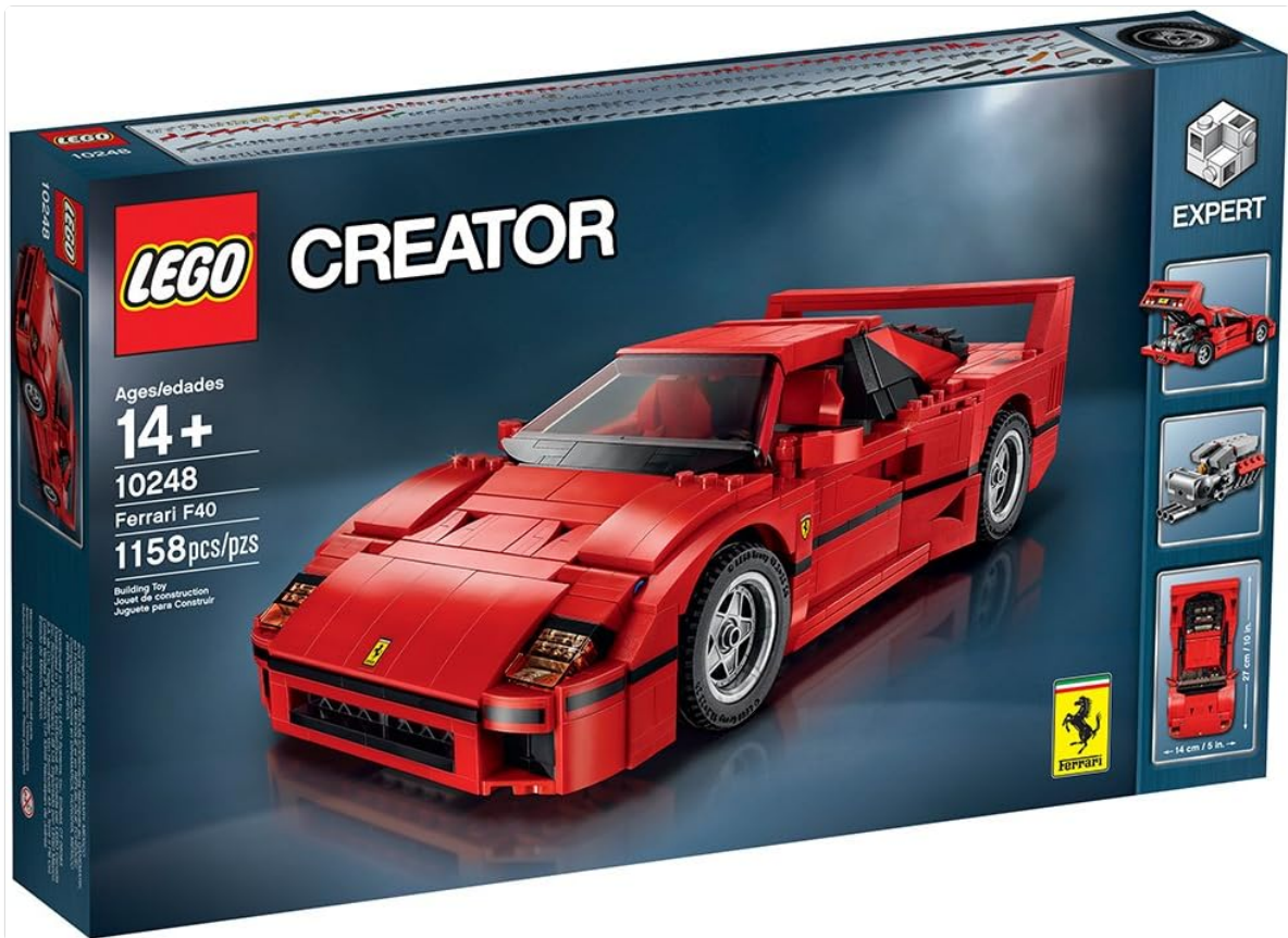
Figure 2.1: The front of the LEGO Creator Expert Ferrari F40 packaging. The box displays the fully assembled red Ferrari F40 model, highlighting its sleek design and the LEGO Creator Expert branding. The set number 10248 and piece count (1158 pcs) are visible.