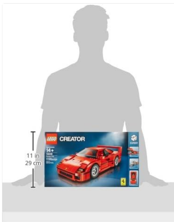
Figure 6.1: Packaging dimensions for the LEGO Creator Expert Ferrari F40. The image illustrates the box size, providing a visual reference for the product's physical footprint.