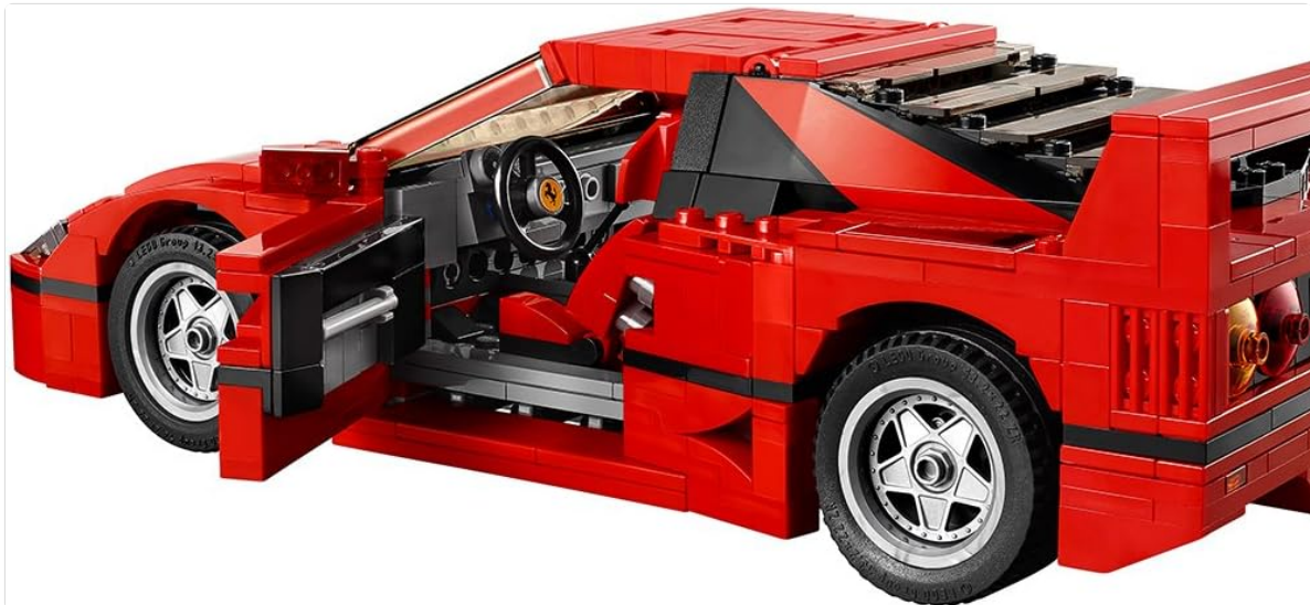
Figure 3.1: The LEGO Ferrari F40 with its door open, showcasing the meticulously designed interior. Visible details include the steering wheel, dashboard, and red racing seats.

The driver and passenger doors can be opened to reveal the detailed interior. Inside, you will find crafted cabled door handles, a steering wheel with the Ferrari logo, and two red racing seats.