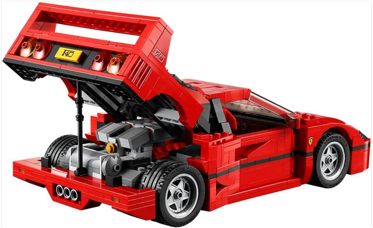
Figure 3.2: The rear of the LEGO Ferrari F40 with its engine compartment open. The detailed brick-built replica of the twin-turbocharged V8 engine is clearly visible, along with the rear spoiler and taillights.