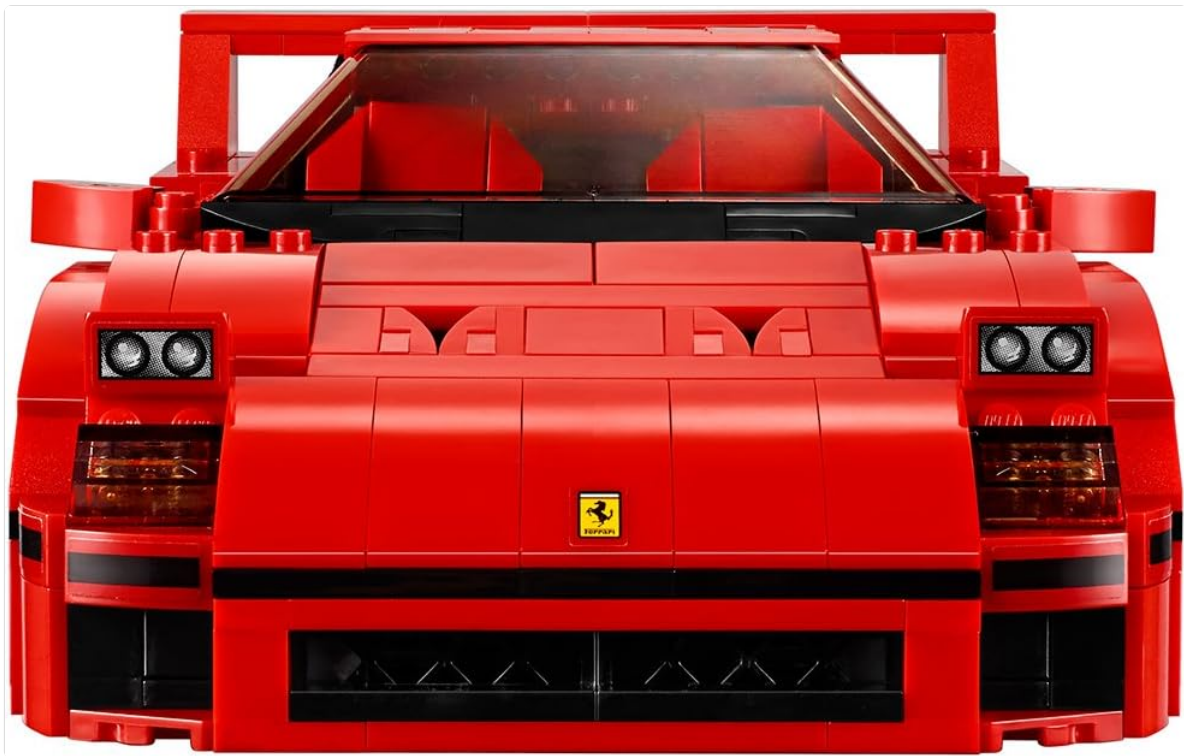
Figure 3.4: A direct front view of the LEGO Ferrari F40. The pop-up headlights are shown in their extended position, adding to the dynamic appearance of the model.