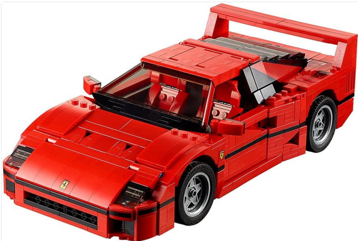
Figure 2.2: An overhead view of the completed LEGO Creator Expert Ferrari F40. The model showcases its distinctive

Refer to the dedicated instruction booklet provided within the box. Each step illustrates the placement of specific bricks. Ensure all connections are firm to maintain the structural integrity of the model.