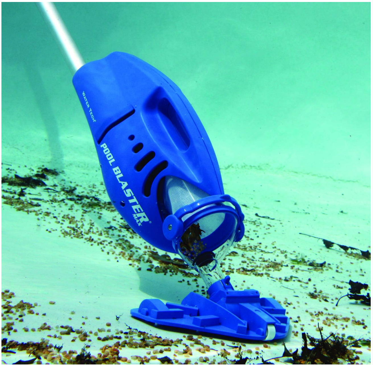
Figure 6.2: The vacuum effectively collecting various debris from the pool bottom.