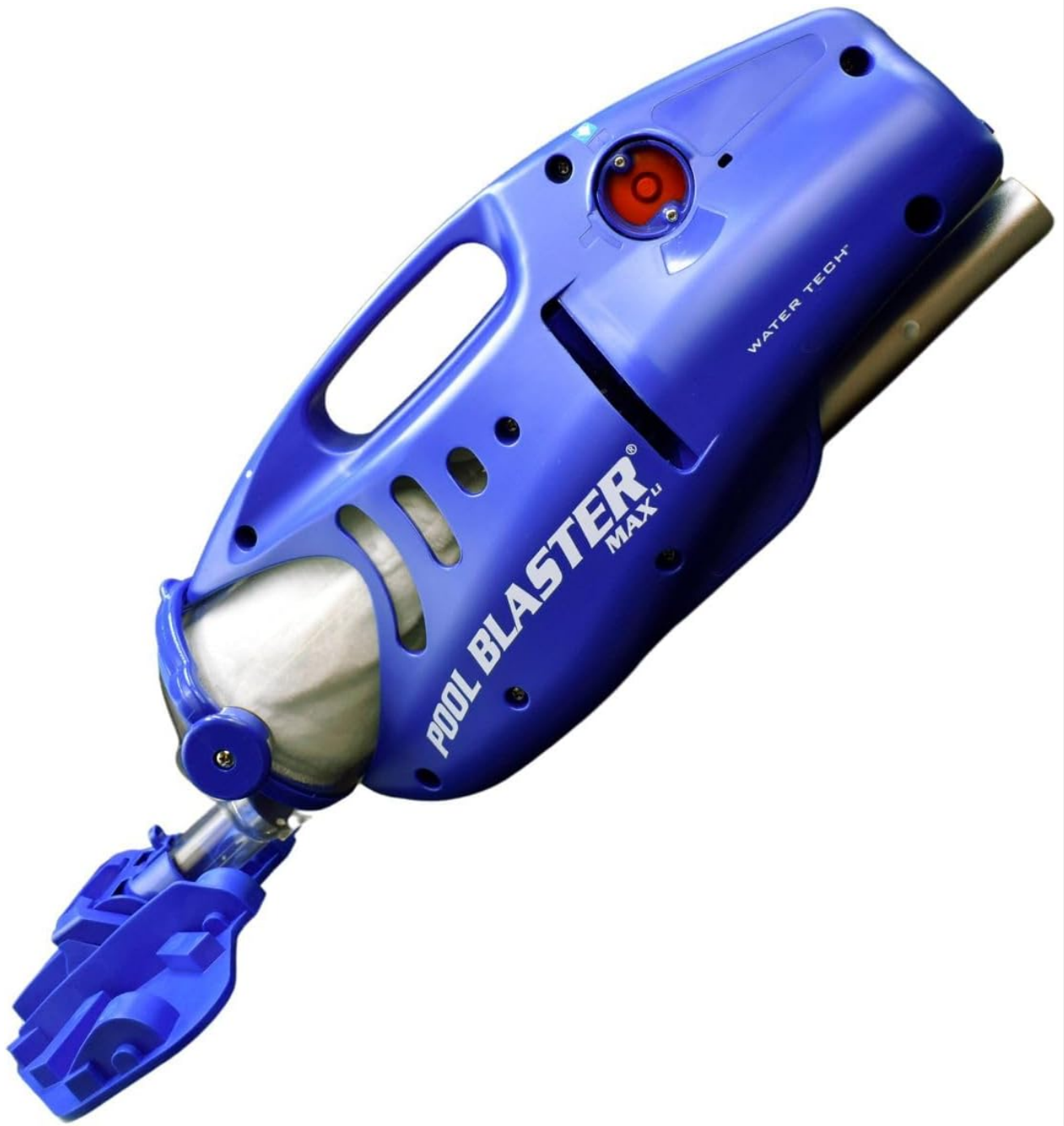
Figure 4.1: The Aqualux Pool Blaster Max Li cordless vacuum cleaner, showing its ergonomic design and attachment points.

The unit consists of the main body housing the motor and battery, a removable filter bag compartment, and an adjustable wide head for efficient debris collection. The charging port is located on the main body.