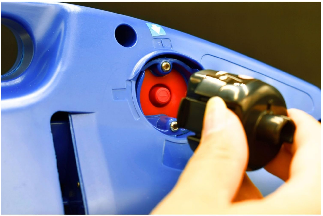
Figure 5.1: Detail of the charging port on the vacuum unit.