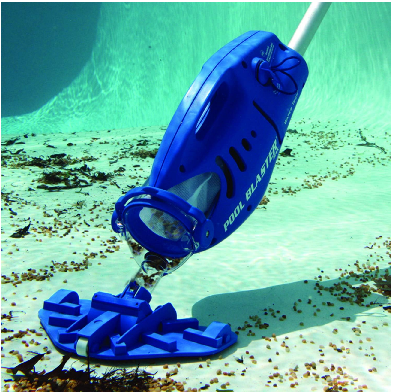
Figure 6.3: The vacuum in operation, demonstrating the water flow and suction capability.