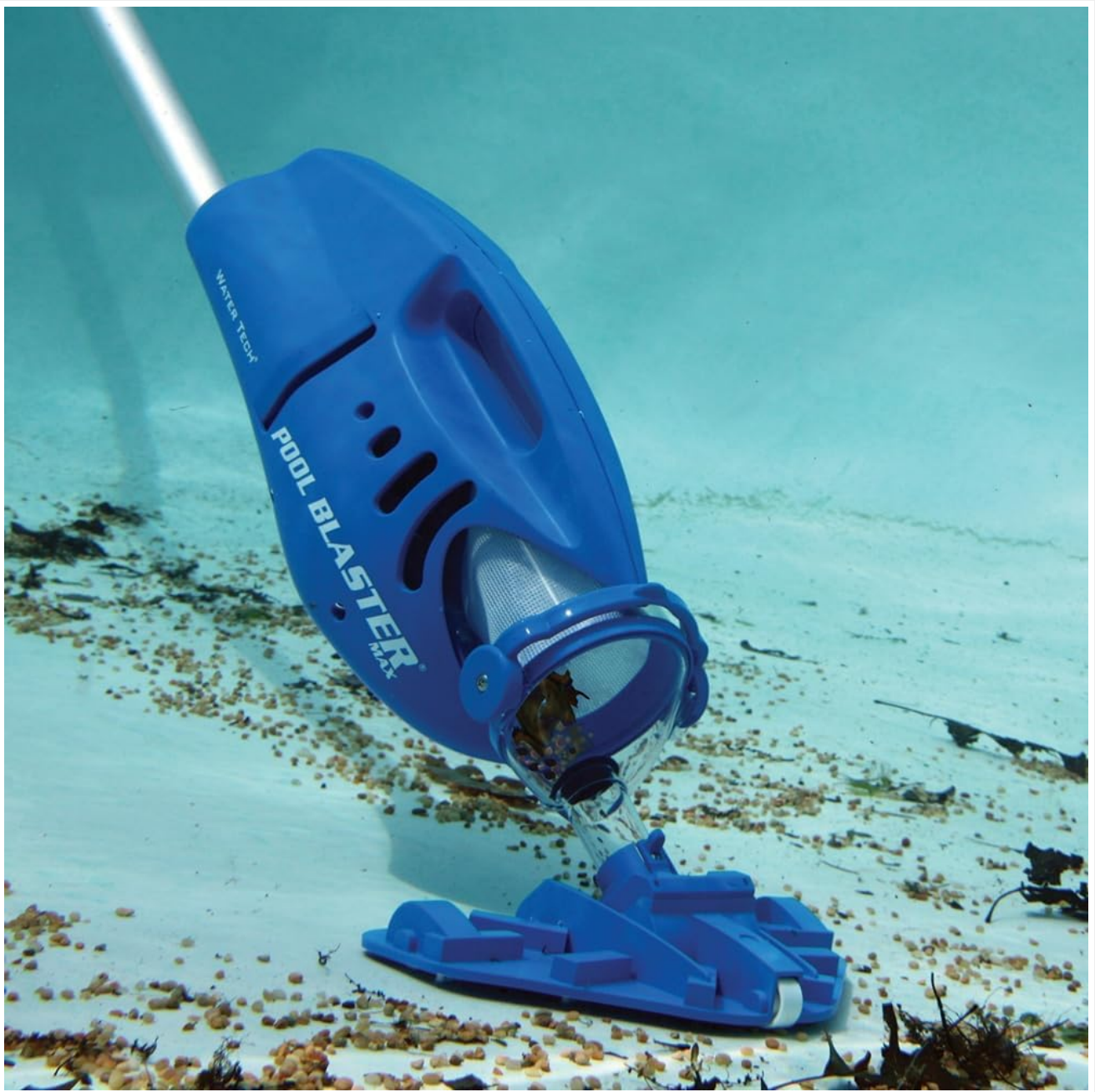
Figure 6.1: The vacuum unit submerged and actively cleaning the pool floor.