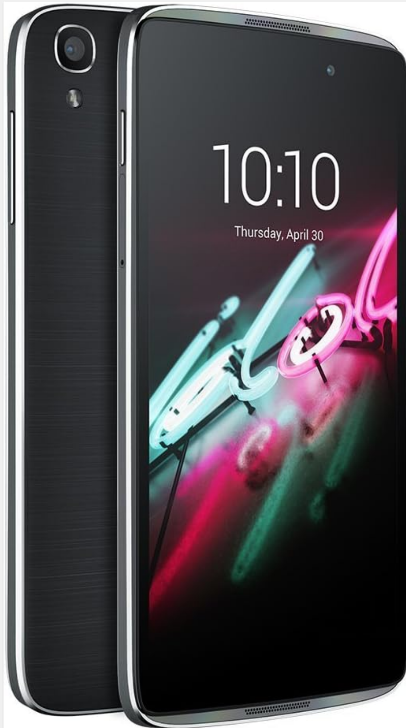
Image 2.3: Angled View. This image presents the ALCATEL OneTouch Idol 3 from an angled perspective, highlighting both the front display and a portion of the dark gray rear panel. The slim profile of the device is evident, along with the front speaker grilles and the rear camera.