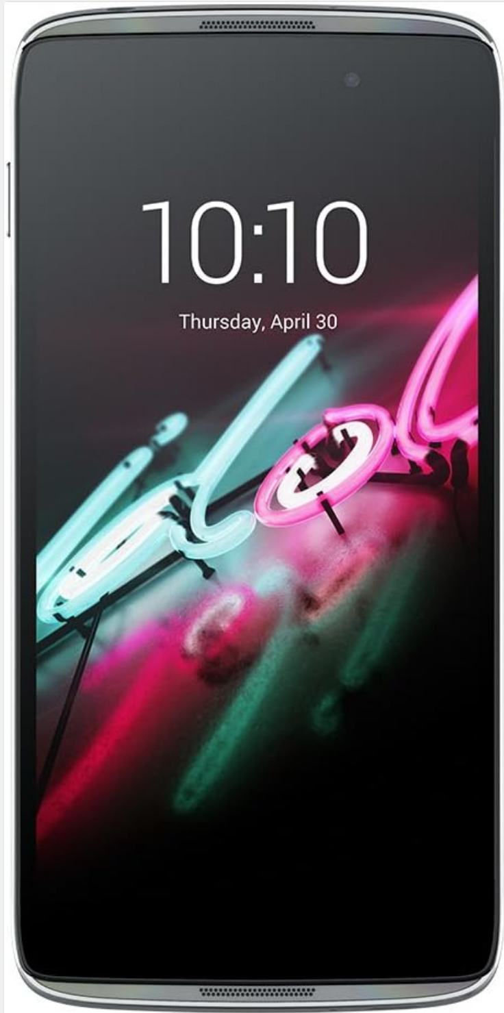
Image 2.1: Front View. This image shows the front of the ALCATEL OneTouch Idol 3 smartphone. The screen displays the time '10:10' and the date 'Thursday, April 30' over a colorful neon light background. The top and bottom bezels feature speaker grilles, indicating front-facing stereo speakers.