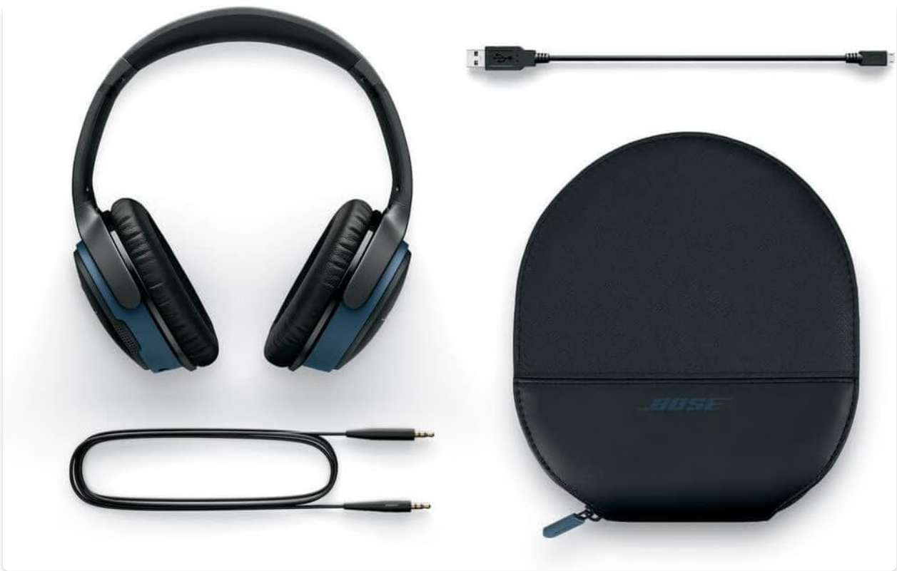
Image: Bose SoundLink Around Ear Wireless Headphones II, USB charging cable, backup audio cable, and hard carrying case laid out.