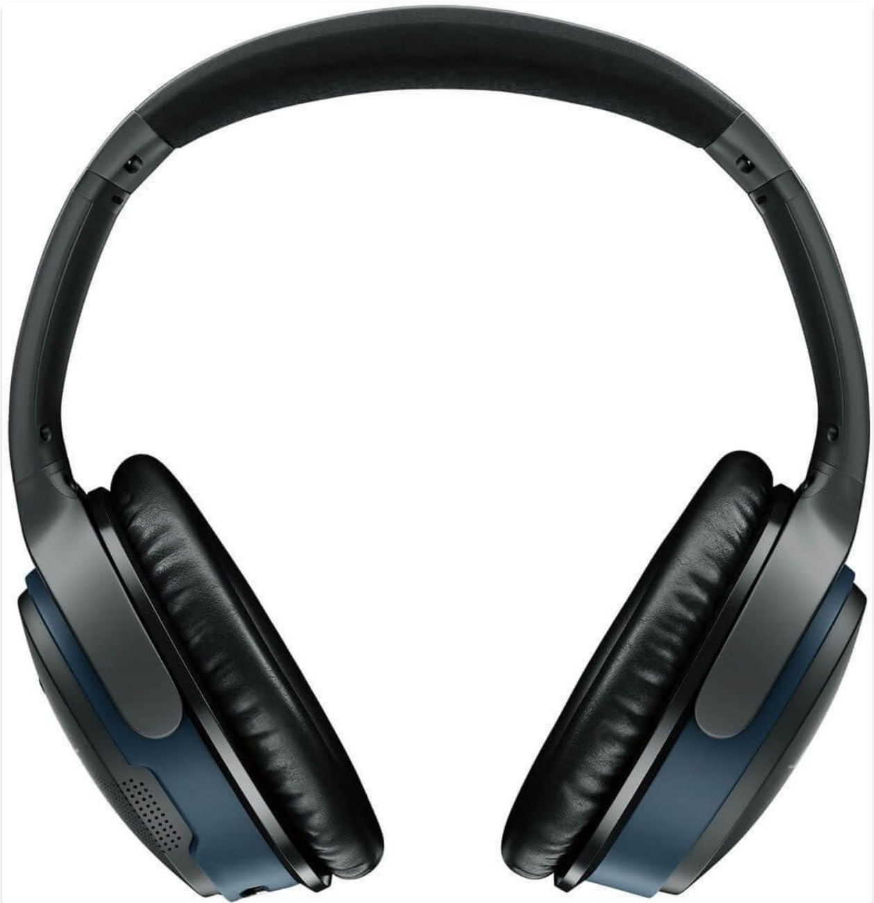
Image: Bose SoundLink Around Ear Wireless Headphones II from the top, highlighting the adjustable headband and ear cups.

Designed for extended listening sessions, these headphones are lightweight and feature soft, plush ear cushions that provide a comfortable fit around your ears. The headband is adjustable to accommodate various head sizes, ensuring a secure yet gentle fit.