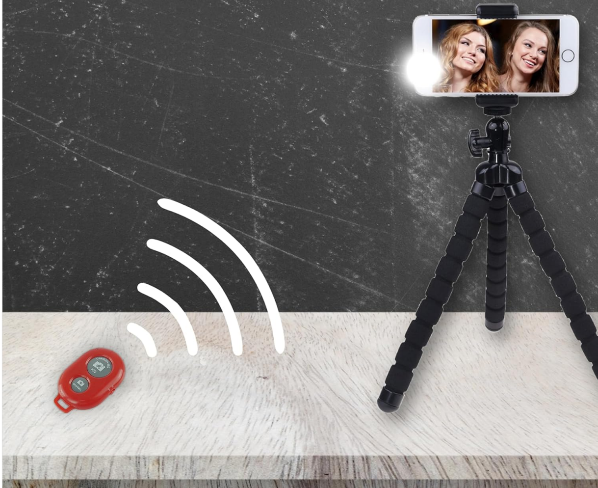
Image: A smartphone on a tripod, with the CamKix remote nearby, showing wireless signal waves to demonstrate its 10-meter operating range.

Video: This video provides a quick overview of the CamKix Wireless Bluetooth Shutter Remote Control, demonstrating its functionality for capturing photos and videos.