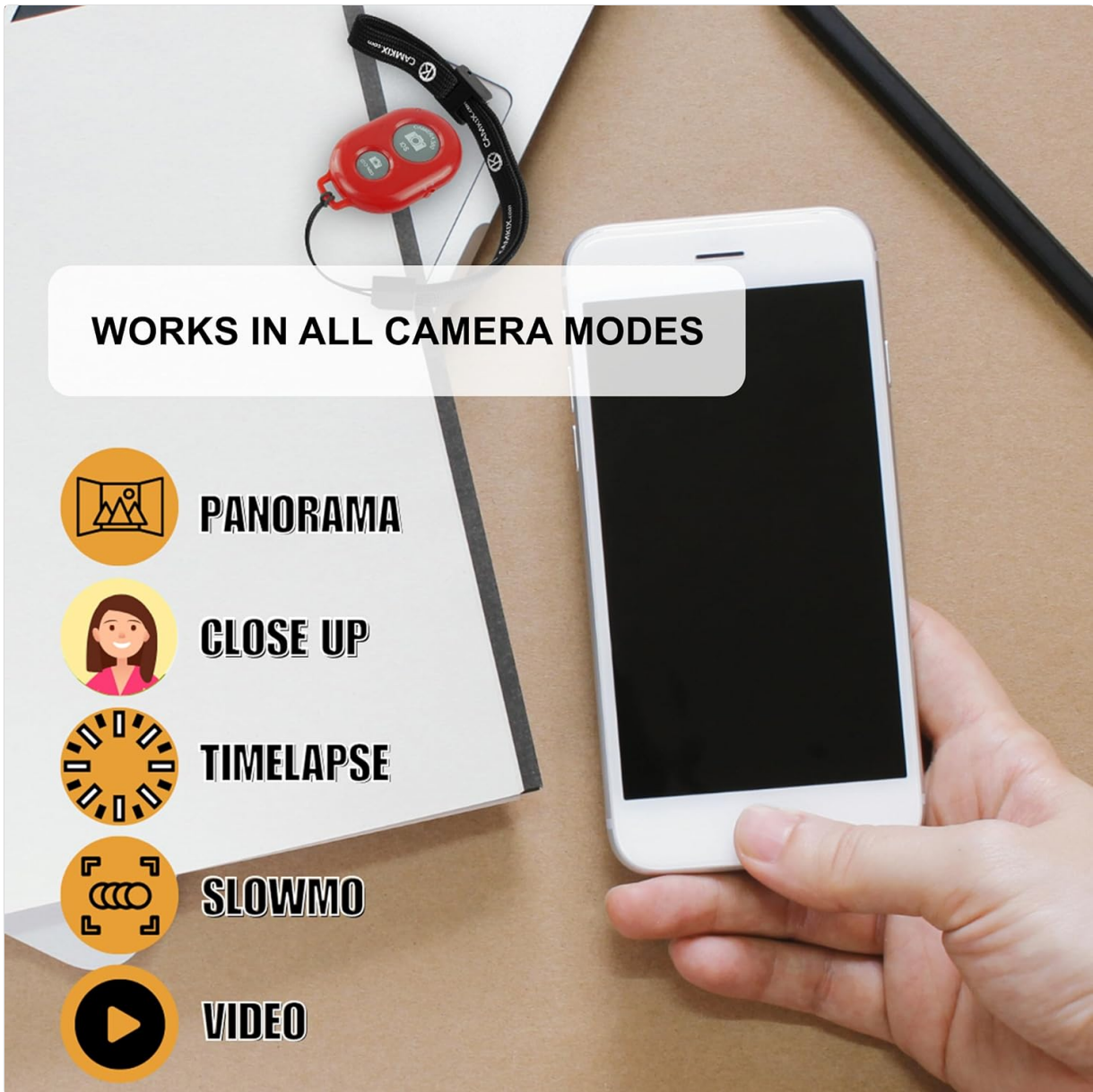
Image: A smartphone next to icons representing various camera modes like Panorama, Close Up, Timelapse, Slowmo, and Video, indicating the remote's versatility.