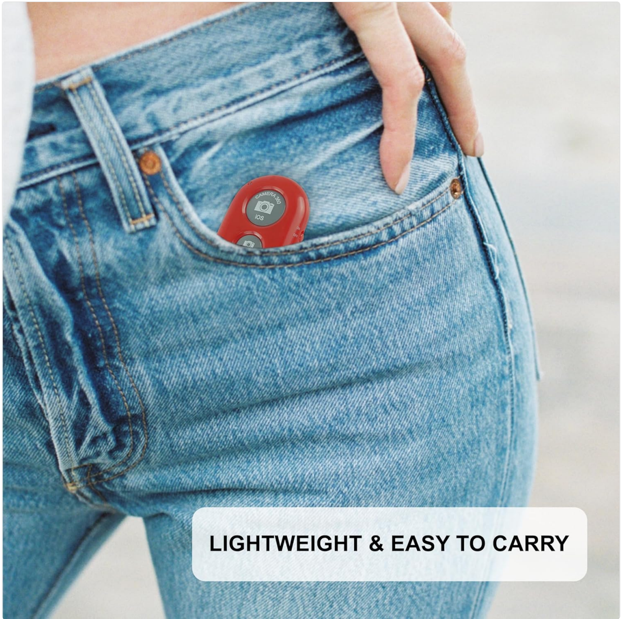
Image: The compact CamKix remote control being slipped into a jeans pocket, highlighting its portability.