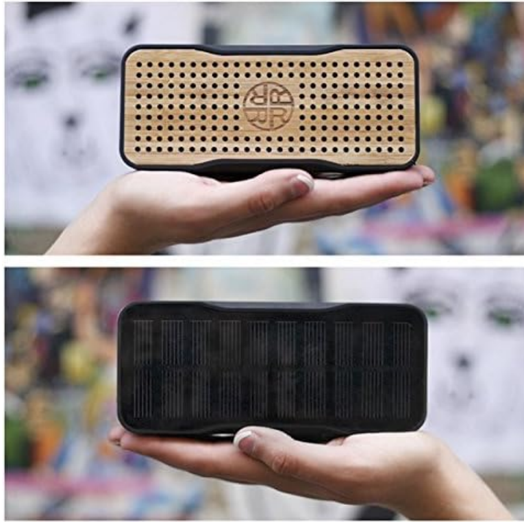
Figure 3: The speaker held in hands, demonstrating its compact and portable size, with views of both the bamboo front and solar panel back.