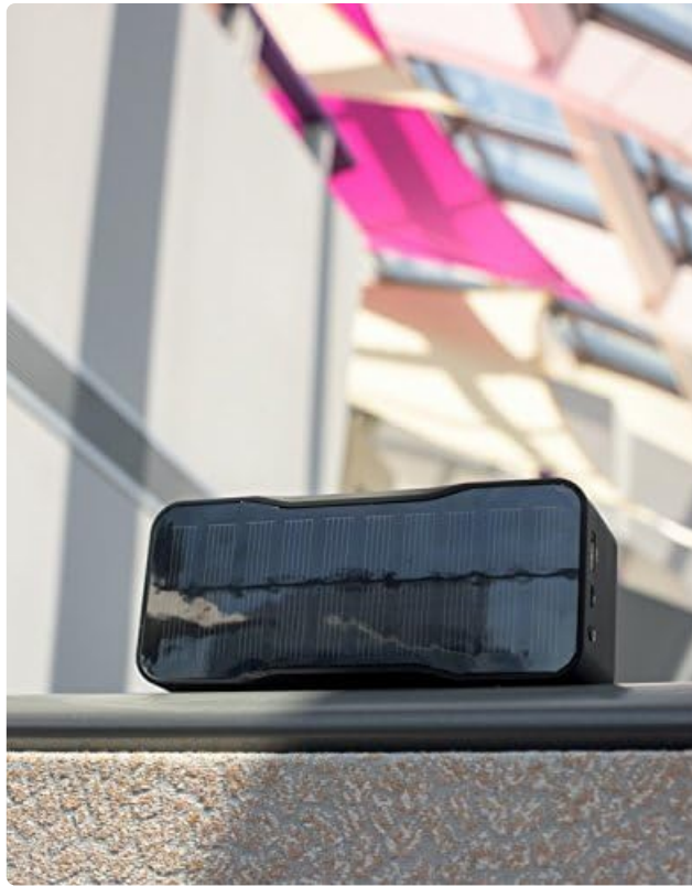
Figure 4: The solar panel on the back of the speaker, designed for efficient charging under sunlight.