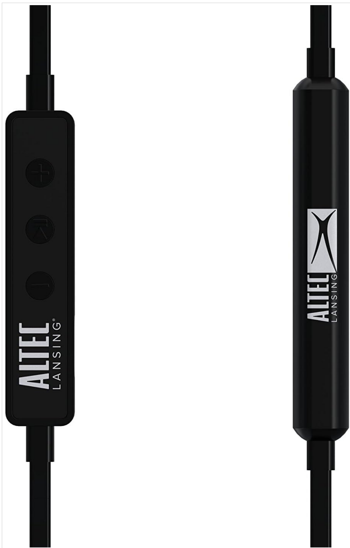
Image: Close-up view of the inline control unit on the Altec Lansing MZX856 earbuds, showing buttons and the Altec Lansing logo.