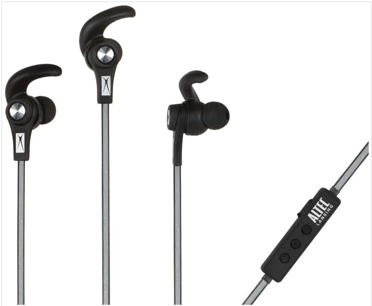
Image: Altec Lansing MZX856 Bluetooth Active Earbuds with included accessories.