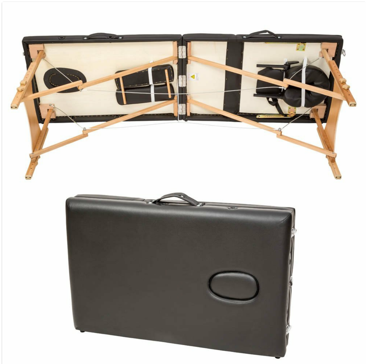
Image: The Tectake Portable Massage Table shown folded in its carry case and fully unfolded, demonstrating its compact storage and readiness for use.