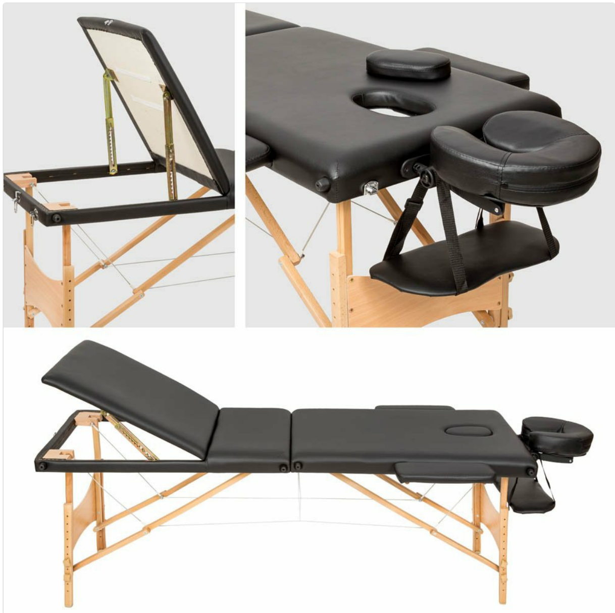
Image: Close-up view of the adjustable headrest mechanism and the attached armrest, along with a full view of the table with these accessories installed.