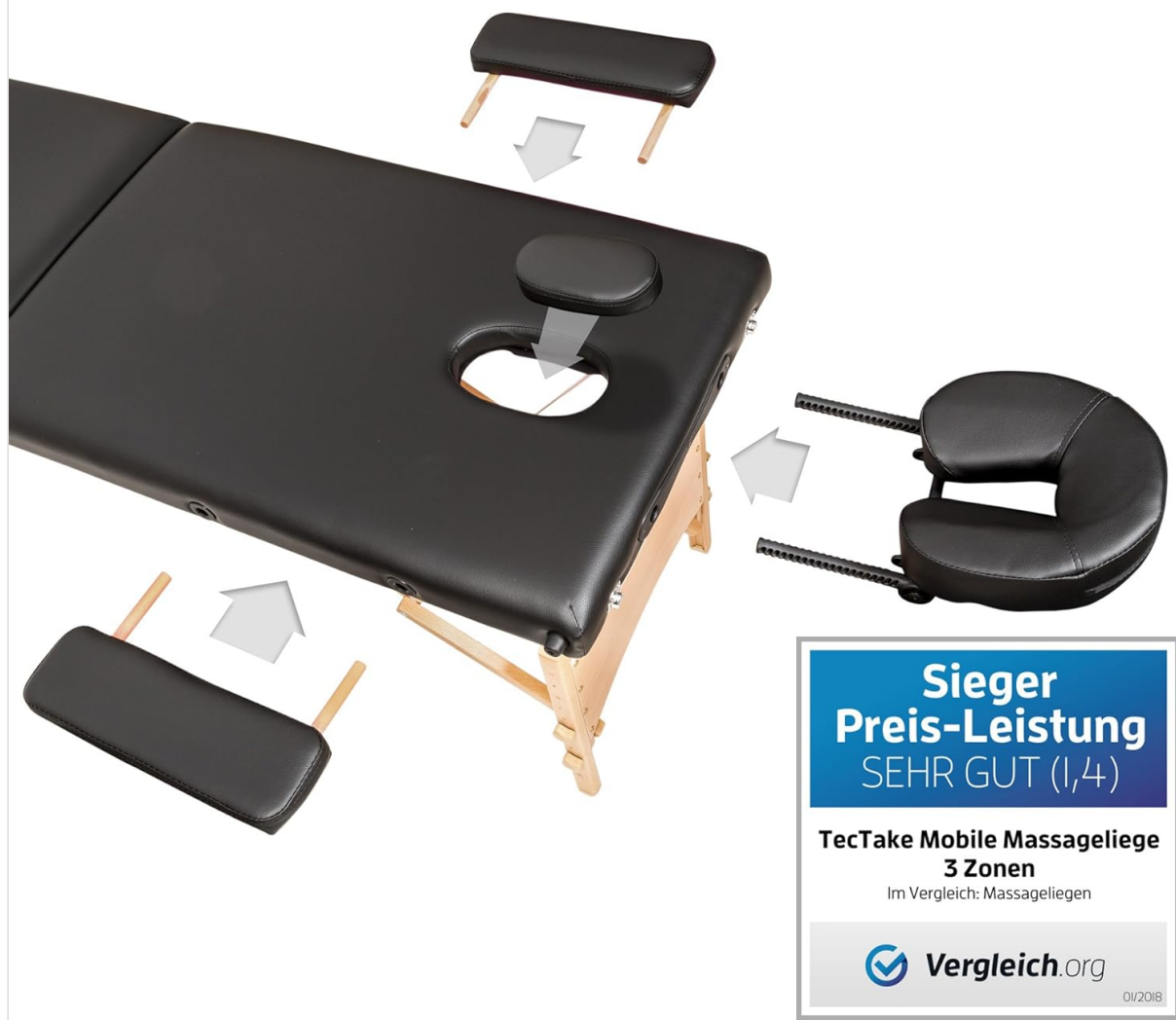
Image: An overhead view of the TecTake Portable Massage Table highlighting the face hole and the adjustable headrest, along with a graphic indicating adjustable components.