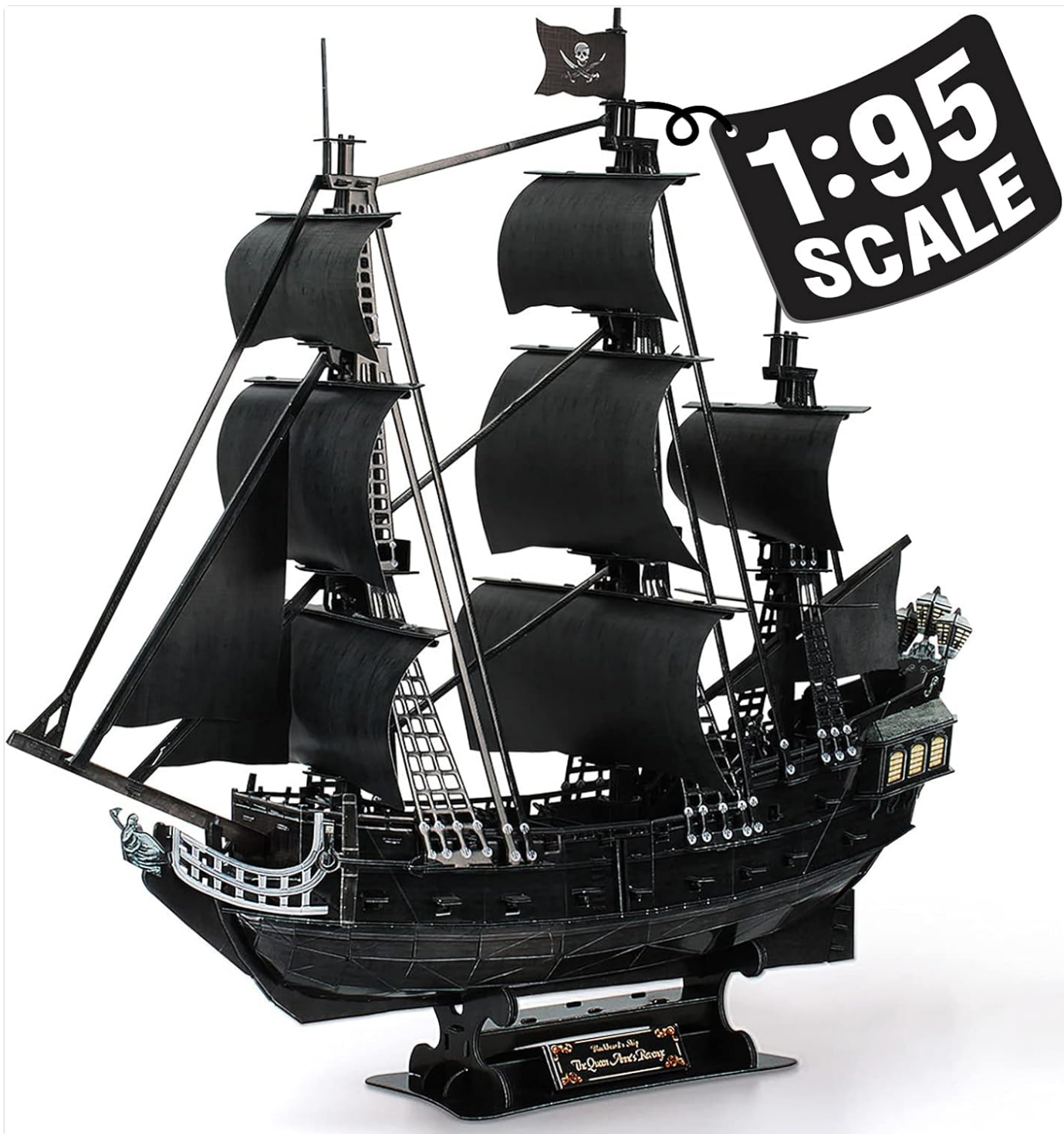
Image: The completed Queen Anne's Revenge 3D Pirate Ship model, showcasing its full detail and scale.