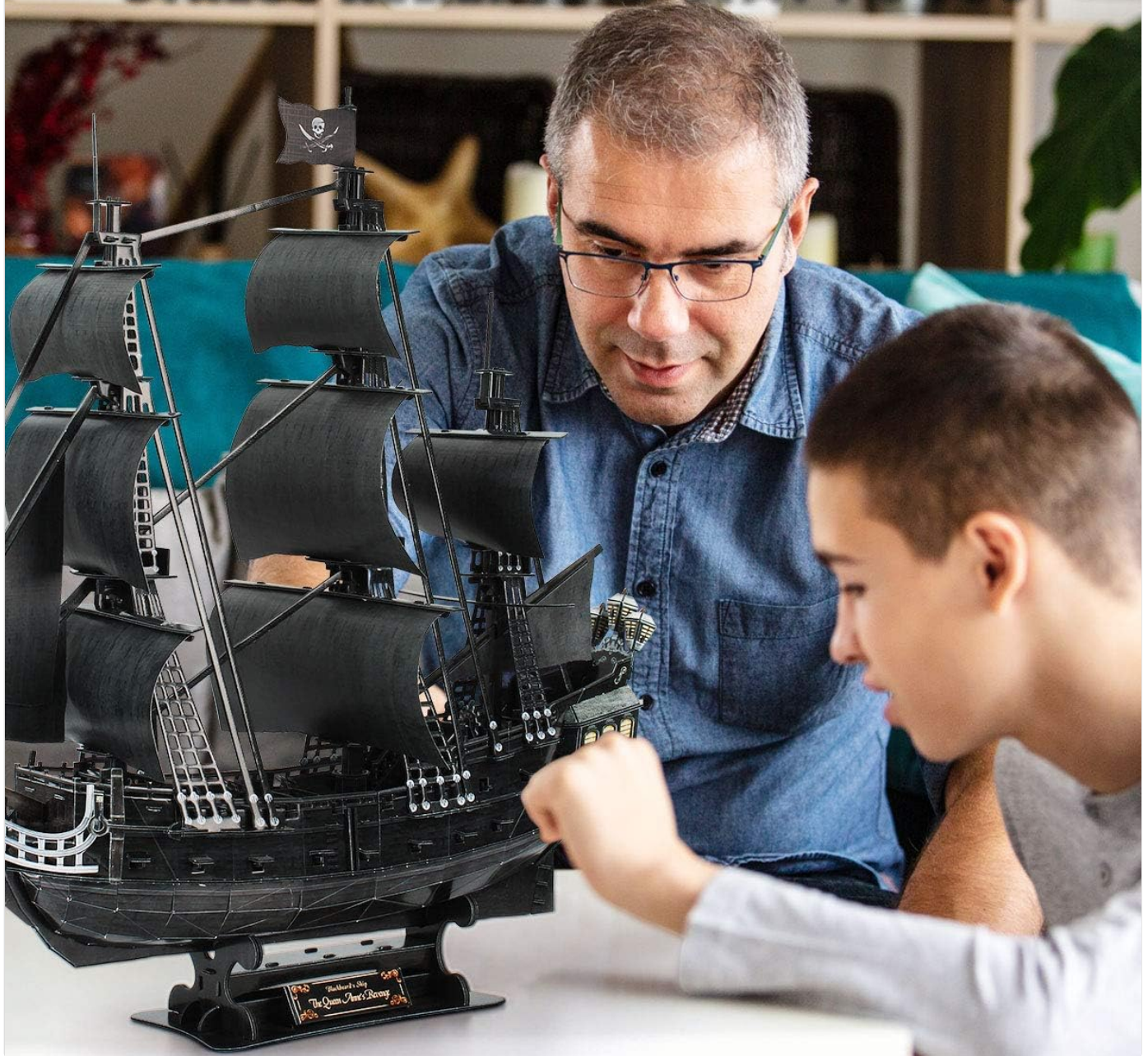
Image: A father and son engaged in assembling the 3D puzzle, illustrating the product's appeal for shared activity and focus.