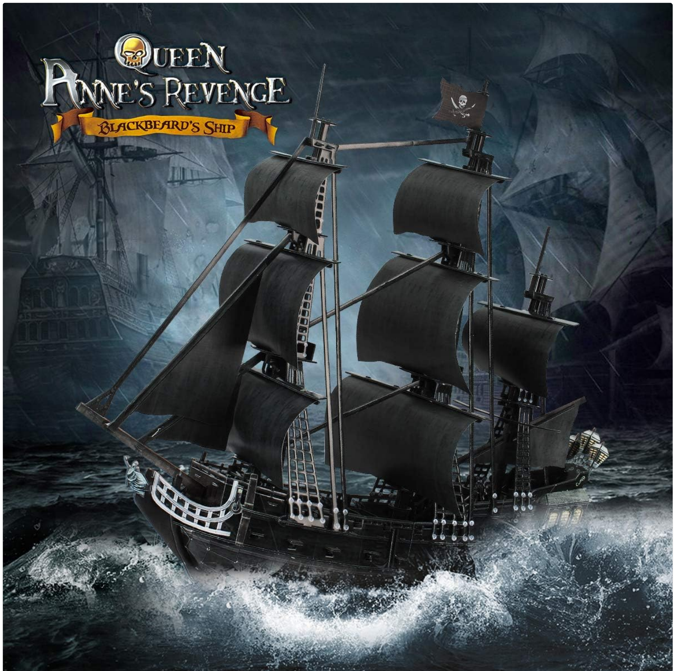
Image: The Queen Anne's Revenge model depicted against a stormy sea background, emphasizing its realistic design.