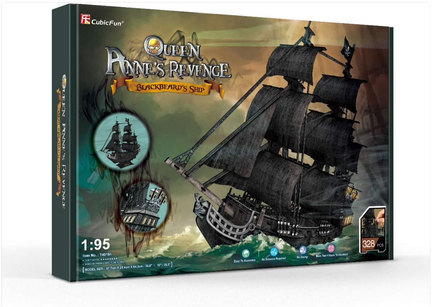
Image: The product packaging box, showing the assembled Queen Anne's Revenge model.