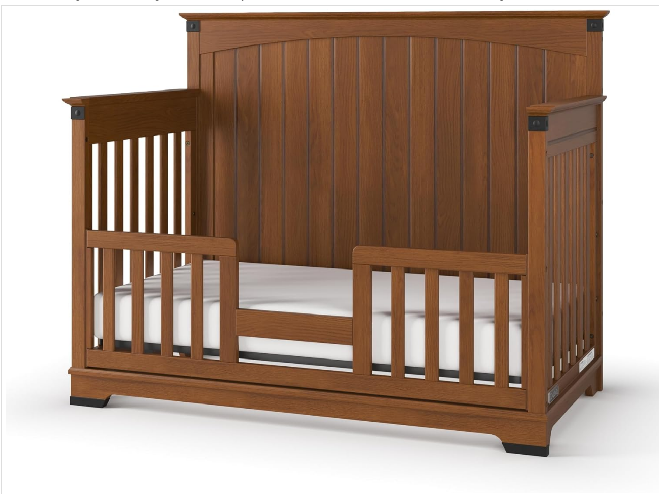
Image: A Child Craft Redmond crib fully converted into a toddler bed with the guard rail in place, ready for use.