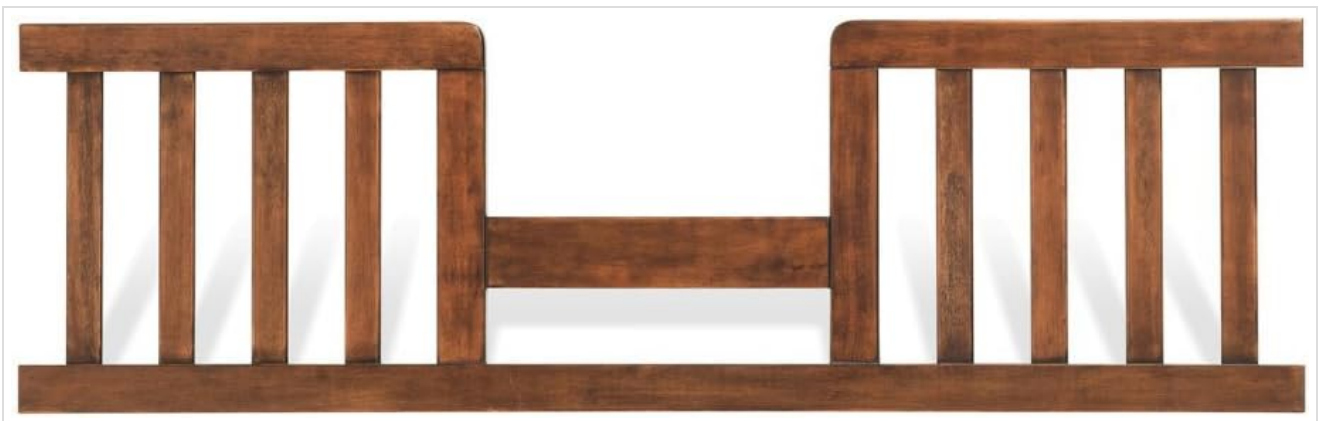
Image: The Child Craft Toddler Guard Rail, showing its design and construction.