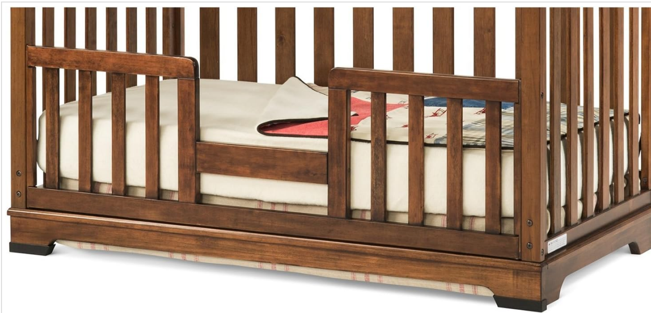
Image: The toddler guard rail securely installed on a Child Craft Redmond crib, converting it into a toddler bed.