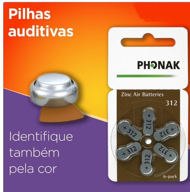
Image: A single Phonak Size 312 Zinc Air Battery pack, showing the battery with its distinctive brown tab, which helps identify the size 312 battery type.