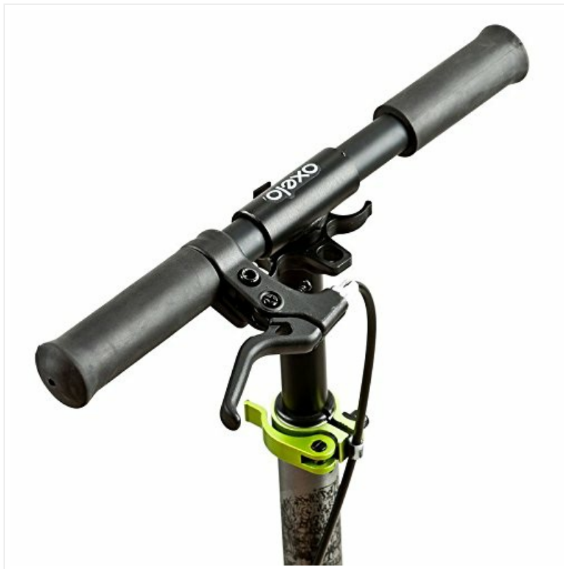
Figure 3: The handlebar assembly with the brake lever and height adjustment clamp.