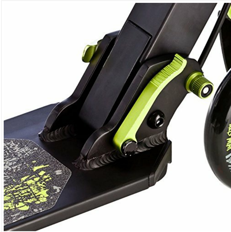
Figure 2: Detail of the folding mechanism, crucial for unfolding and folding the scooter.

Locate the folding mechanism near the base of the handlebar stem. Release the locking lever and carefully unfold the scooter until the stem clicks into its upright position. Ensure the locking mechanism is fully engaged.