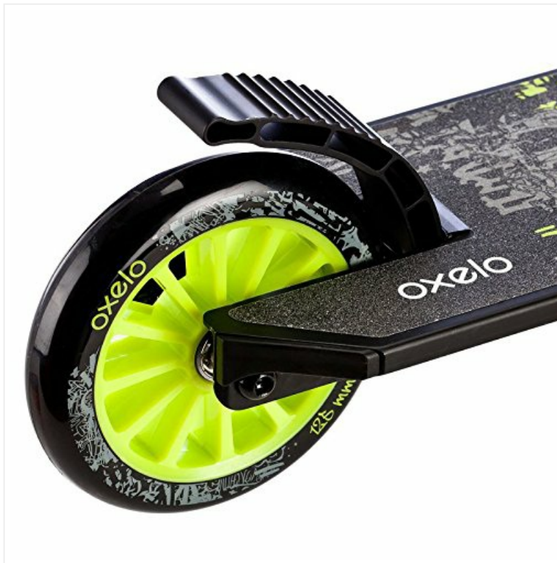
Figure 4: The rear wheel assembly, showing the integrated foot brake for stopping.