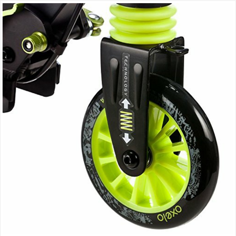
Figure 6: The front wheel with its suspension system, which requires periodic inspection.