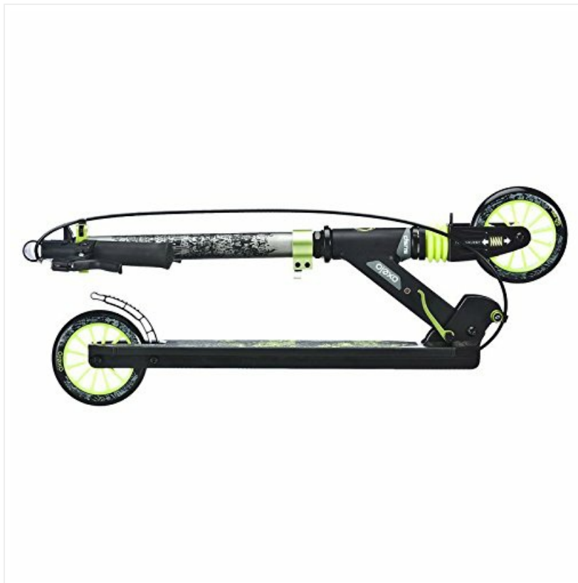
Figure 5: The scooter compactly folded, ready for storage or transport.

To fold the scooter, ensure it is stationary. Release the handlebar height clamp and lower the handlebar fully. Then, engage the folding mechanism lever and fold the handlebar stem down towards the deck until it locks into the folded position.