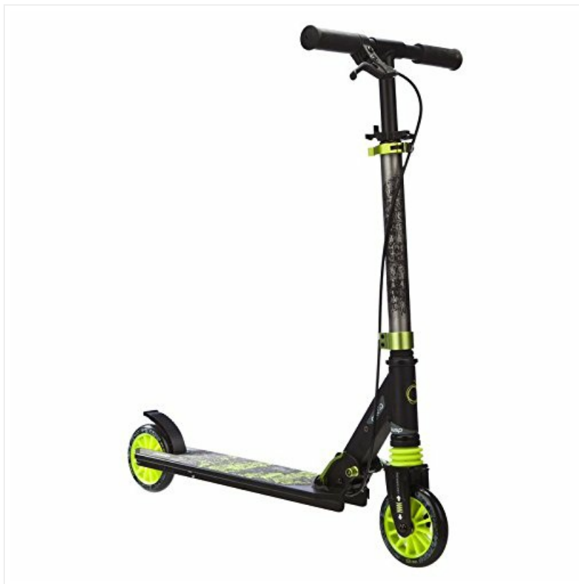
Figure 1: The OXELO MID 5 Kids Scooter, showcasing its green and black design from a front-side perspective.

This manual provides essential information for the safe assembly, operation, and maintenance of your OXELO MID 5 Kids Scooter. Please read it thoroughly before first use and retain it for future reference.