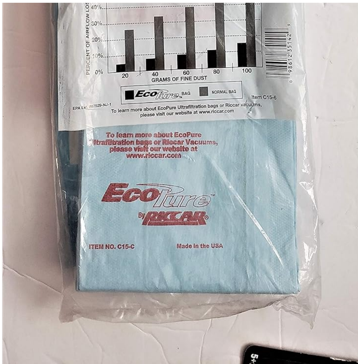
Image 2: A chart illustrating the paper bag filtration efficiency and airflow performance of Riccar EcoPure bags compared to standard bags. This highlights the superior filtration capabilities of the product.