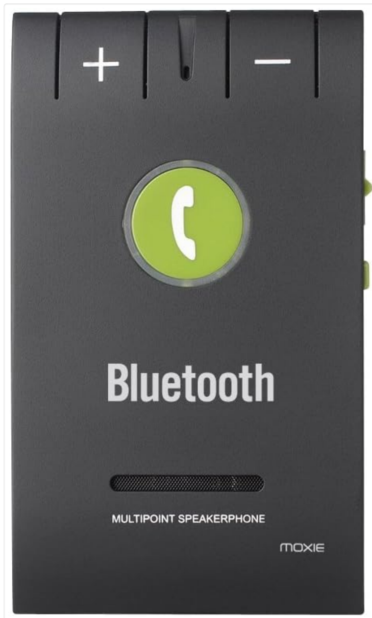
Image 1: Front panel of the Moxie KX1, highlighting the volume controls (+ and -), the central call button, and the 'Bluetooth' indicator.