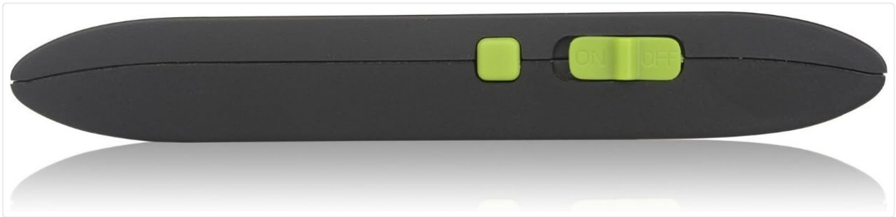
Image 4: Top view of the Moxie KX1, clearly showing the ON/OFF slide switch for device power control.