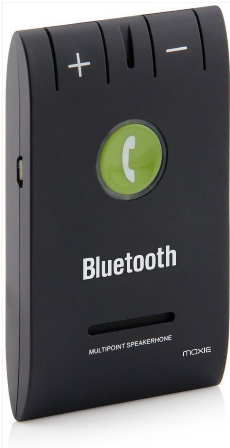
Image 2: Side view of the Moxie KX1, illustrating the location of the charging port and the ON/OFF power switch.

A full charge typically takes about 2 hours.