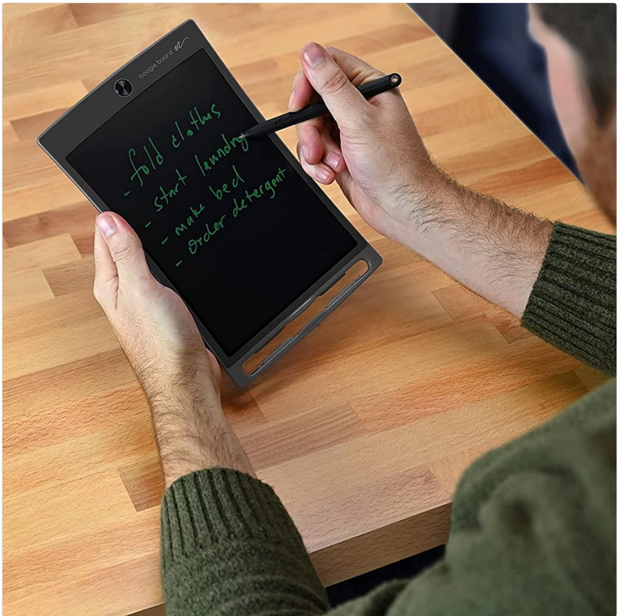
Image: An overhead view of a person writing on the Boogie Board Jot tablet, demonstrating its use for lists.