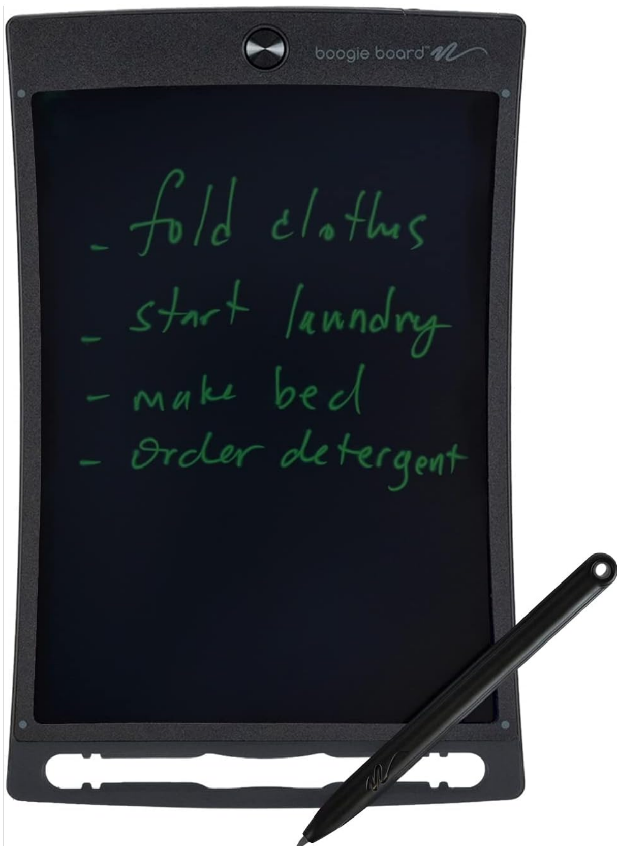
Image: The Boogie Board Jot tablet displaying a handwritten list, with the stylus pen shown separately, indicating it can be removed for use.