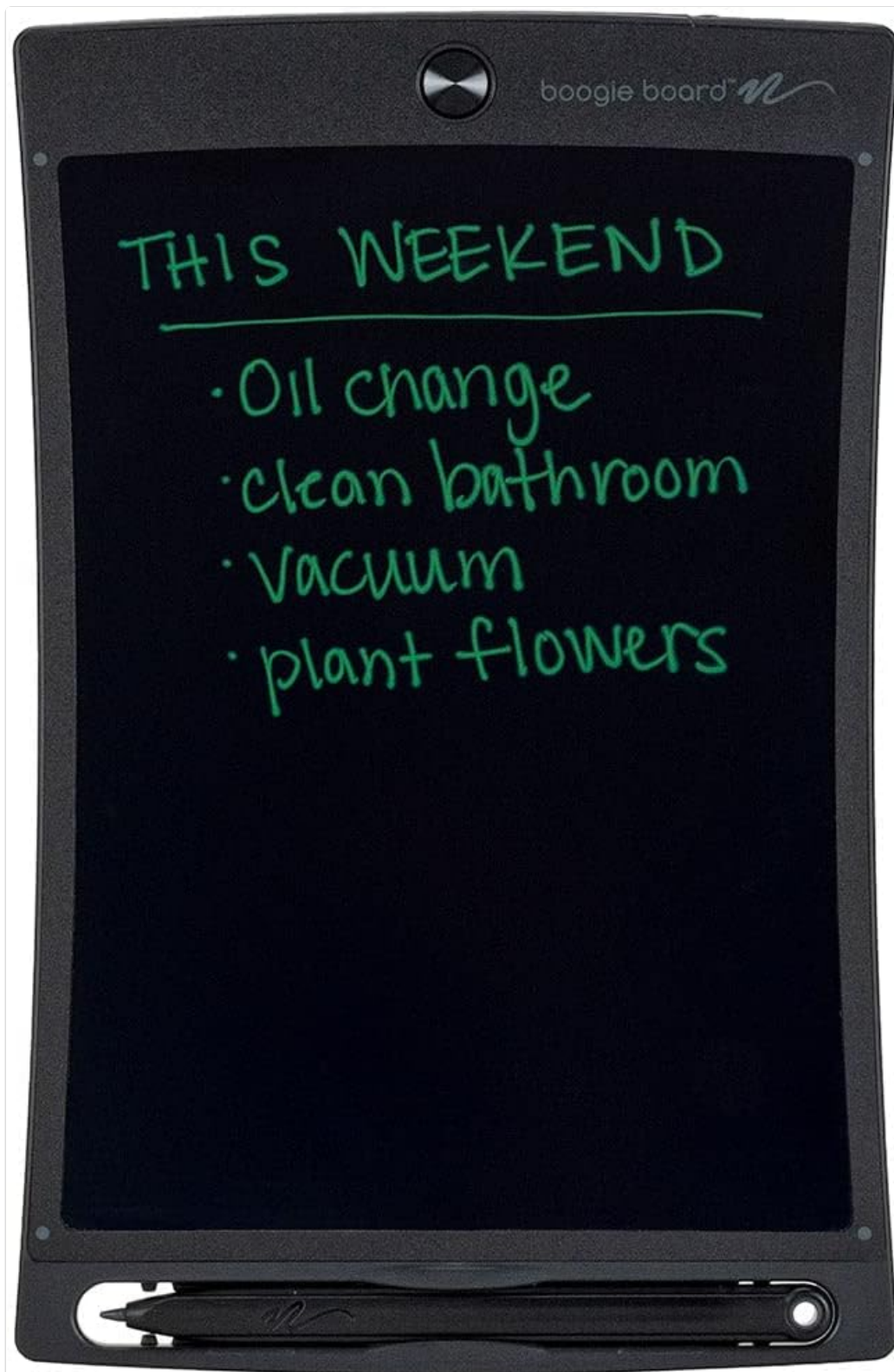
Image: The Boogie Board Jot 8.5" LCD Writing Tablet, gray model, with a sample handwritten list on its screen.