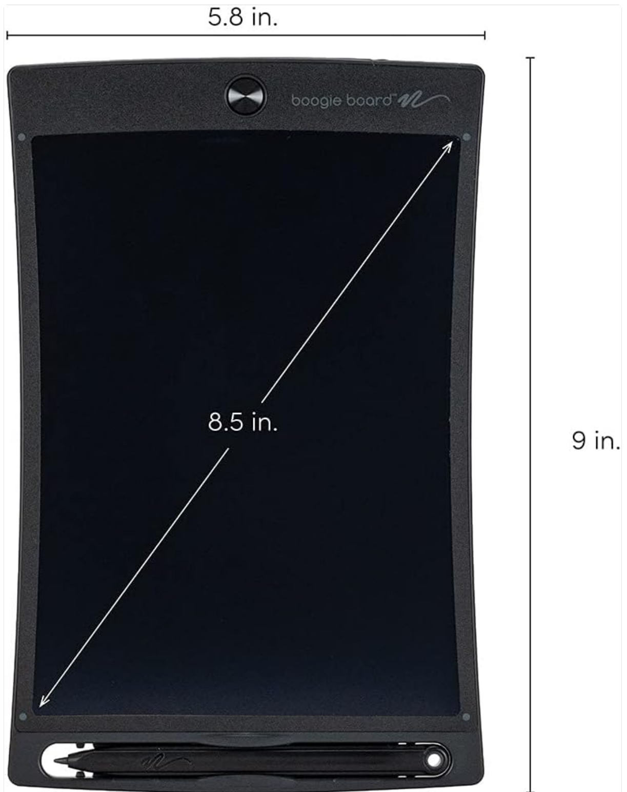
Image: Diagram showing the physical dimensions of the Boogie Board Jot tablet.