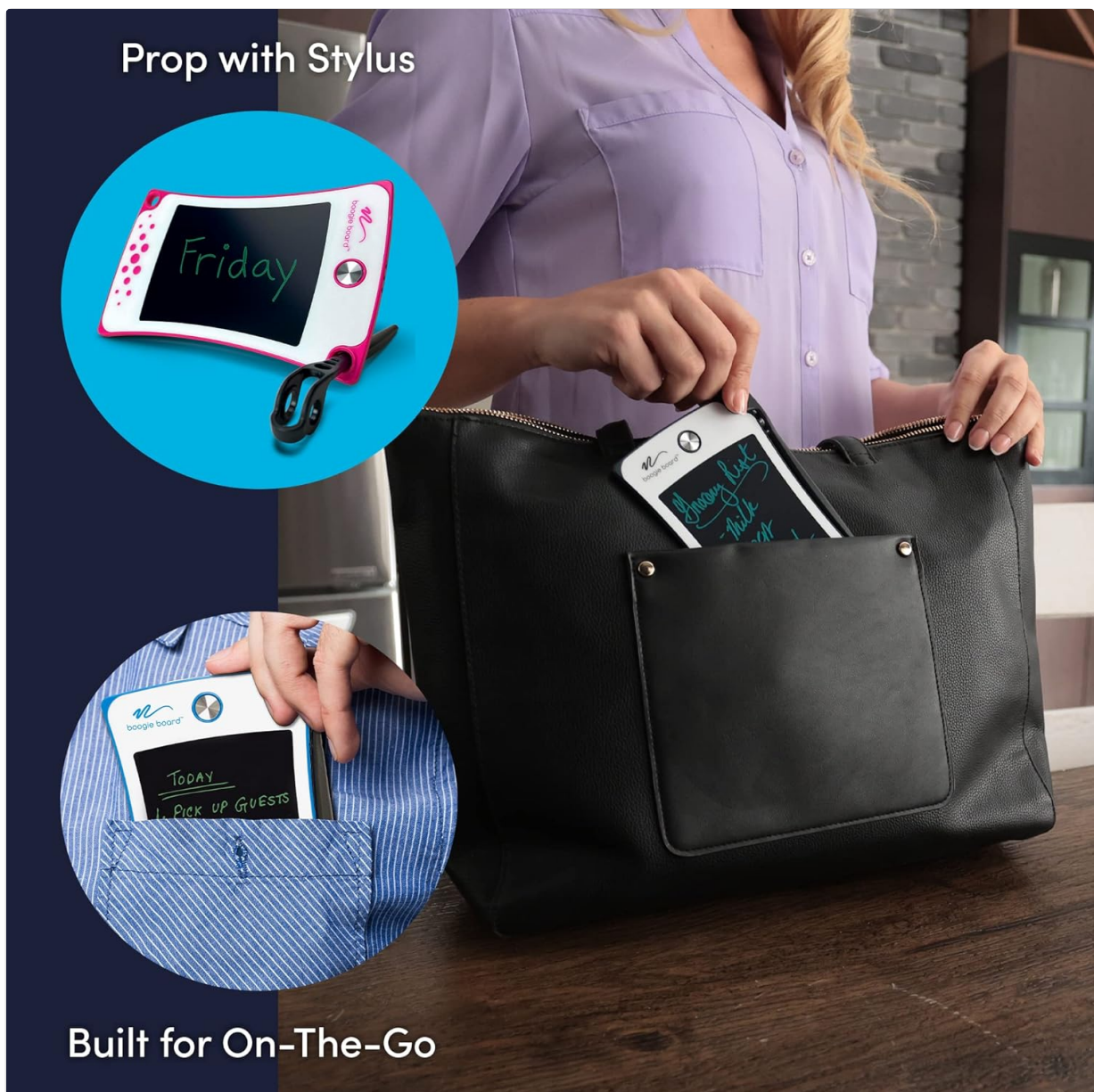
Image 4.3: The Boogie Board Jot Pocket being stored in a bag, illustrating its portable design.