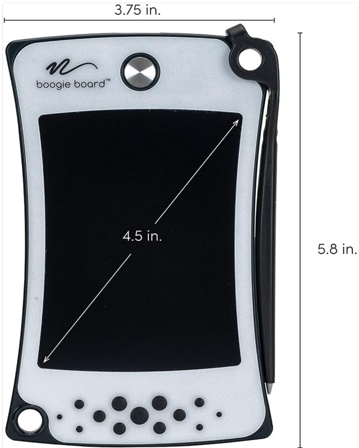
Image 7.1: Diagram illustrating the physical dimensions of the Boogie Board Jot Pocket.