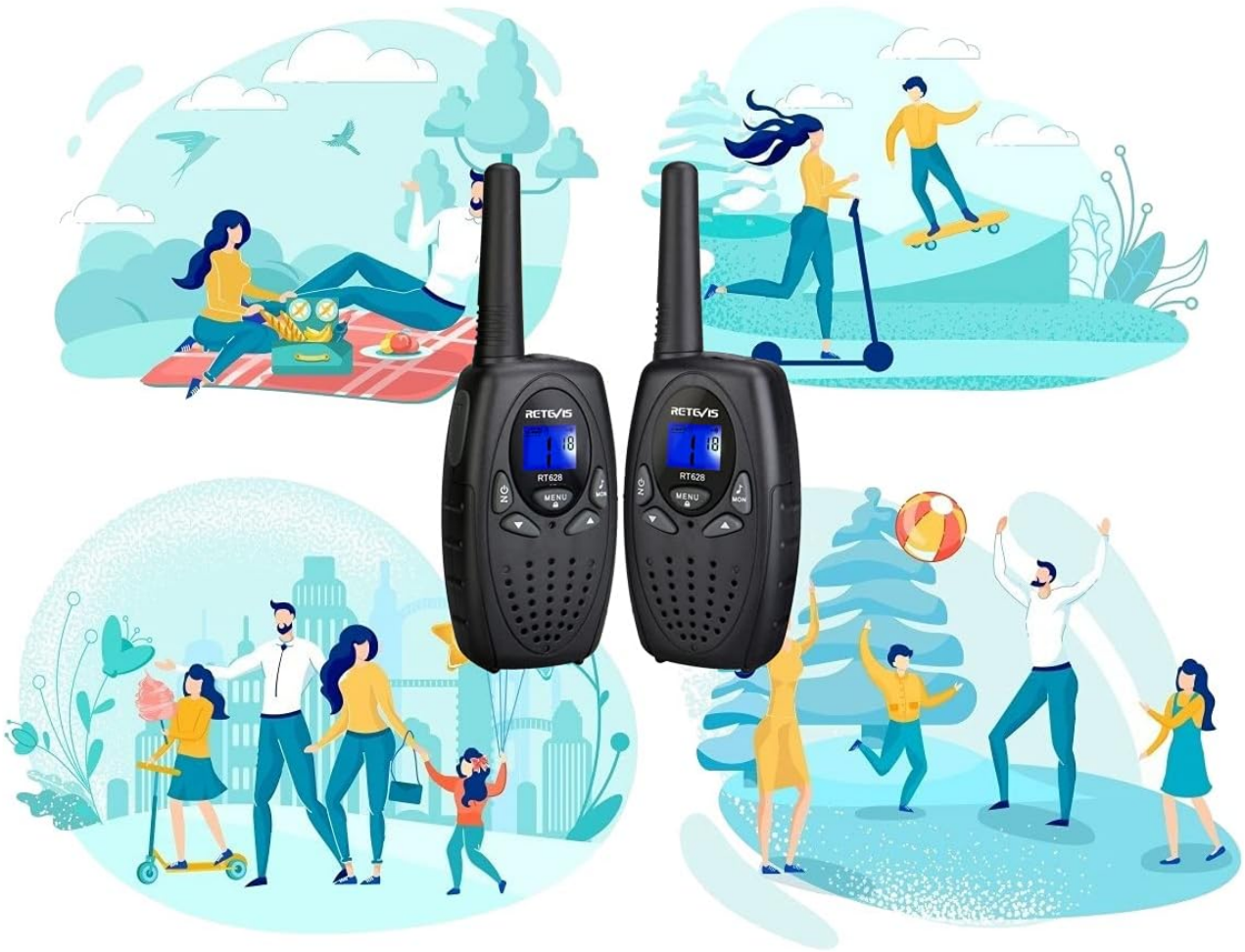
Figure 1: Retevis RT628 Walkie Talkies in use during various family activities.

Video 1: A short preview showing children using walkie-talkies as a gift and for play. This video demonstrates the product's appeal to children.