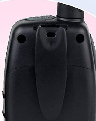
Figure 3: Child-friendly design features including easy grip, drop resistance, and belt clip.