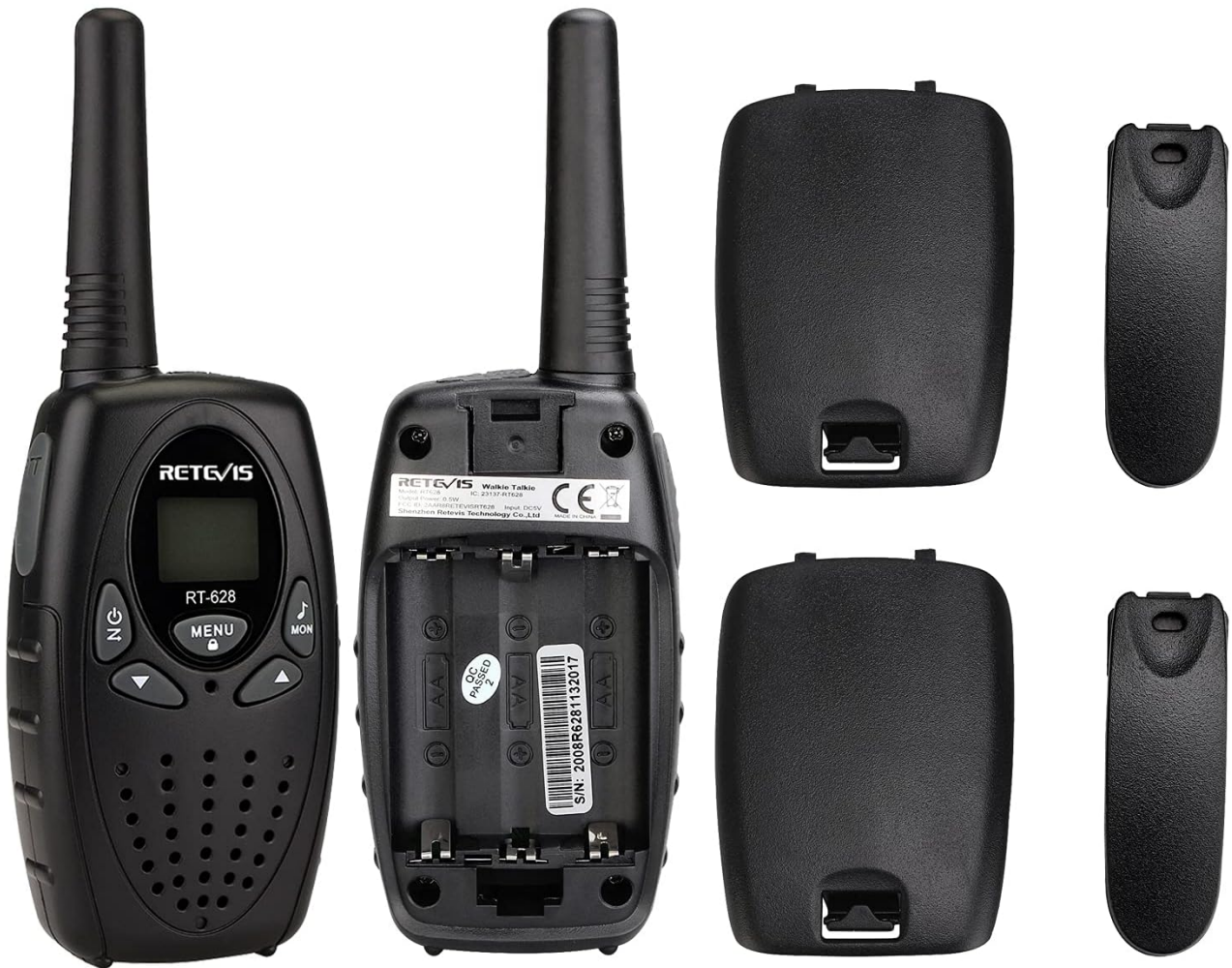
Figure 4: Package details and included components.