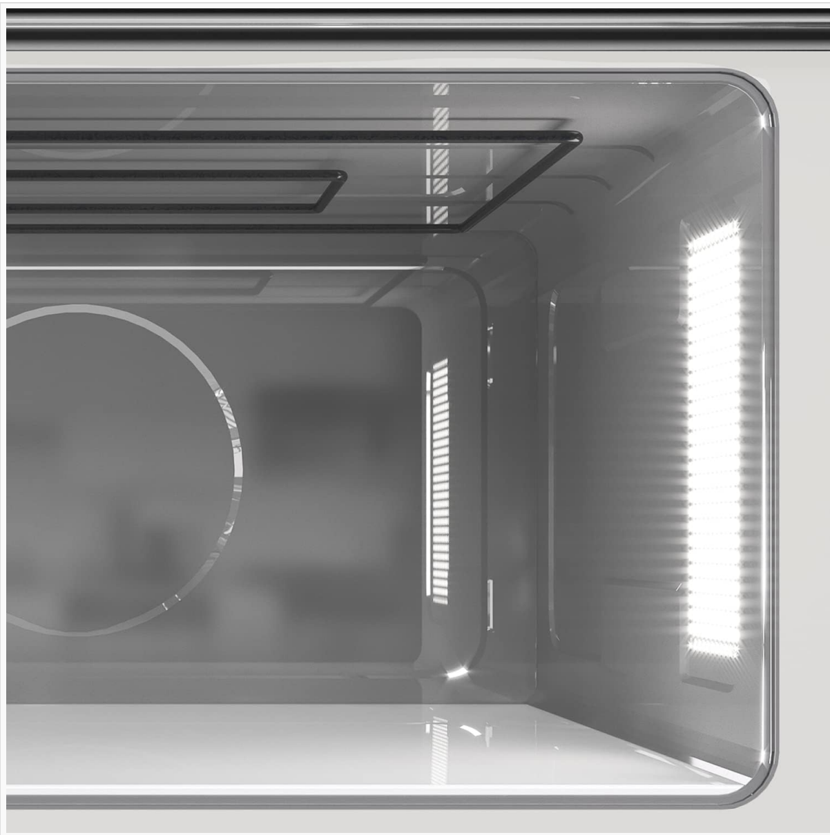
Figure 2.2: Interior view of the microwave oven with grill element.