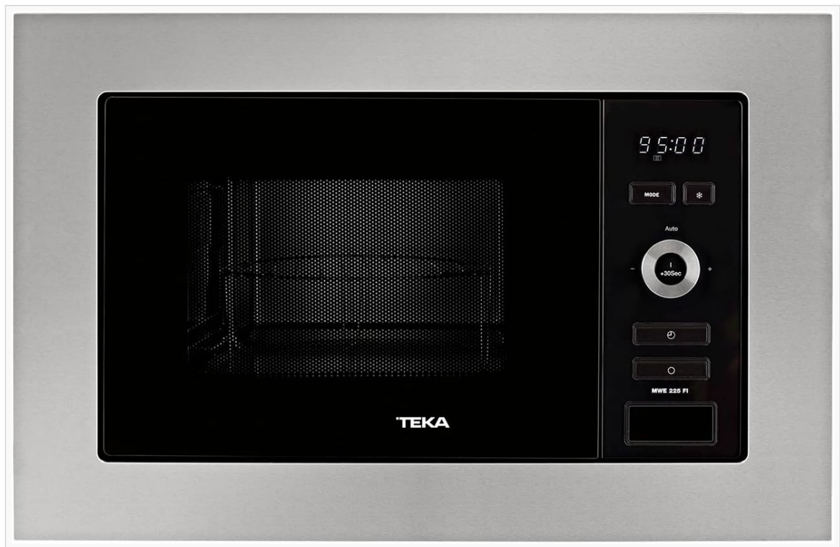
Figure 2.1: Front view of the Teka MWE 225 FI Microwave Oven.