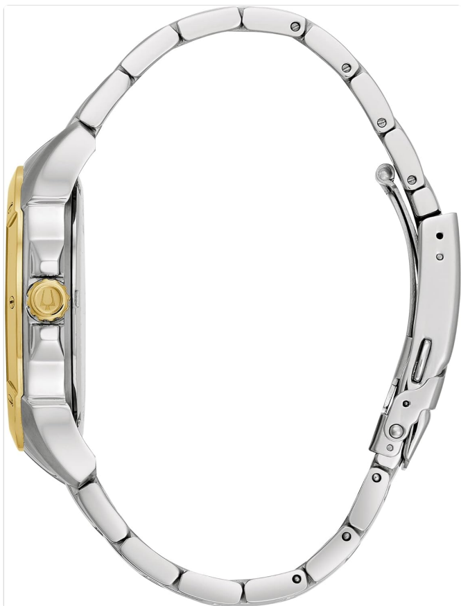
Figure 2: Side view of the Bulova 98A146 watch, highlighting the gold-tone crown and the design of the two-tone stainless steel bracelet with its fold-over clasp.