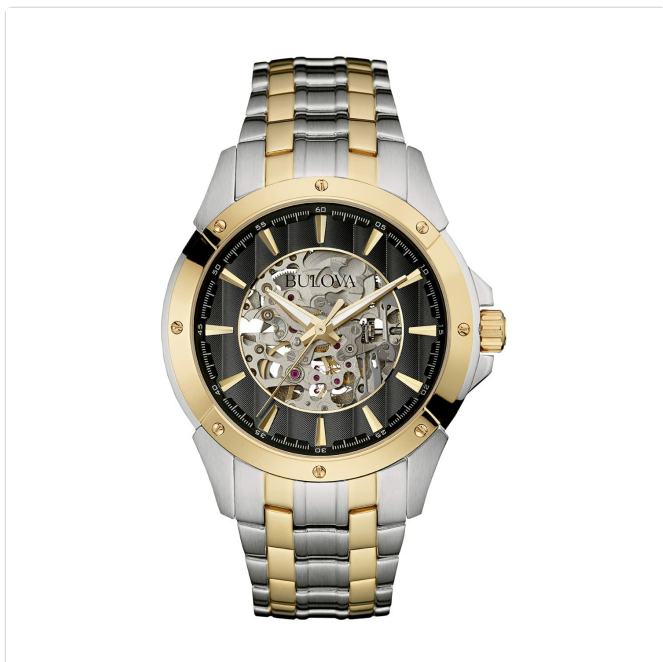
Figure 1: Front view of the Bulova 98A146 watch, showcasing the two-tone stainless steel bracelet, gold-tone bezel, and the intricate skeleton dial.