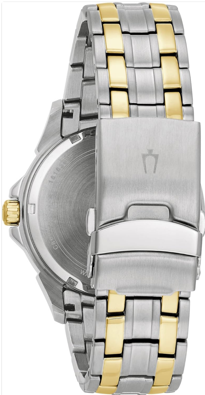
Figure 3: Back view of the Bulova 98A146 watch, featuring the exhibition case back that reveals the automatic movement and the Bulova logo on the clasp.