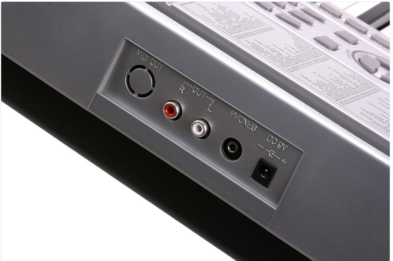
Image: Close-up of the keyboard's rear panel showing MIDI OUT, R/L OUT, PHONES, and DC 9V input ports.