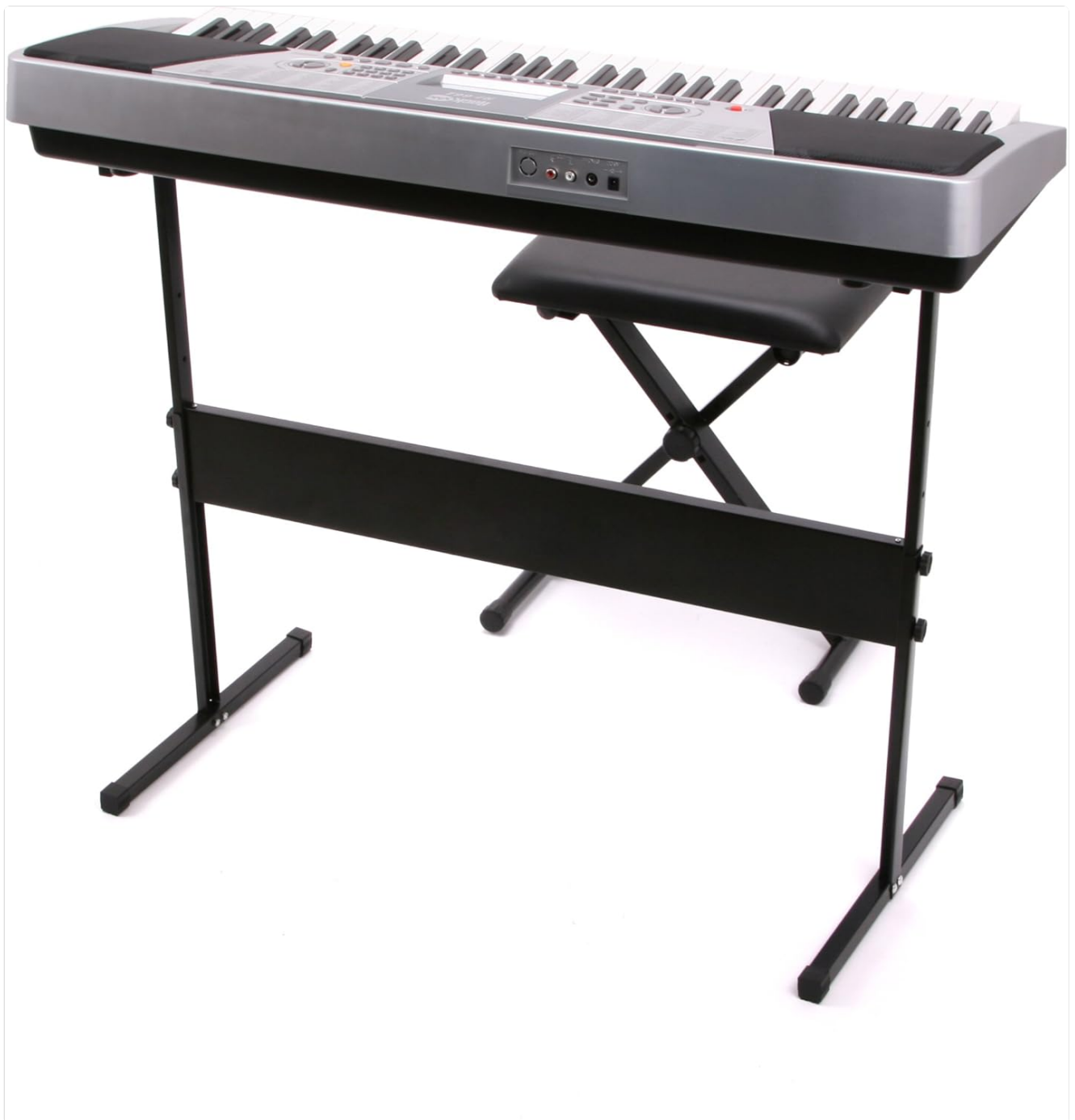
Image: The keyboard positioned on its stand, with the piano bench in front.