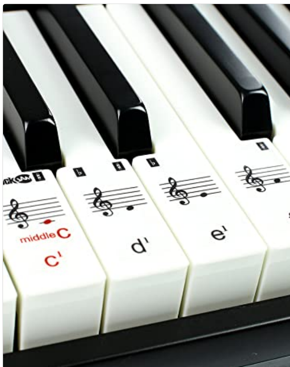
Image: Close-up of white keyboard keys with note stickers showing musical notation and letter names.