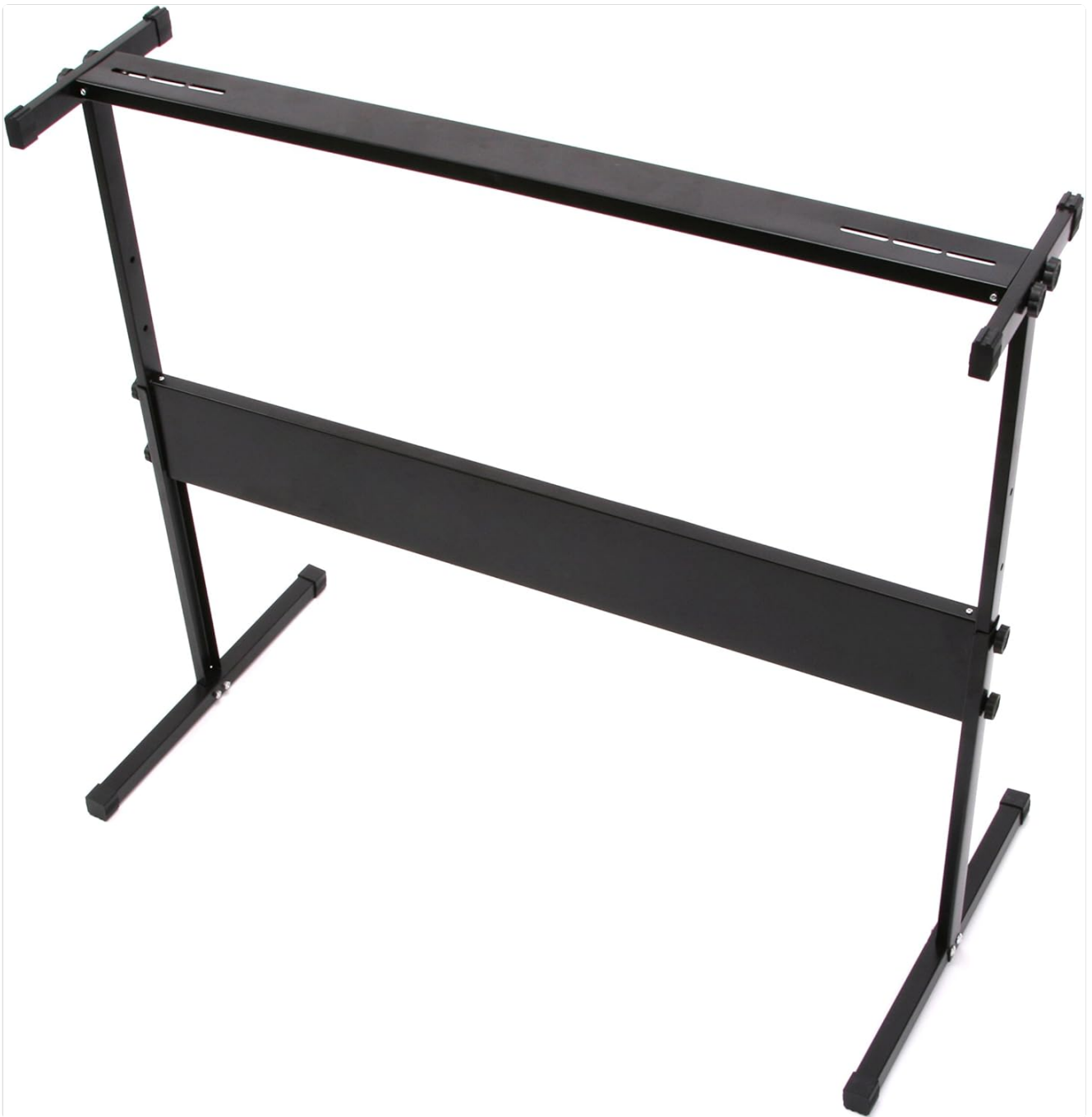
Image: The black metal keyboard stand, ready for the keyboard.