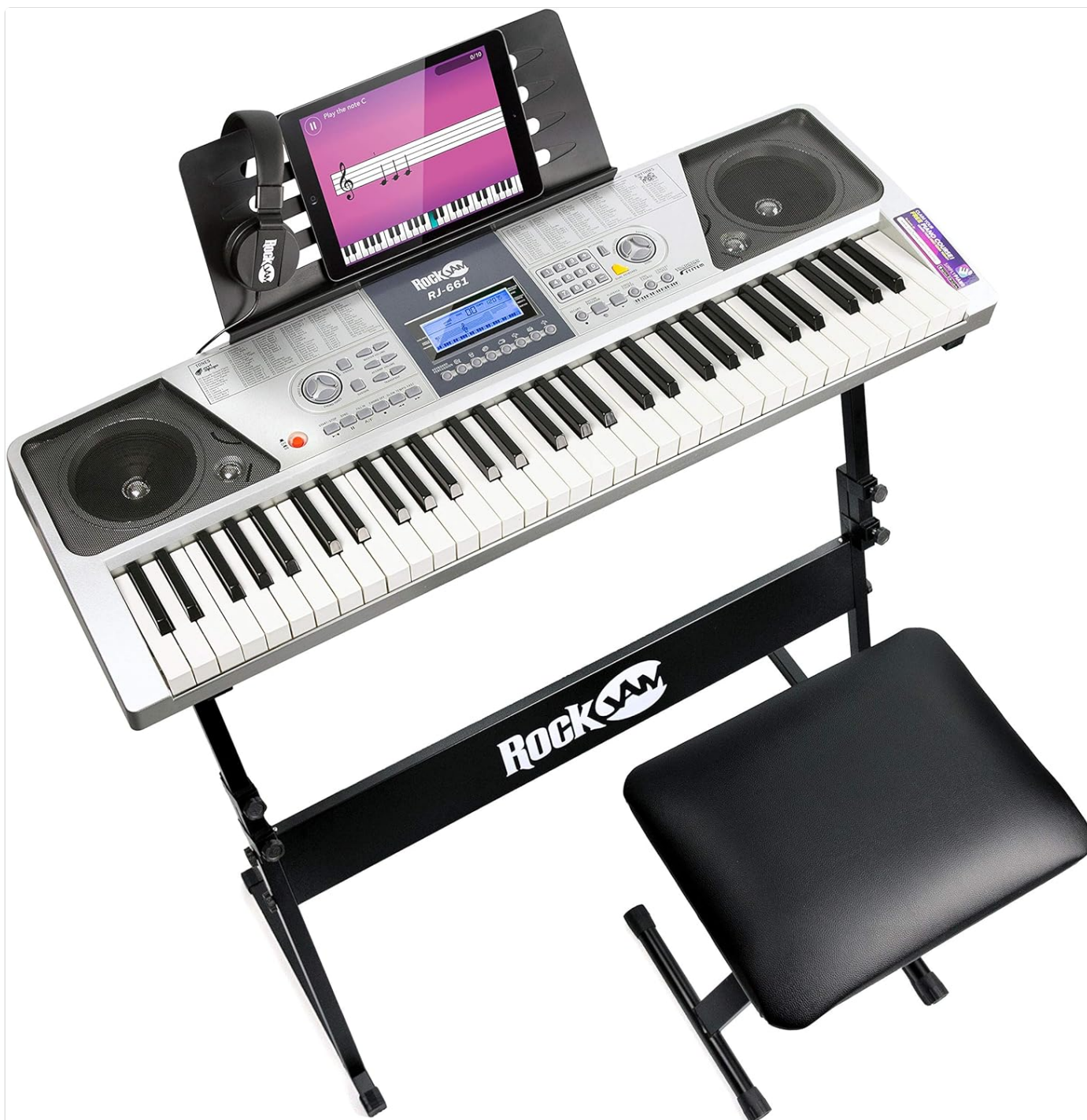
Image: The complete RockJam 61 Key Keyboard Piano Kit, including the keyboard, stand, bench, and sheet music stand.