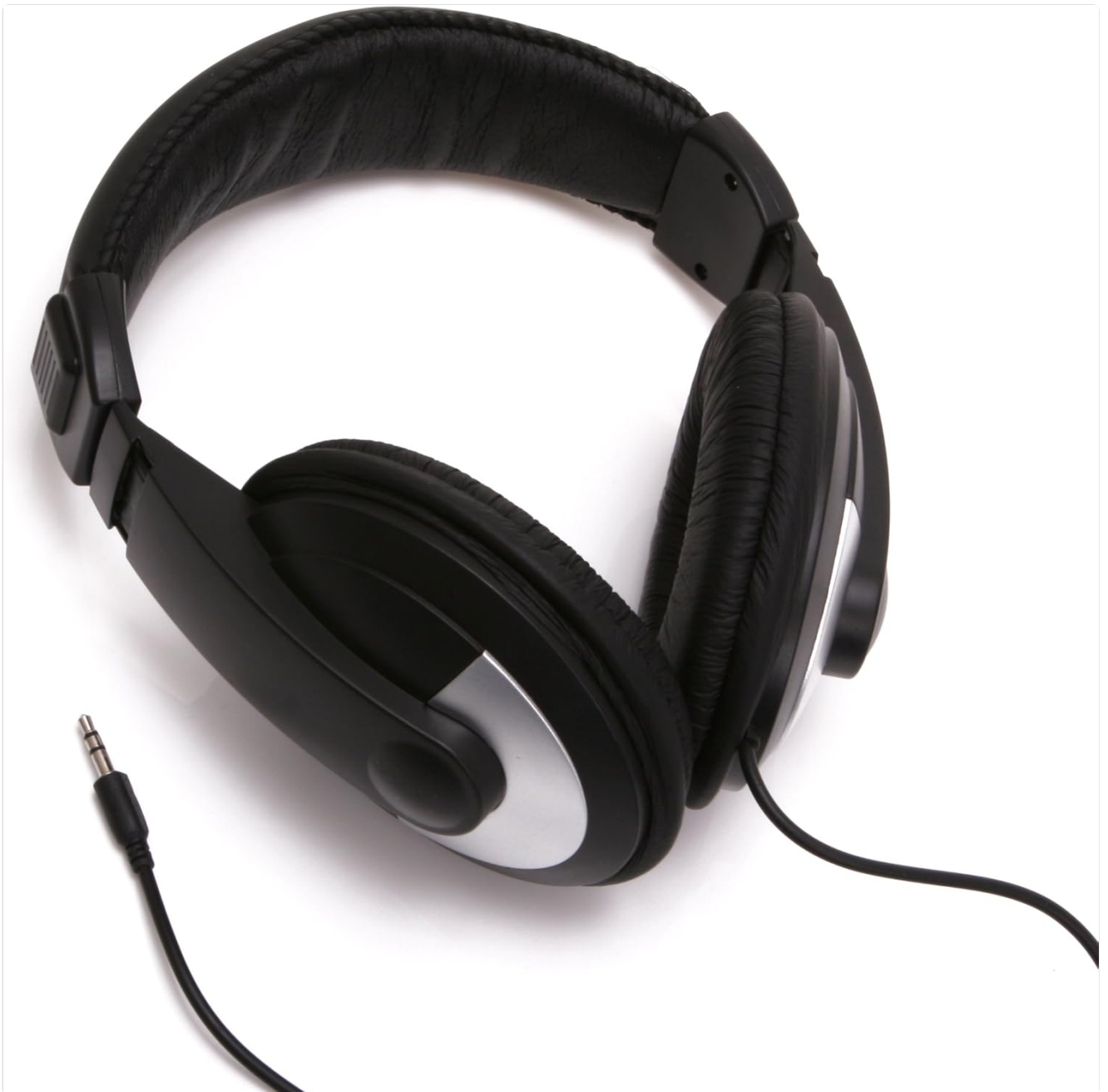
Image: The included black over-ear headphones with a standard audio jack.

If desired, apply the note stickers to the keys as a visual aid for learning. Ensure they are placed correctly for each note.