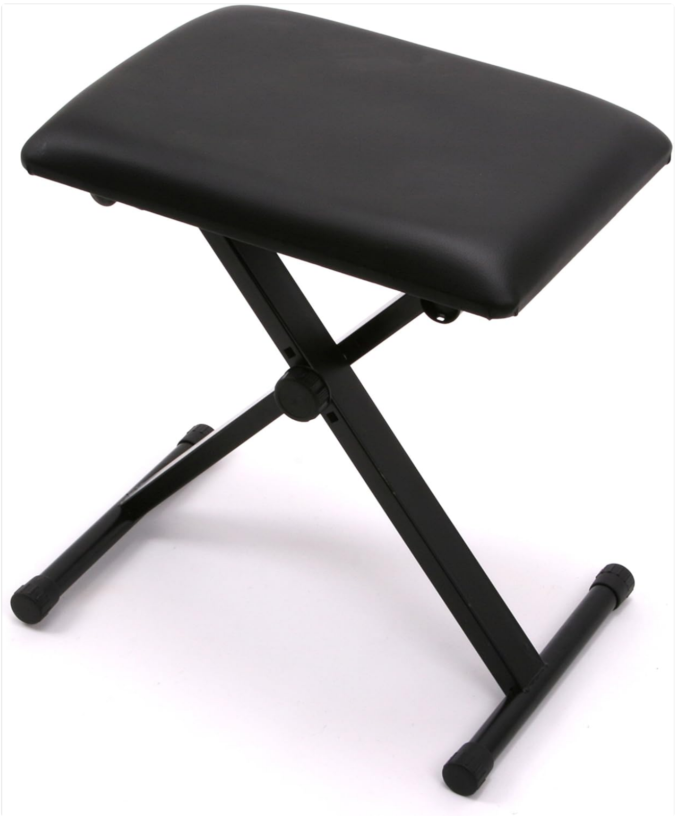
Image: The black padded piano bench in its assembled, ready-to-use state.