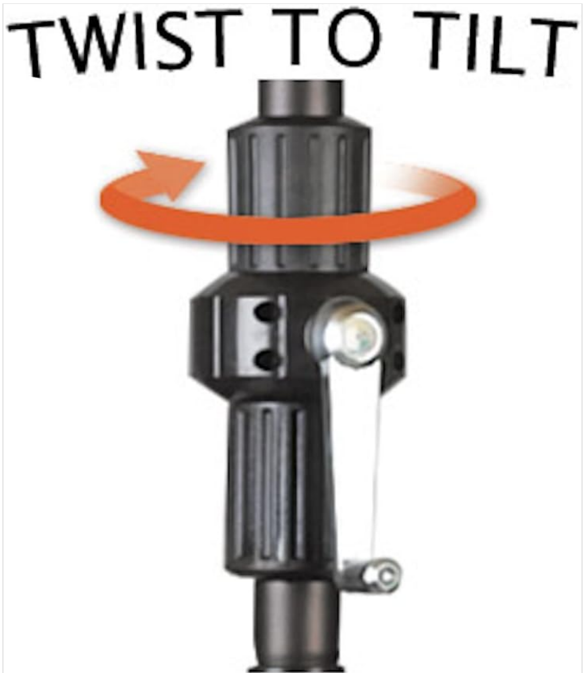
Figure 4.2: Diagram illustrating the "Twist to Tilt" collar mechanism, showing the direction of rotation for tilting the umbrella canopy.