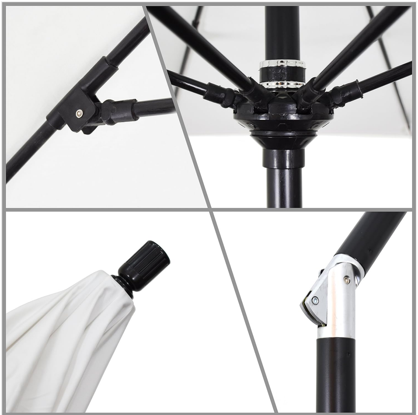
Figure 4.1: Close-up views of the umbrella's structural components, including the hub, ribs, and pole connection points, highlighting the robust construction.