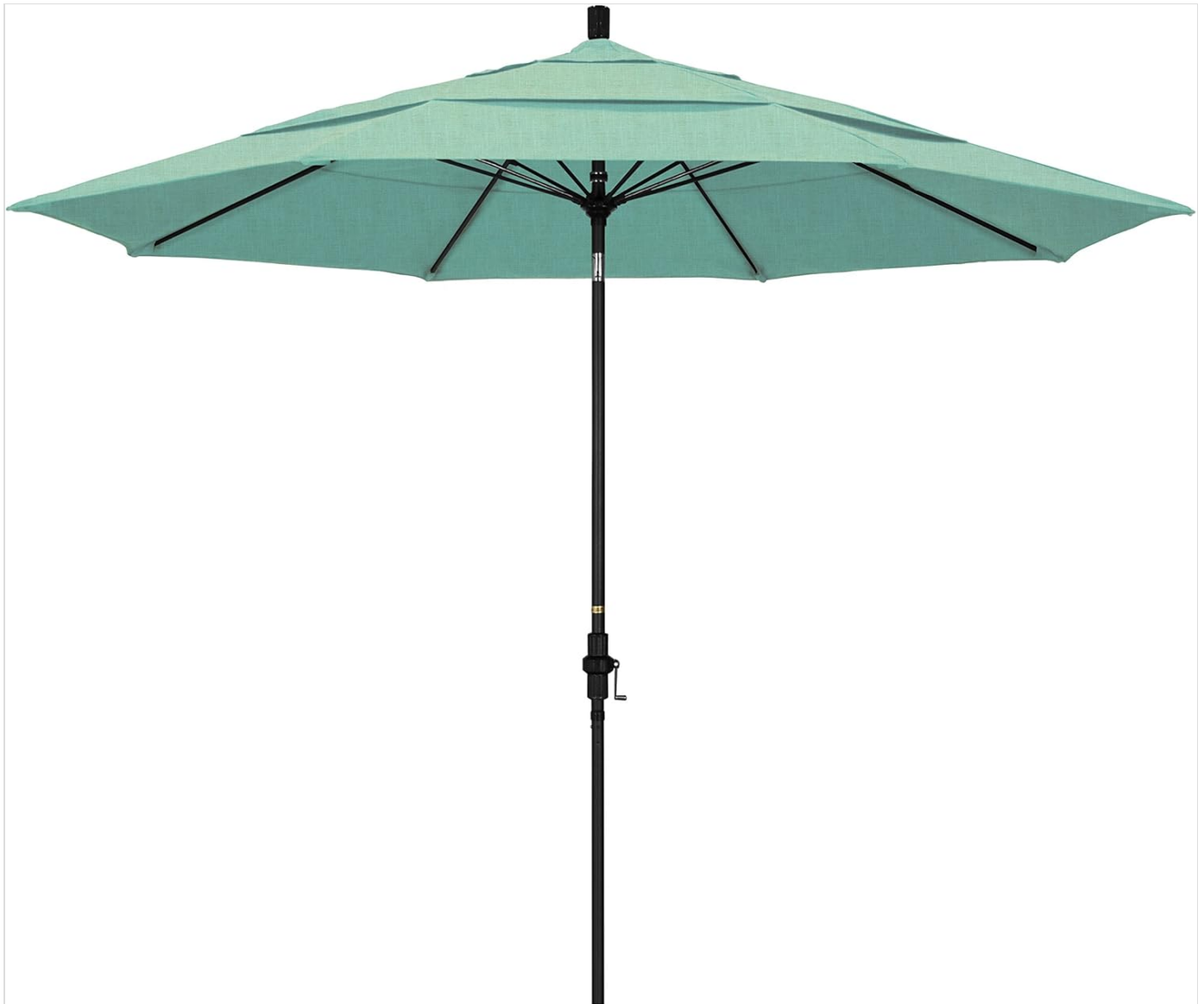
Figure 3.1: Fully assembled California Umbrella Spectrum Mist. This image shows the umbrella canopy, pole, and crank mechanism.