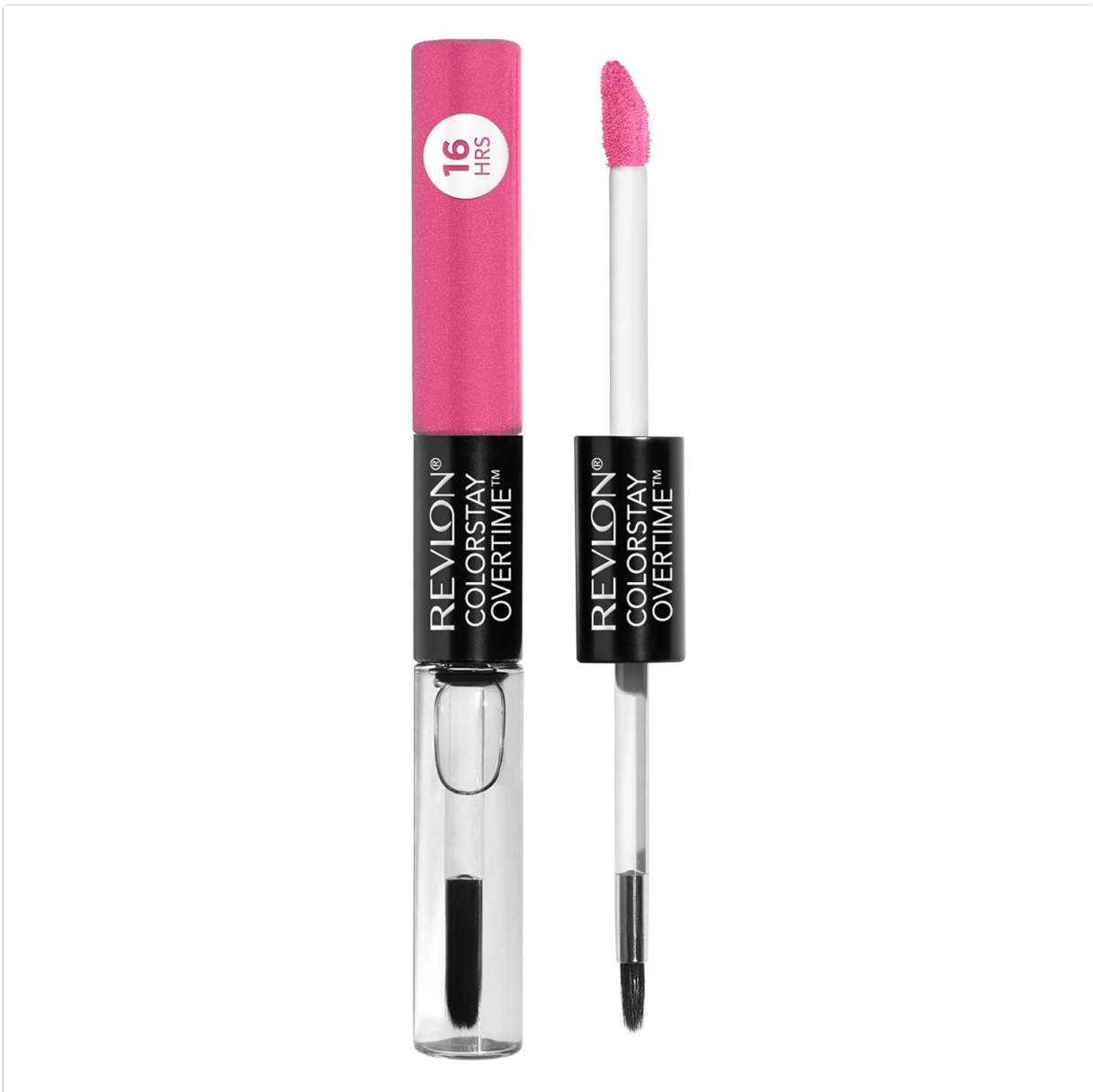
Image: REVLON ColorStay Overtime Lipcolor in 490 For Keeps Pink.