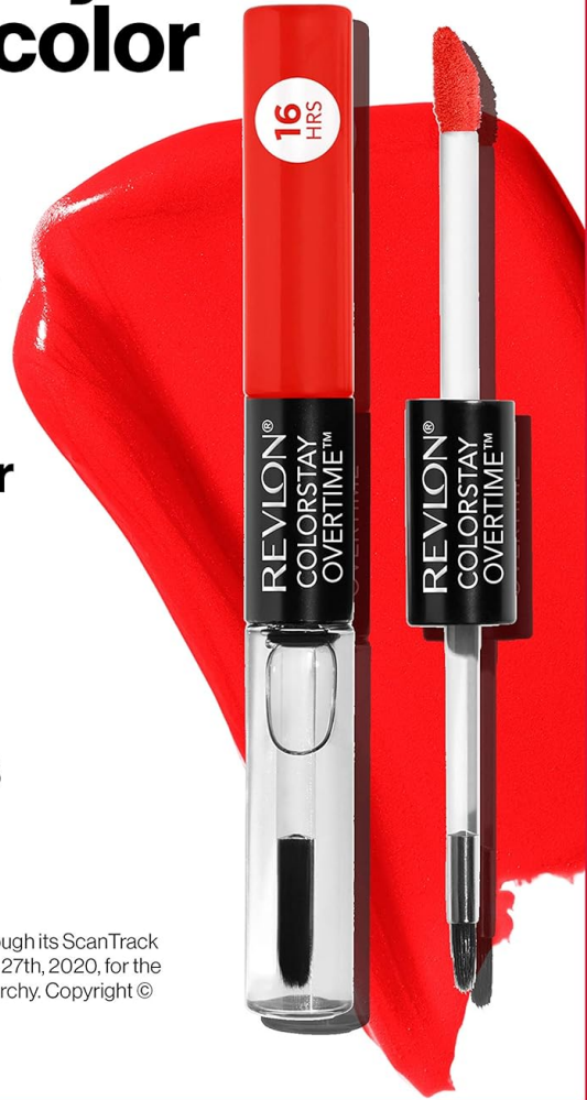
Image: Applying the clear lip gloss over the dried lip color.

*REVLON calculation based in part on data reported by Nielsen through its ScanTrack Service for the Lip Make-Up category for the 52 weeks ending June 27th, 2020, for the total U.S. market, xAOC, according to Revlon's custom product hierarchy. Copyright © 2020 Nielsen Consumer LLC.