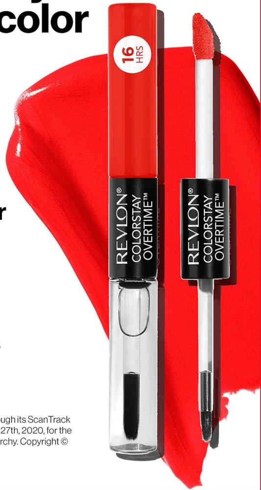
Image: Applying the liquid lip color with the doe-foot applicator.

*REVLON calculation based in part on data reported by Nielsen through its ScanTrack Service for the Lip Make-Up category for the 52 weeks ending June 27th, 2020, for the total U.S. market, xAOC, according to Revlon's custom product hierarchy. Copyright © 2020 Nielsen Consumer LLC.