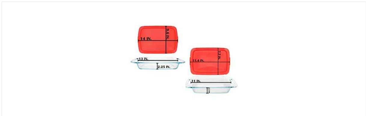
Image: The Pyrex Easy Grab dishes demonstrating their nesting capability for efficient storage.