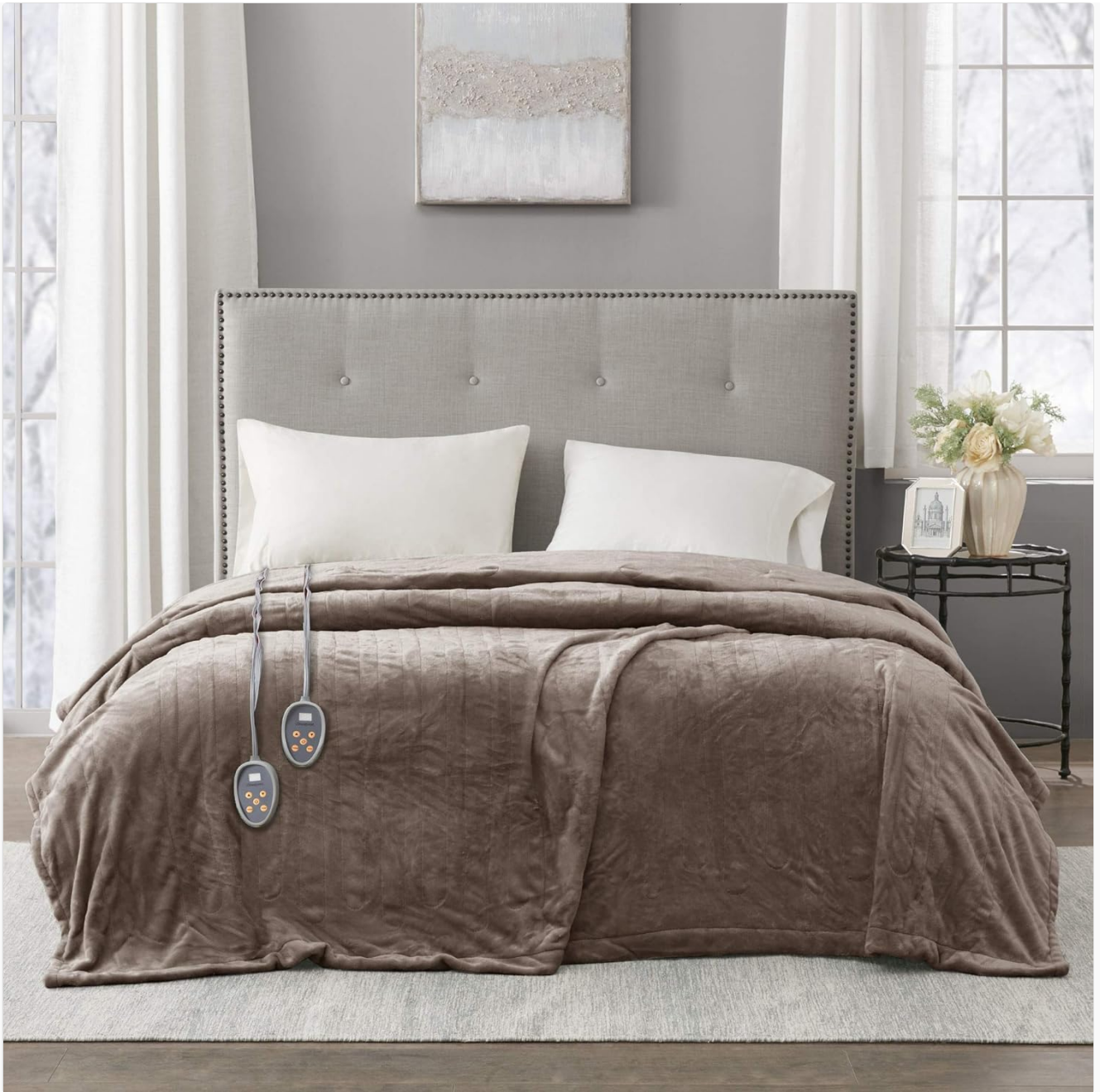
Figure 2: Beautyrest Queen Mink Heated Electric Blanket properly set up on a bed with controllers accessible.