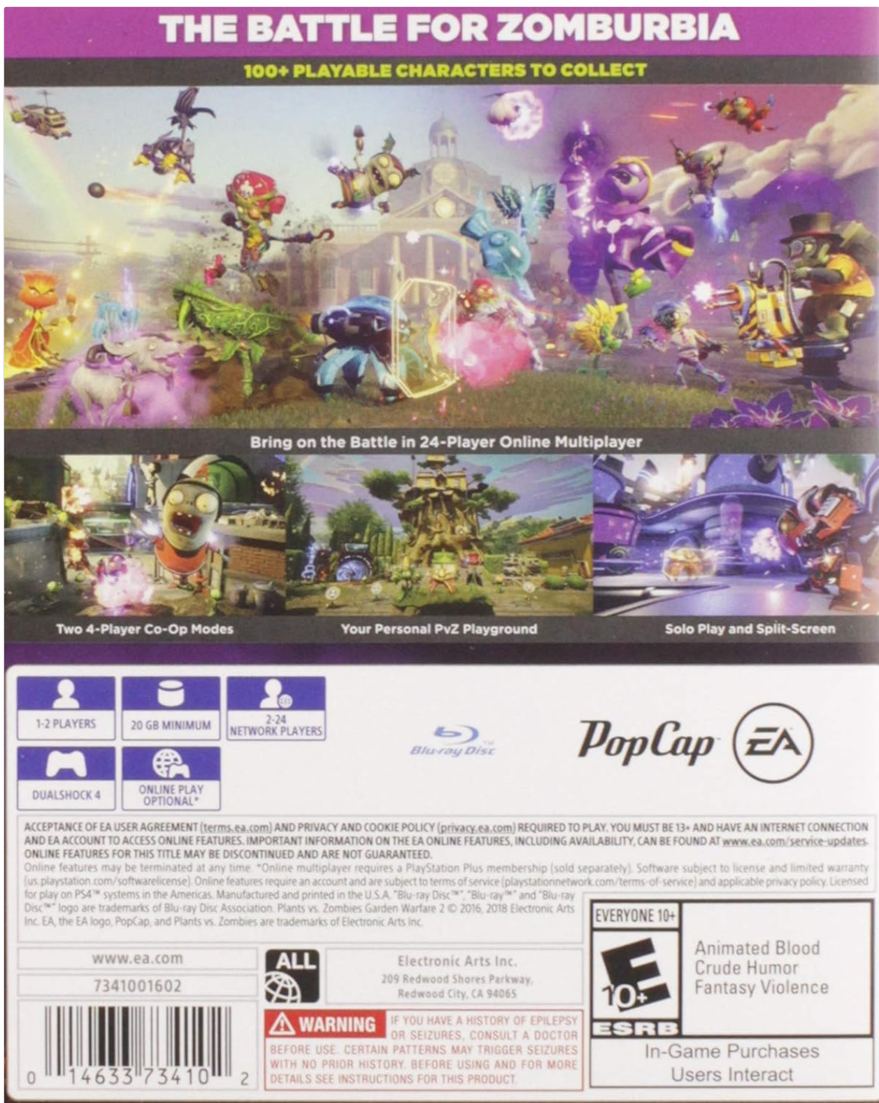
Image: Back cover of the game case, detailing the Limited 90-Day Warranty from Electronic Arts.