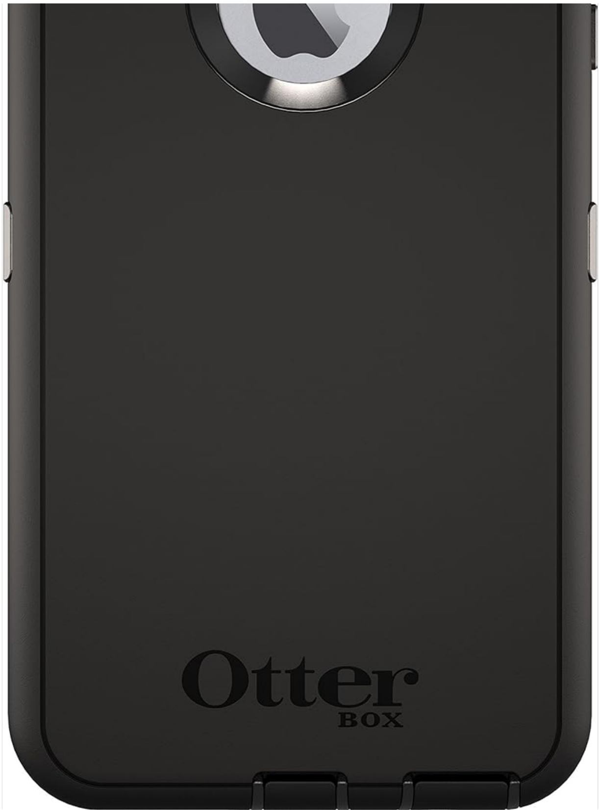
Image: The OtterBox Defender Series case, including the main case and the detachable belt clip holster.