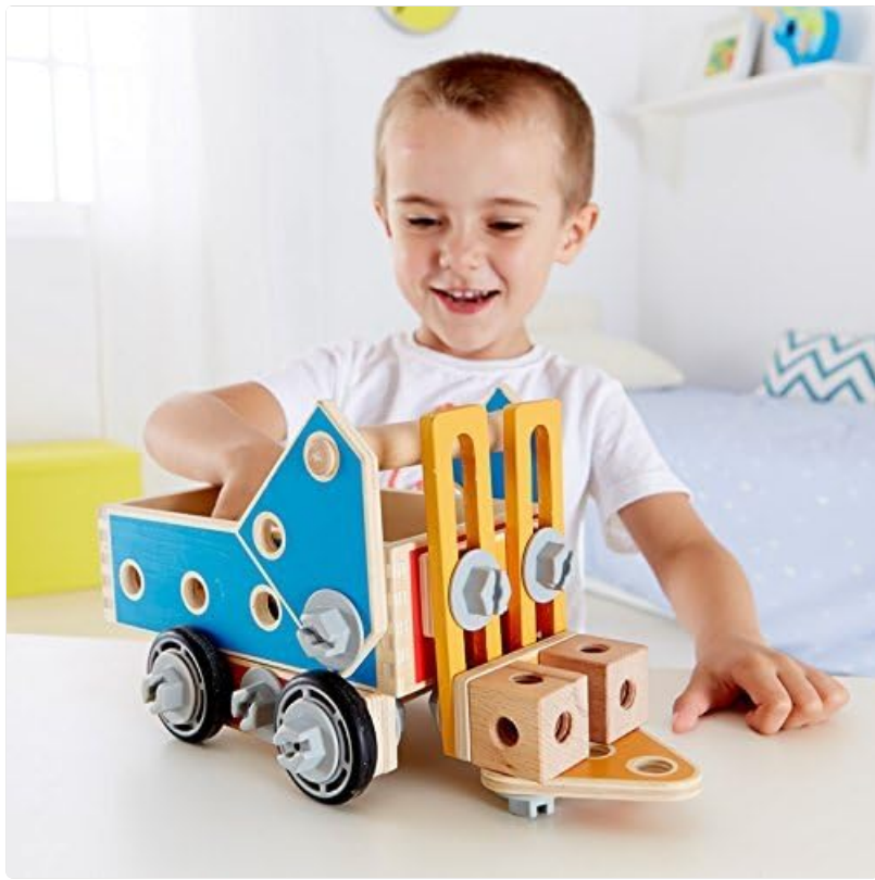
Image: A child interacting with a truck model assembled using the Hape Multifunction Builder Set E8039.