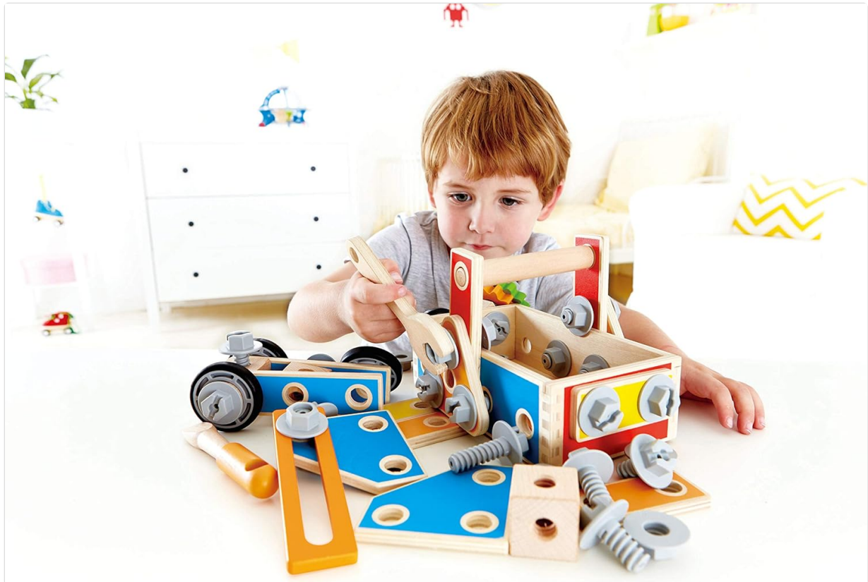
Image: A child actively engaged in building with the Hape Multifunction Builder Set E8039, demonstrating the use of the wooden screwdriver.

custom designs. Refer to the included idea booklet for inspiration.