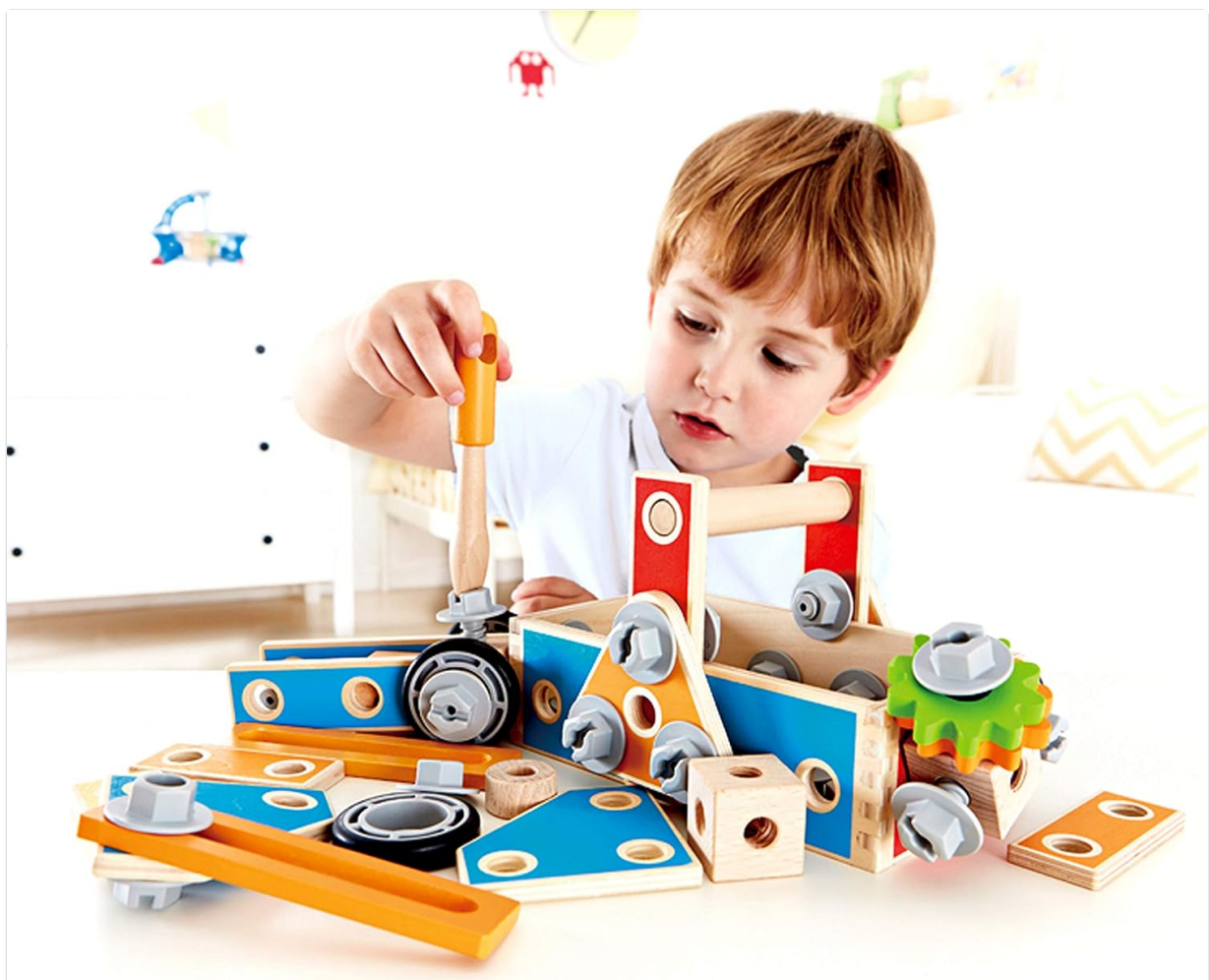
Image: Close-up of a child concentrating on building with the Hape Multifunction Builder Set E8039, highlighting the fine