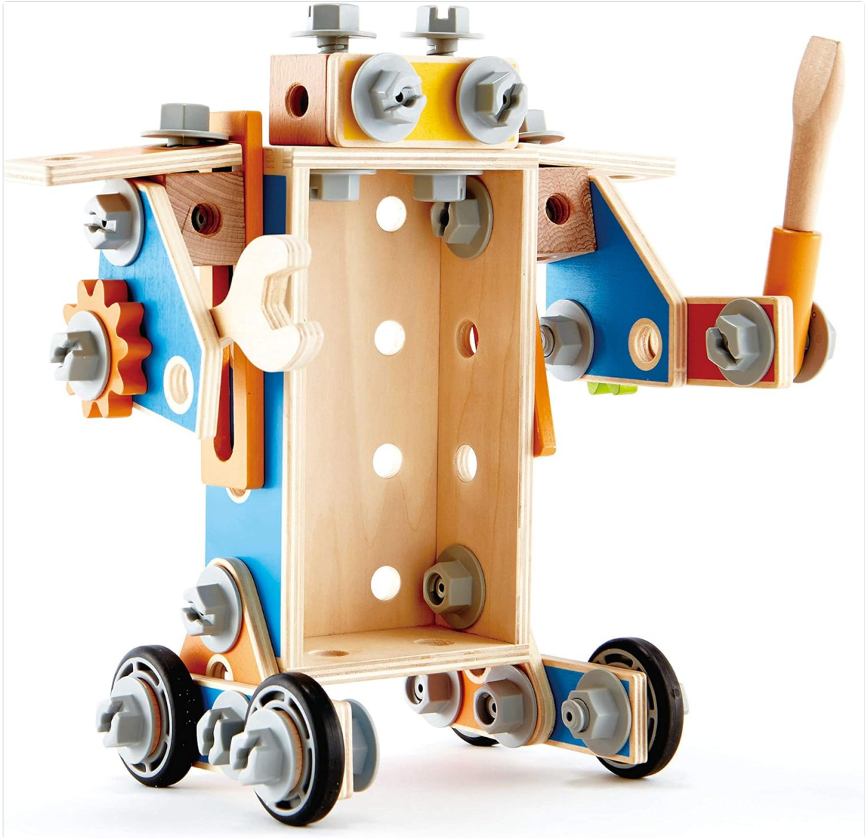
Image: An example of a robot constructed from the Hape Multifunction Builder Set E8039, illustrating the creative possibilities.