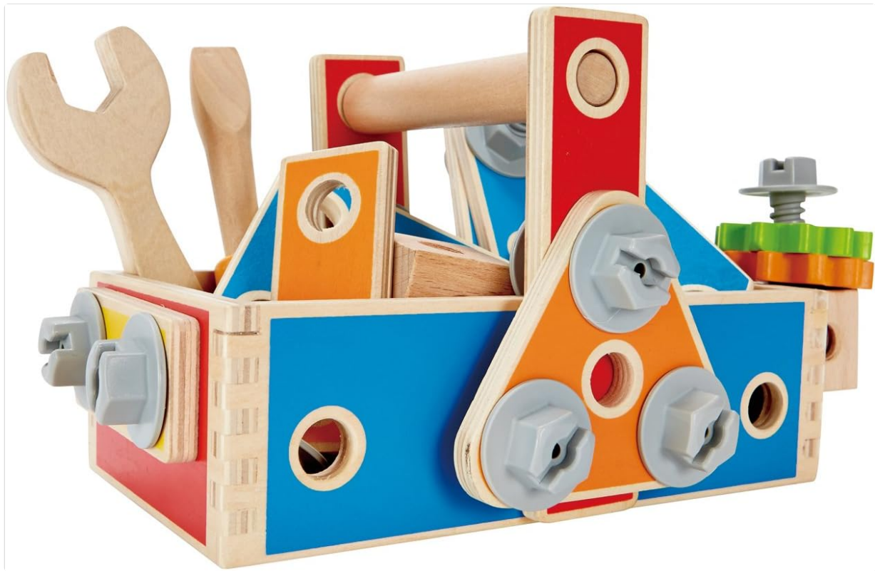
Image: The wooden toolbox component of the Hape Multifunction Builder Set E8039, showing how pieces can be stored.