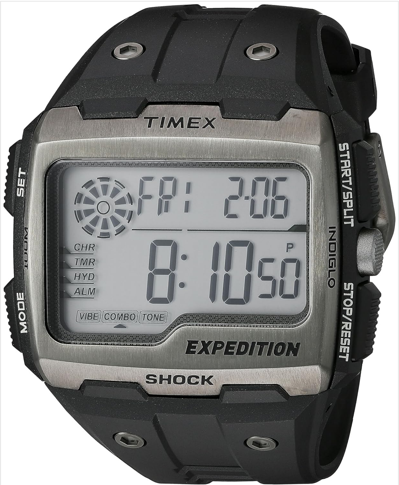
Image: Front view of the Timex Expedition Grid Shock Watch, displaying the digital time and date.