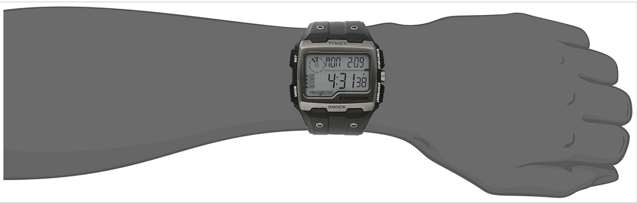
Image: The Timex Expedition Grid Shock Watch worn on a wrist, showing its size and fit.