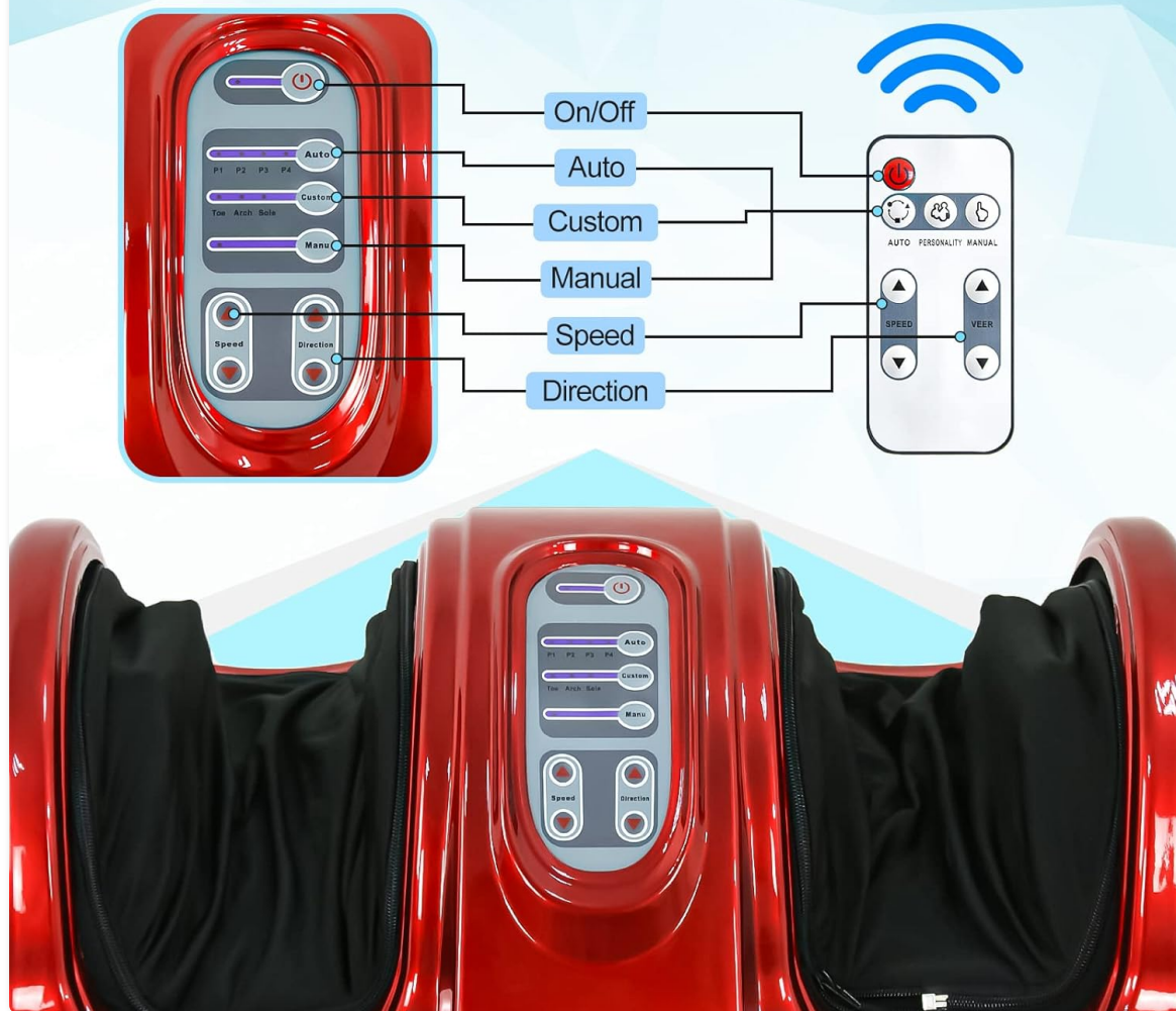
Image: The control panel of the ZENY Electric Foot Massager and its remote, detailing the functions of each button for easy operation.