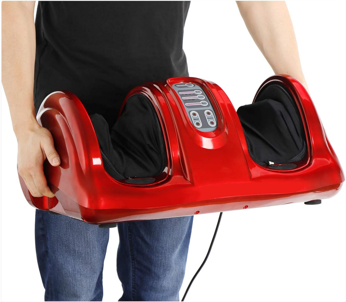
Image: A person holding the ZENY Electric Foot Massager, illustrating its compact design for easy setup and storage.