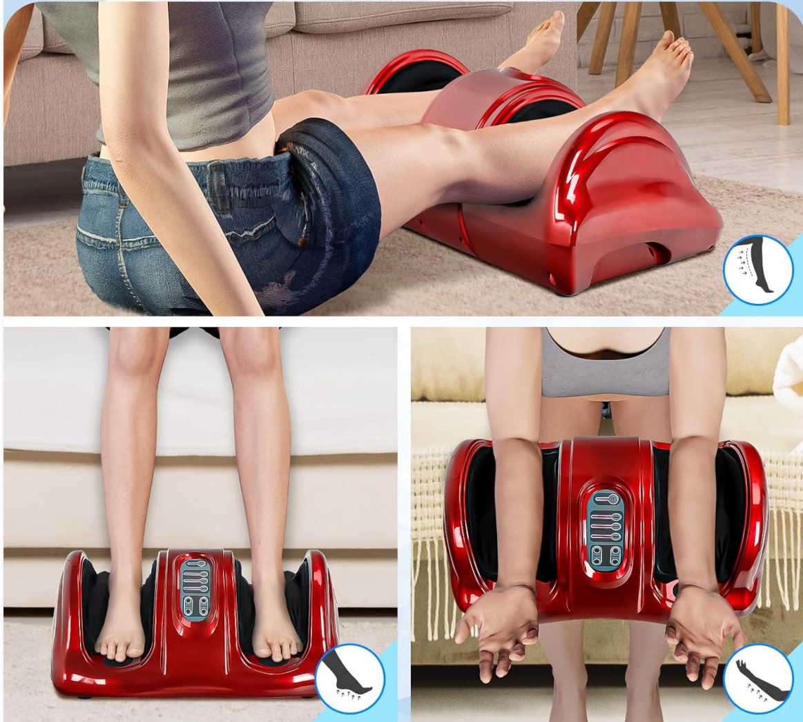
Image: The ZENY Electric Foot Massager shown in various positions, illustrating its use for massaging feet, calves, and arms.