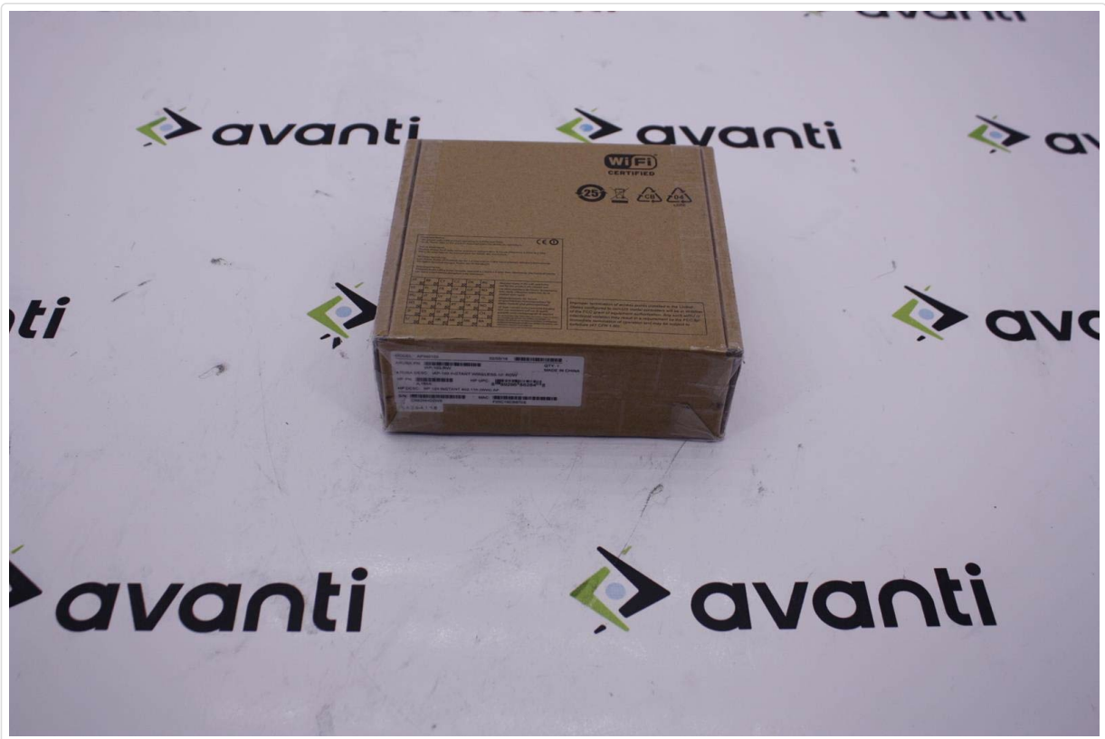
Figure 3.1: Top view of the Access Point with serial number label. The label includes Serial Number CN62HHD2W5 and MAC Address F05C19CB87BE .