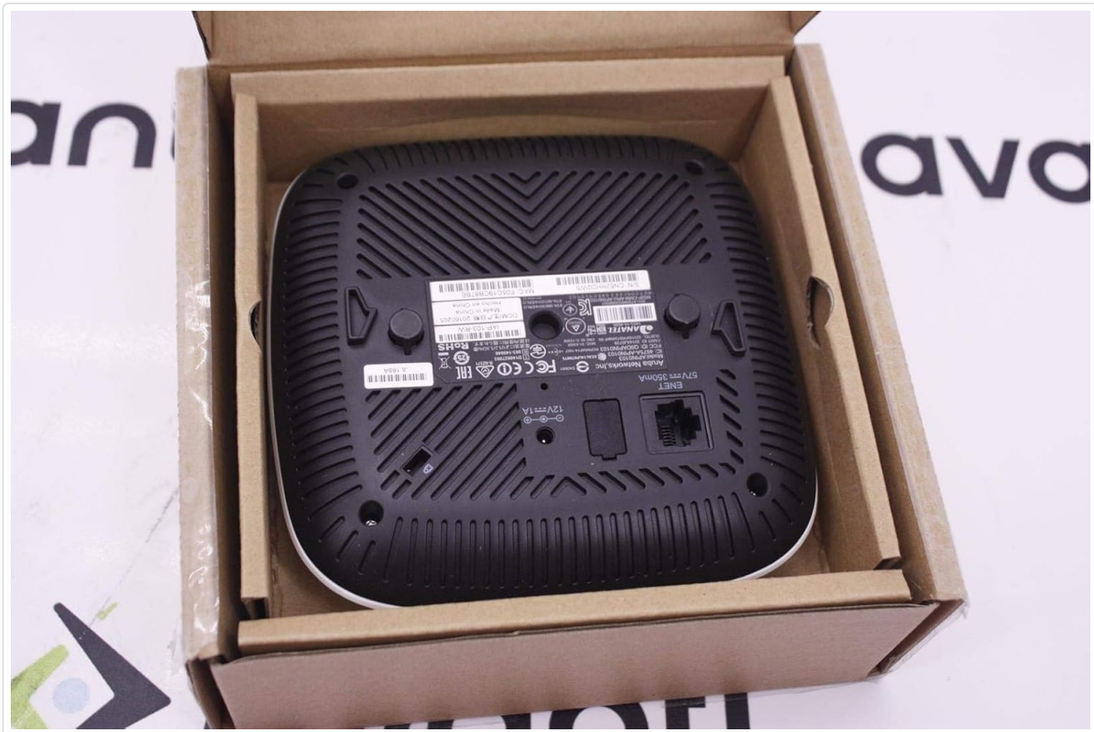
Figure 3.3: Bottom view of the Access Point, showing the Ethernet port, power input, and mounting points.