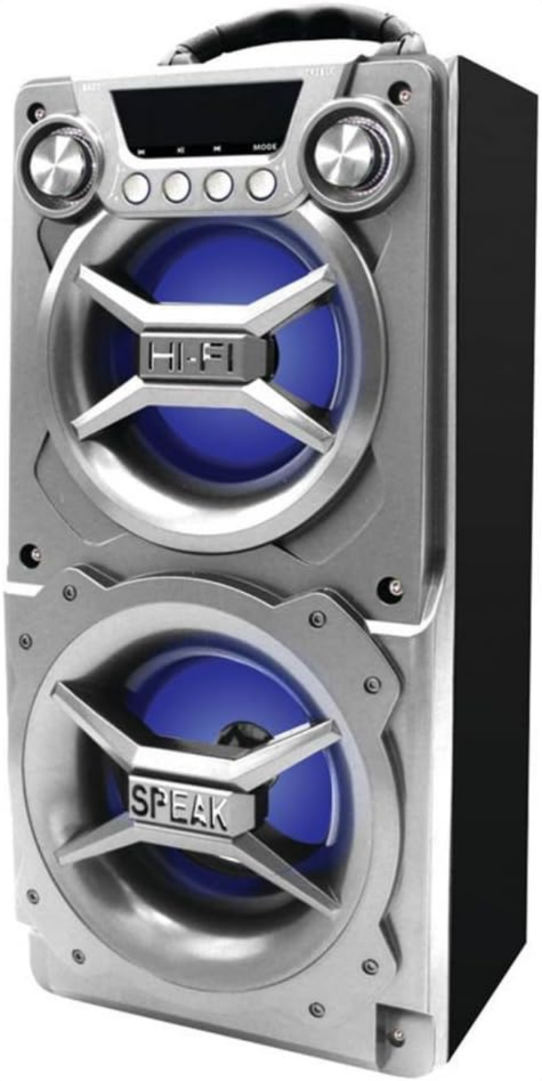
This image displays the front of the SYLVANIA Portable Bluetooth Speaker in silver, featuring two large speaker grilles with illuminated blue LED lights, and control knobs for bass and treble at the top.

The speaker measures approximately 8 inches (Depth) x 7 inches (Width) x 15 inches (Height) and weighs 1 pound.