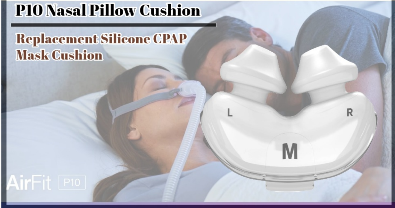
Image: A couple sleeping peacefully, both wearing ResMed AirFit P10 masks. The image emphasizes the quiet operation of the mask, attributed to its QuietAir vents, which reduce sound to 21 decibels.