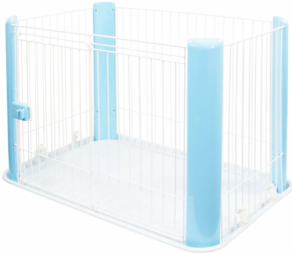
Image: The Iris Ohyama Pet Playpen CLS-960, showcasing its design and suitability for small pets.