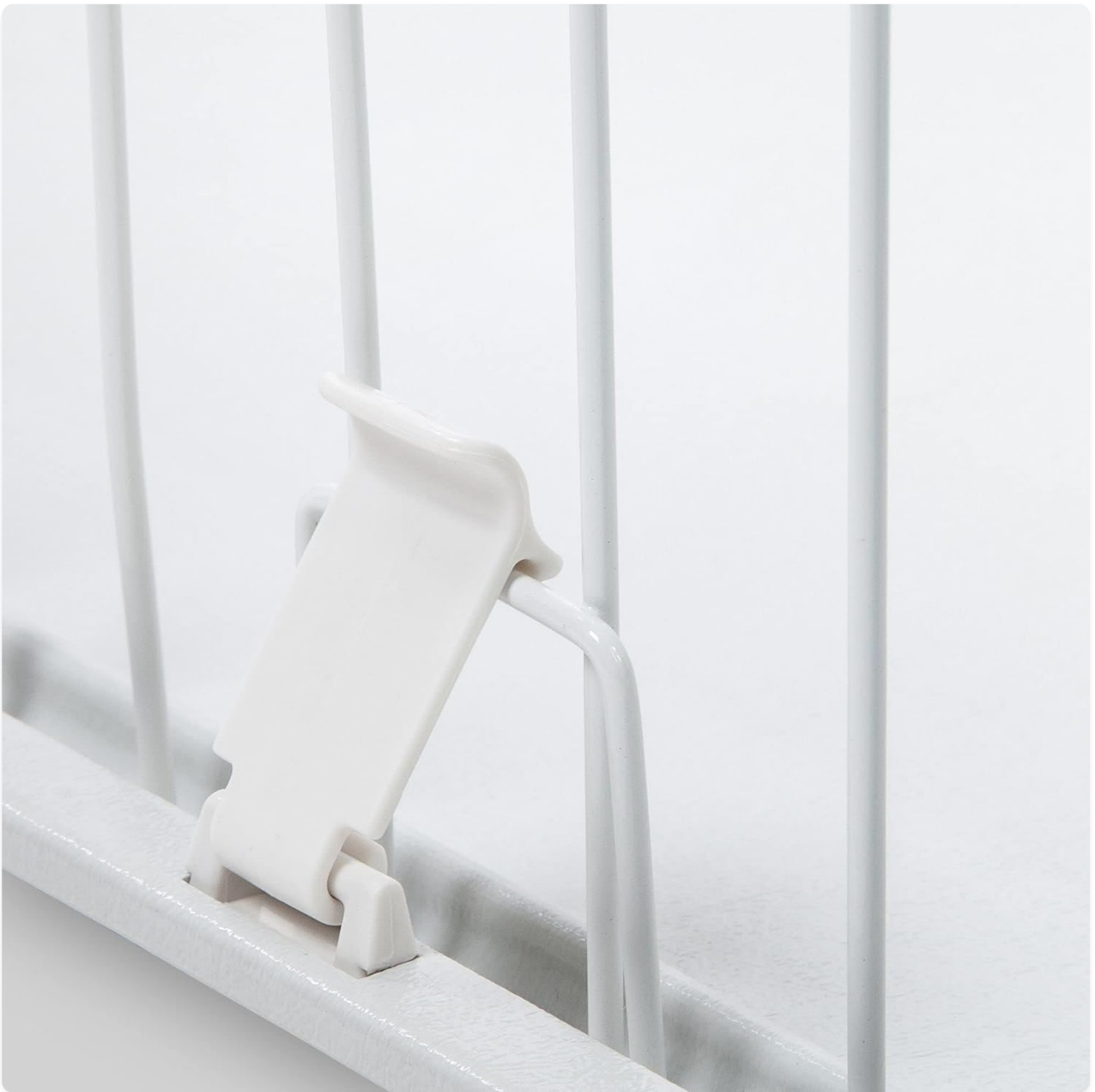
Image: Detail of the secure lockable sliding door.