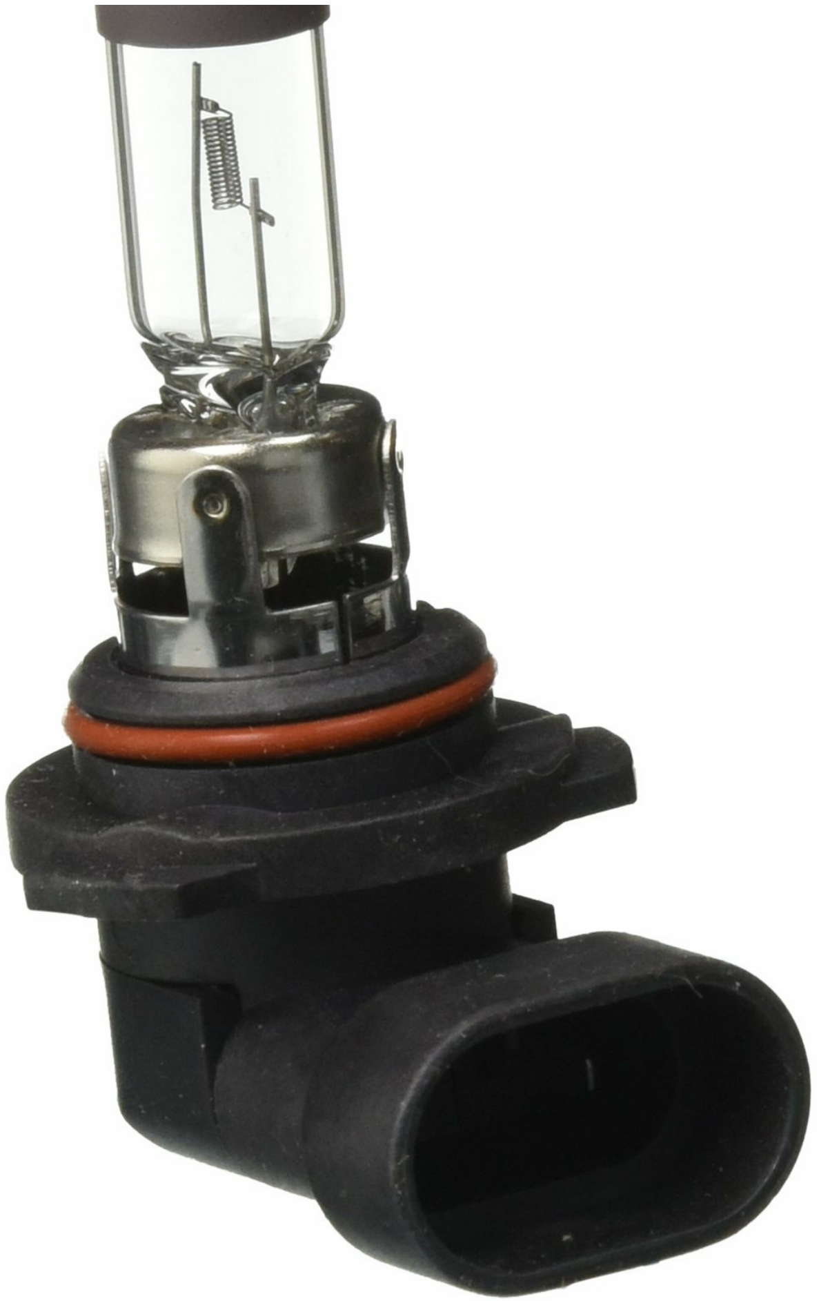
A close-up view of the Philips 9006C1 Standard Halogen Light Bulb, showing the clear glass capsule, filament, and the black plastic base with electrical connector.