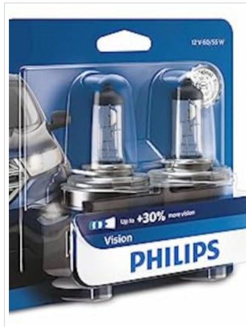
The retail packaging for Philips Vision bulbs, showing two halogen bulbs inside a clear plastic blister pack with 'PHILIPS' branding and 'Up to +30% more vision' text.